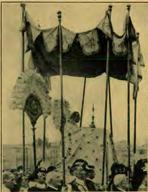
When Pope Pius emerged from the Vatican, he was borne in regal splendor.