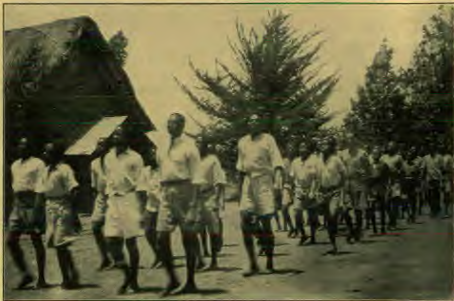
After the gospel of Christ and the work of the missionary transformed the village