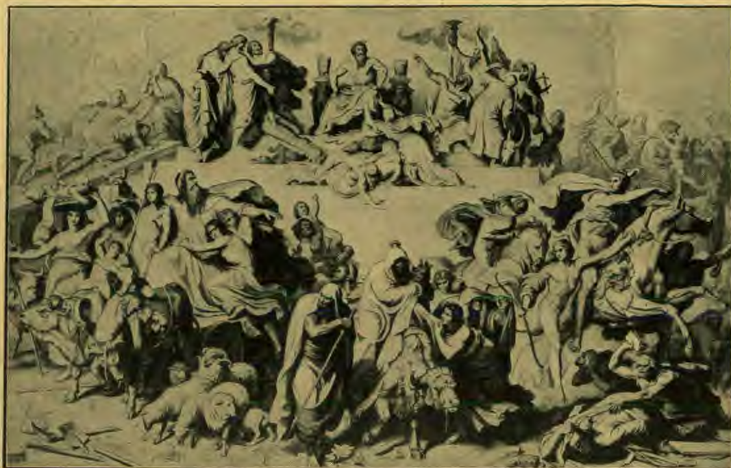
The story of the Sabbath and of all previous history was carried out to the four corners of the earth by the peoples dispersed at the tower of Babel.

Do NOT miss a word of this article; but if you have to skip any, do not miss the last three paragraphs.