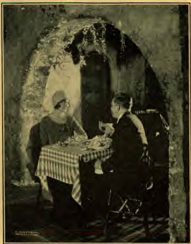
What we eat and drink are the greatest factors in lengthening or shortening our lives.