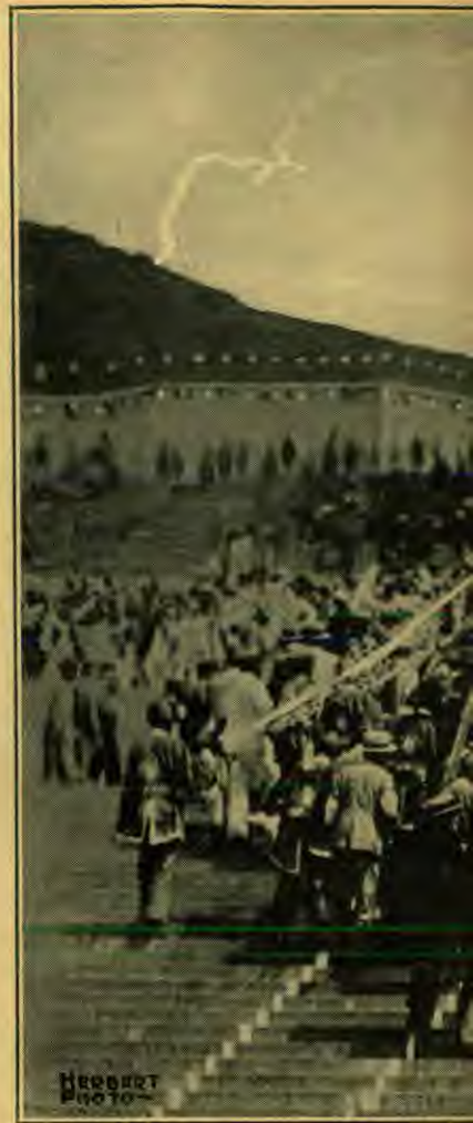
Recently the founder of the Chinese Republic, Yat-sen, was reburied with stately pomp in a magnificent mausoleum at the new capital of China, Nanking. Here is the funeral cortege moving to the tomb.

A former minister of the Episcopal Church in China, who is one of these new leaders, called at my office the other day and showed me a document of nineteen articles outlining the plan and constitution of the proposed "Universal Church." He spoke as earnestly and enthusiastically as if success were already assured. It is the aim first thoroughly to organize this church in China free from foreign leadership and influence, and independent of all other denominations, then to send missionaries to Christian countries to organize the church there. If these plans carry, English-speaking Chinese evangelists will tour America and England and Continental countries calling upon Christians