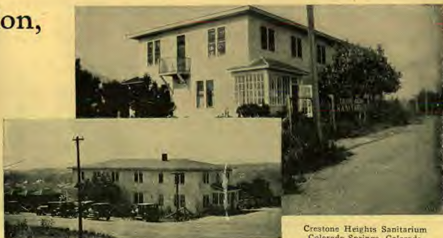
Crestone Heights Sanitarium Colorado Springs, Colorado

REST, recreation, and medical care may be yours at any one of this chain of sanitariums. Each is ideally located with surroundings conducive to quietness and comfort and health. An able staff of physicians, surgeons, and nurses, with complete equipment, will give you the very best possible