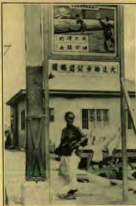
An epidemic of suicides has seized the city of Shanghai, an average of three persons a day taking their lives. Everywhere the officials are displaying posters like the one above that reads, "Thou shalt not kill thyself! You shall not die. Turn back at once and resume your life!"

Watts has said, "Death is that kind nurse who puts all as her children to bed." Some one has called death a dreamless sleep. A sleep! Is death a sleep? What did Jesus call it? Speaking of Lazarus He said, "Our friend Lazarus sleepeth." John 11:11. Paul said, "We shall not all sleep." 1 Corinthians 15:51. When writing to the Thessalonians he said, "I would not have you to be ignorant, brethren, concerning them which are asleep." 1 Thessalonians 4:13. Luke also believed that death is a sleep. Concerning the death of Stephen he wrote, "And he kneeled down, and cried with a loud voice, Lord, lay not this sin to their charge. And when he had said this, he fell asleep." Acts 7:60.