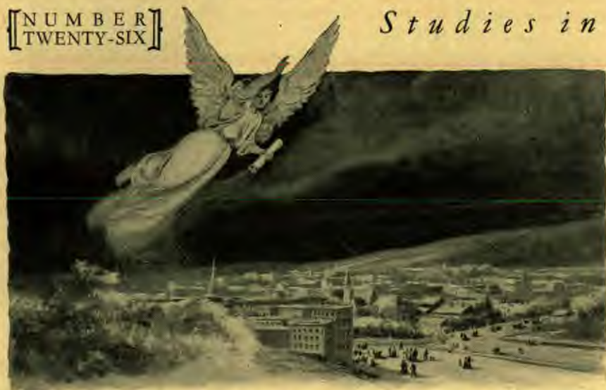
The third angel's message is the climax and culmination of three reform messages.