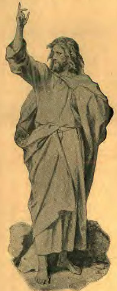
Christ "was in all points tempted like as we are, yet without sin."

Temptation is a suggestion to do that which is wrong. When Christ dwelt here with us in human flesh, He was subject to temptation; and most certainly we cannot expect to escape. It is what we do with the temptation that determines whether or not we sin. We cannot keep Satan from sowing the seed in our minds, but, with the help of God, we can keep from watering that seed with our thinking until it germinates.