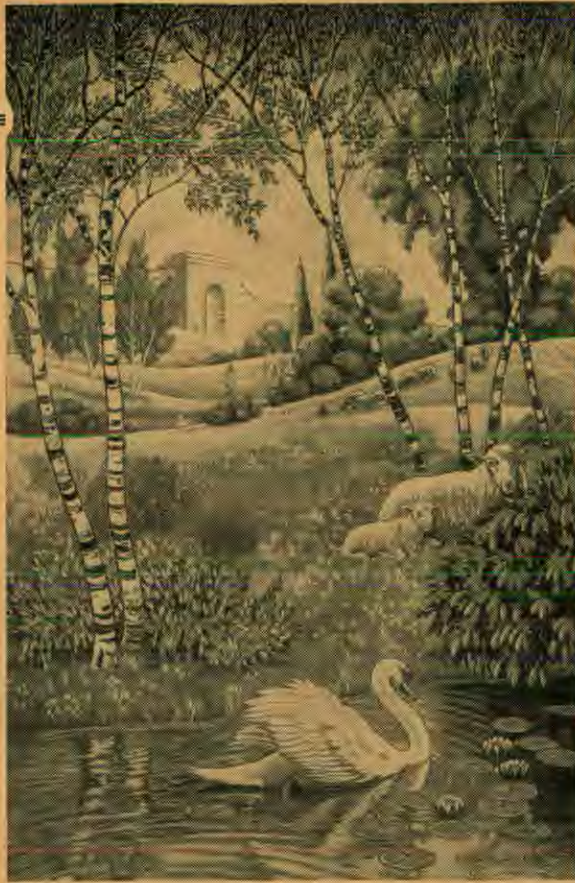
God will make a new earth to carry out His original plan that was ruined by sin.