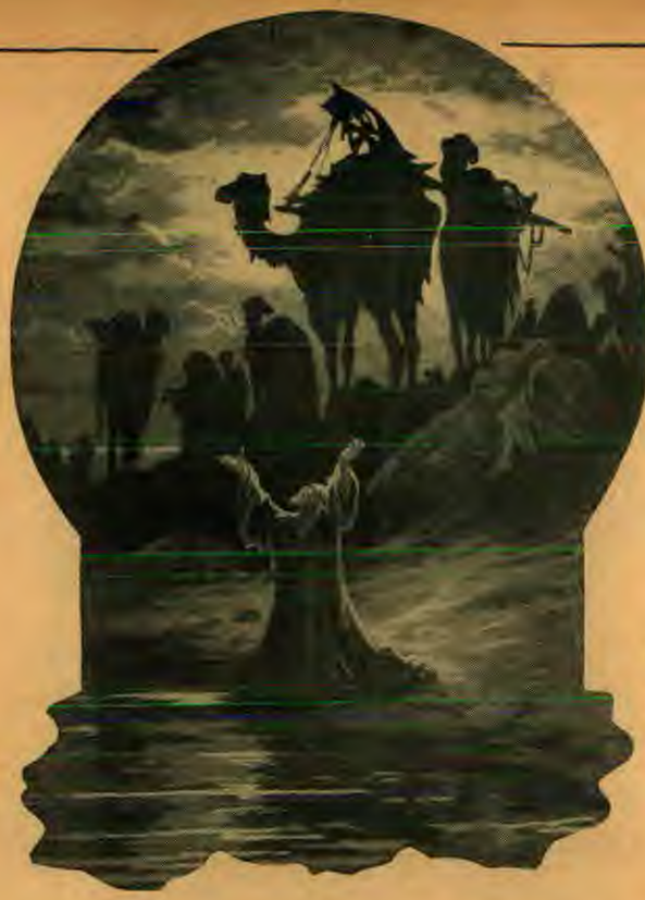
Jacob, in fear of his life, confessed to God, who forgave and blessed him.