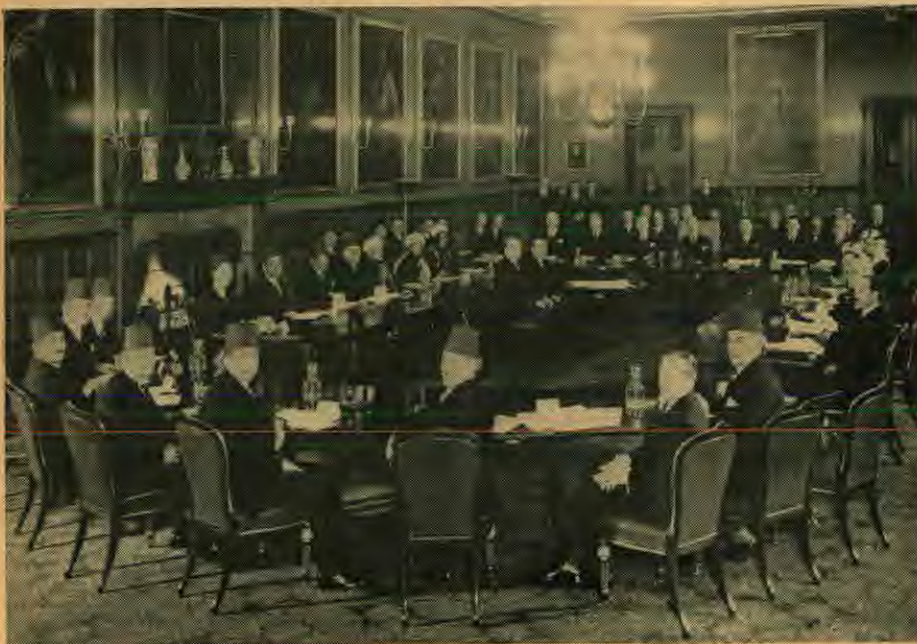
Arab delegates to the conference on Palestine in session at St. James's Palace, London. The effort to satisfy Jewish and Arab aspirations was unsuccessful.

As we have said all along, Christ is no more interested in the unconverted