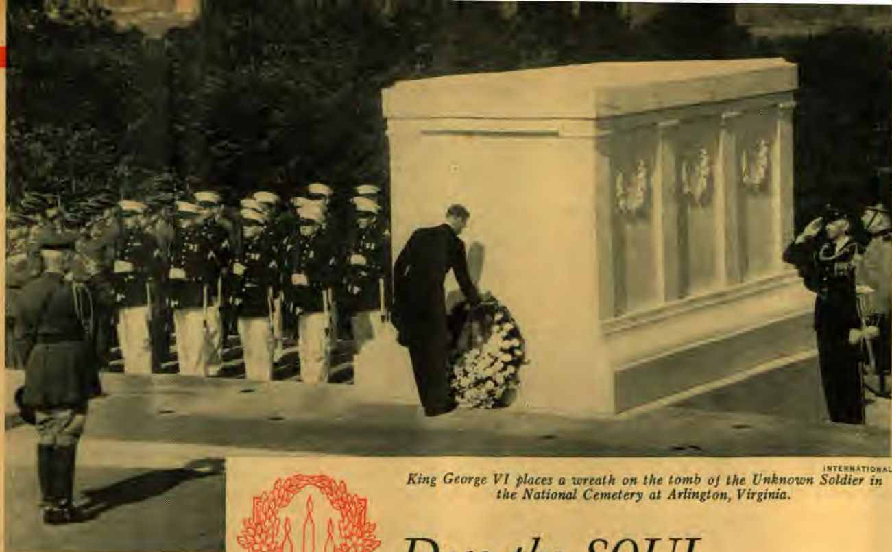
INTERNATIONAL King George VI places a wreath on the tomb of the Unknown Soldier in the National Cemetery at Arlington, Virginia.