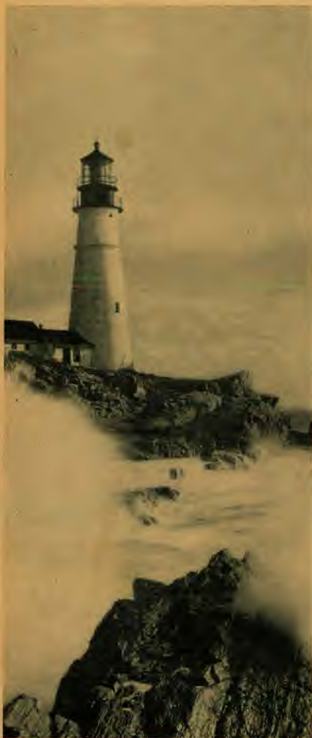
"Thy word is a lamp unto my feet, and a light unto my path." Psalm 119:105.

A T THE BASE of the famous Eddystone lighthouse, inscribed in the enduring rock foundation, are these very fitting words: "To give light and to save life." And such is the exact purpose of the living word of God. Long before any lighthouse was ever erected, God sent messages of peace, comfort, and light to the human family through His chosen messengers. Today we have His inspired word for our help and guidance.