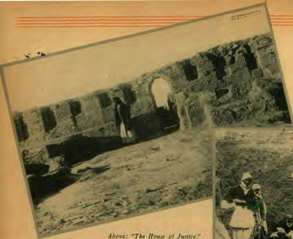
Above: "The House of Justice," recently uncovered in Ur of the Chaldees. Right: In this chamber of an ancient cemetery of Ur was found a wealth of gold jewelry.