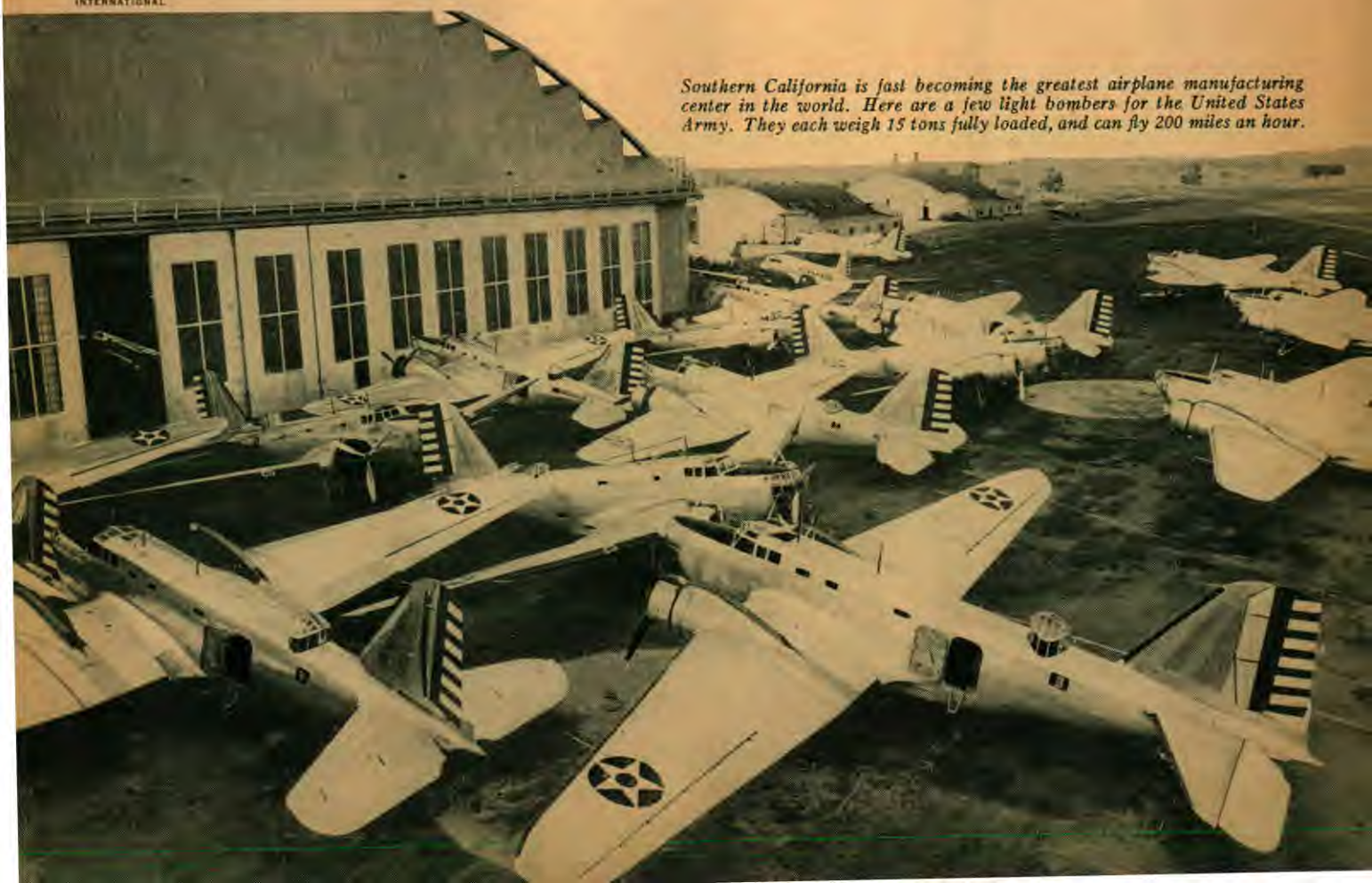
Southern California is fast becoming the greatest airplane manufacturing center in the world. Here are a few light bombers for the United States Army. They each weigh 15 tons fully loaded, and can fly 200 miles an hour.