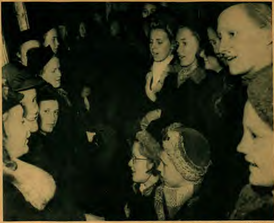
Finnish children singing in an air-raid shelter while the Russian bombers roar overhead. Such a spirit is unconquerable!

Thank God for those three words, "a short time!" A limit has been set to the devil's activities. Evil may seem to overspread the whole wide world until it may be said once more of man, as was said of him before the Flood, that "every imagination of the thoughts of his heart" is "only evil continually;" nevertheless evil shall not triumph. Despite all the