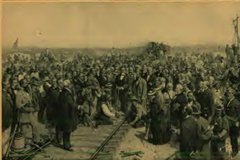
The ceremonies at Promontory Point, Utah, marked the completion of 1,776 miles of transcontinental railroad that opened up the West.