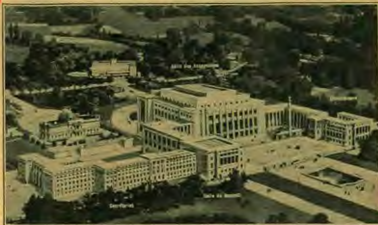
The palace of the League of Nations at Geneva—a monument to some men's ardent hope for peace.

held in the temporary structure across the Quai de Mont Blanc, farther in the heart of the city itself.