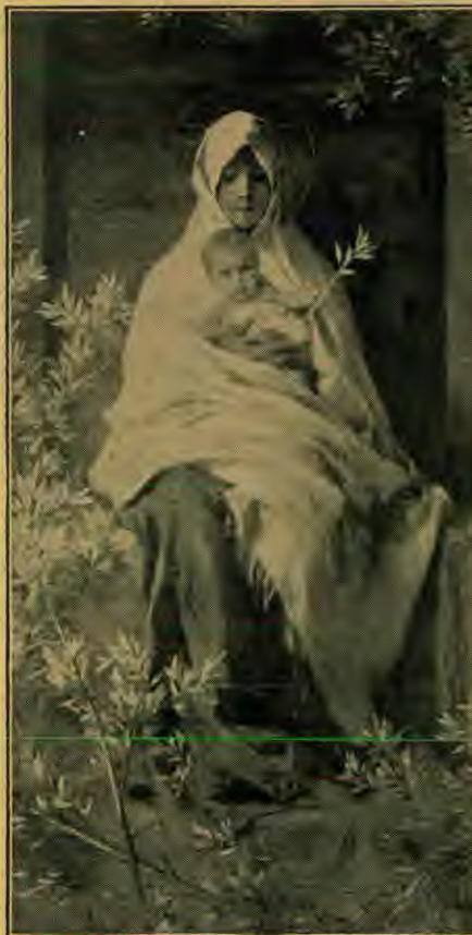
Worship of a woman and her infant son can be found in ancient pagan religions.

As has already been pointed out, however, when the Babylonian worshiper prayed, "Mother goddess, . . . exalted lady whose command is mighty. . . . O my mistress, establish for me a place of rest! Absolve my sin; lift up my countenance. . . . Mother of the house supreme, may the supplication address thee" (Sayce), he was praying to more than just the female sun, for this female deity also bore the titles, "Lady of the abyss" and "Lady of the world." Her