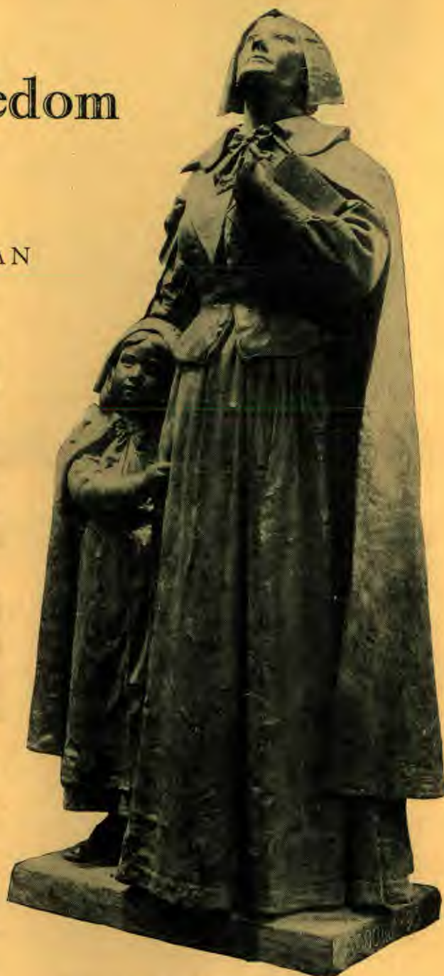
Freedom of religion is a precious heritage—one we must be alert to guard and preserve.

Of course, democratic society must protect itself from indecent and insincere abuses of the privilege of freedom of speech. It must protect itself from organized powers which would overthrow all freedom. It is not difficult, however, to distinguish the