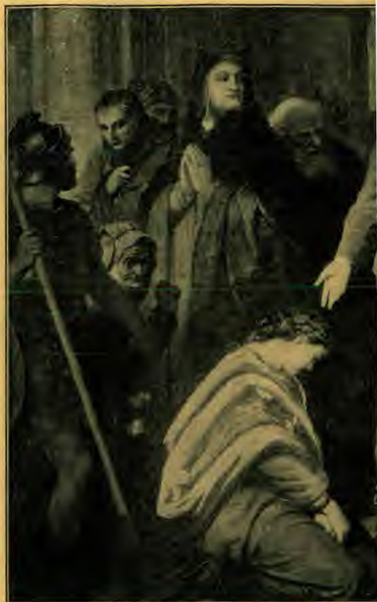
"Go, and sin no more," said Jesus to the woman truly repented of and forsaken.

Another interesting Bible passage is Exodus 17:14, where we read these words of the Lord against the wicked nation of Amalekites: "I will utterly put out the remembrance of Amalek from under heaven." And this is literally true today,