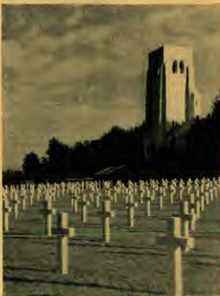
Only the keys in the hand of Jesus Christ can unlock the door that death closes in front of us.

Until we have claimed God's four freedoms—freedom from sin, freedom from want, freedom from fear, and freedom from death—we do not know the power of the gospel. Shall we dwell in slavery when Jesus has bought us with His life blood? "Stand fast therefore in the liberty wherewith Christ hath made us free." Galatians 5:1.