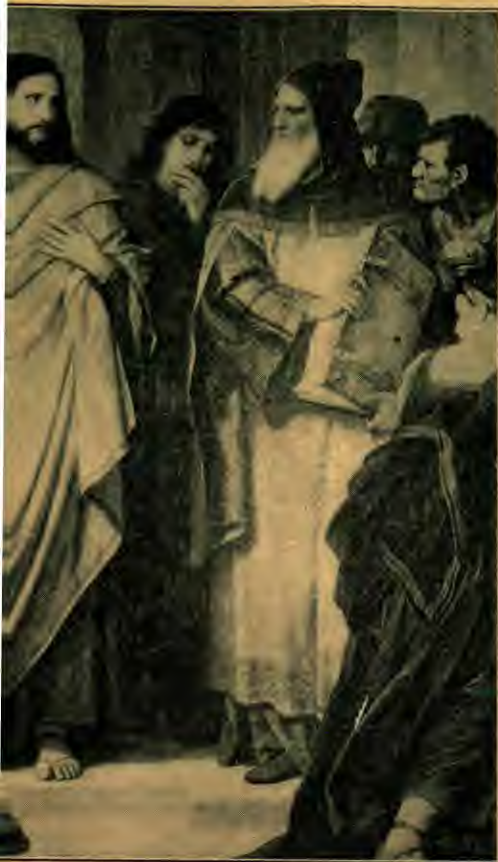
by the Pharisees of adultery. When sins are forgotten by God.

ers of Him; but they are rejected as workers of iniquity. And Jesus will say to all such: