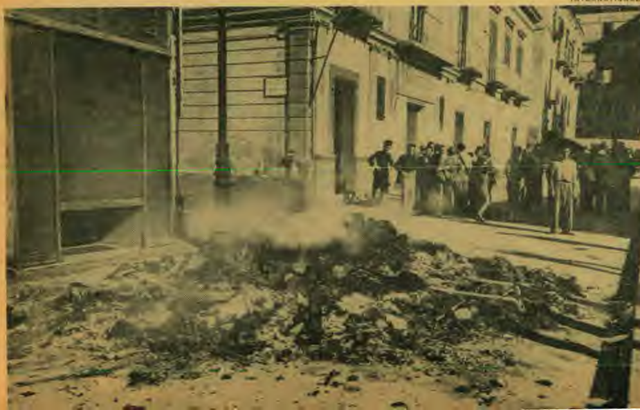
A new day comes to Italy with civilians making a bonfire of Fascist literature as soon as their freedom was restored by the armies of the United Nations.