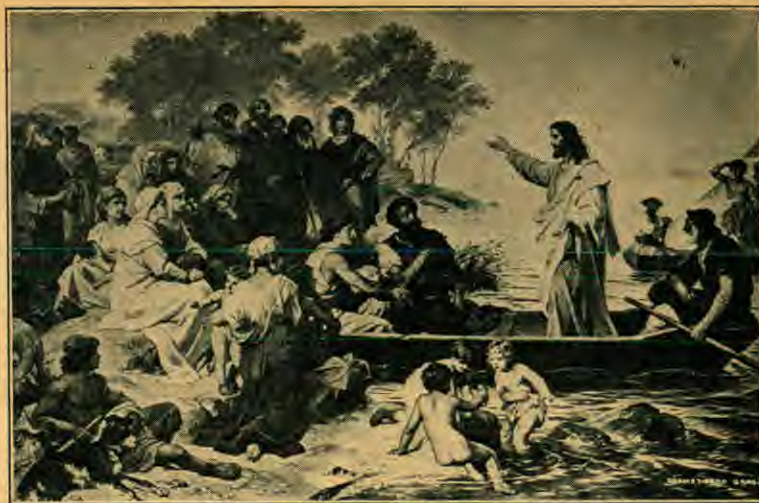
Jesus Christ realized that the material needs of man are important, but that the kingdom of God is the paramount search of humanity.

THE wisest Teacher this world ever knew enunciated this great rule of life: "Seek ye first the kingdom of God, and His righteousness; and all these things shall be added unto you." Matthew 6:33.