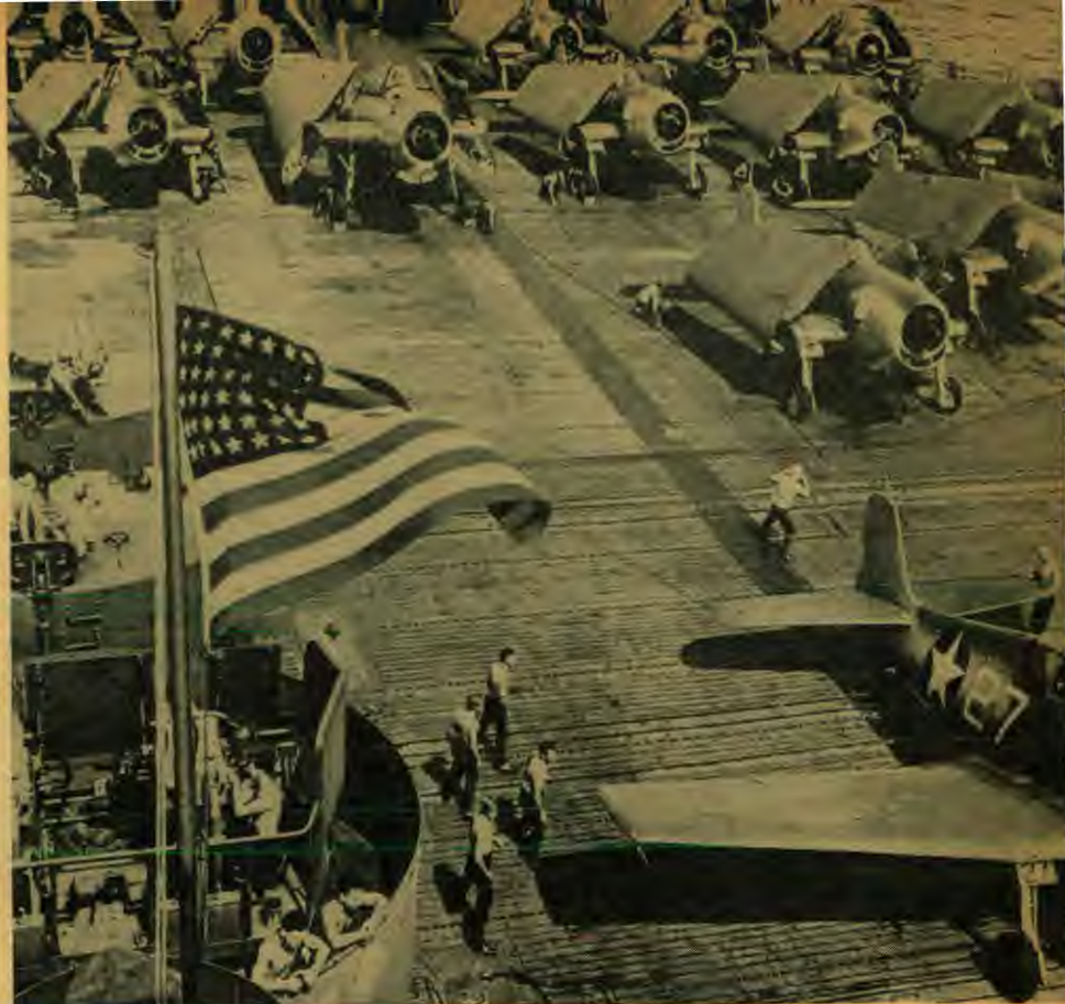
U. S. NAVY, INTERNATIONAL Fighter planes with folded wings aboard one of the great new aircraft carriers of the U. S. Navy. By the end of 1943 the Navy will have twice as many carriers as in 1941, and 18,000 planes instead of 1,800.