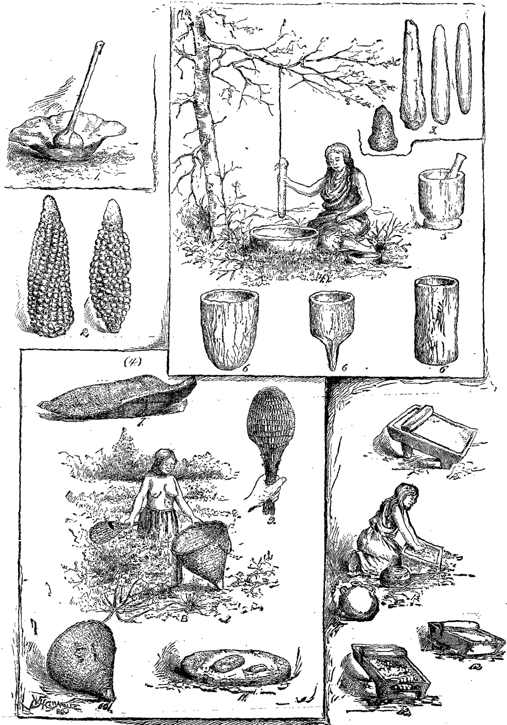
Milling Implements Used by Women of India.

may be two or more wives of the same husband. There are sure to be aunts and sisters and sisters-in-law, daughters, daughters-in-law, some married, some widows, people of all ages, and children of many degrees of relationship.