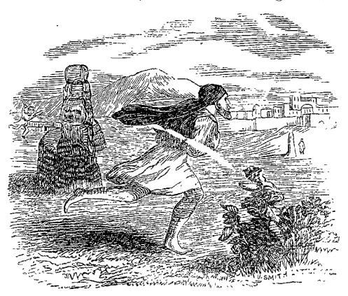
Fleeing to a City of Refuge.

We, too, need a place of safety. Dangers surround us on every hand; an enemy, strong, cruel, and cunning, is pursuing us; and with him are hosts of evil agents,