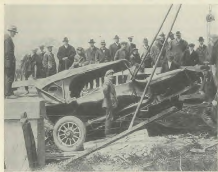
This illustration shows a $3,200 McLaughlin wrecked within a few rods of the editor's home, by an intoxicated driver. The indulgence in intoxicants and the unreasonable craze for speed are responsible every year for the loss of thousands of human lives and millions of dollars' worth of property.

knavish little sprite in one of Shakespeare's plays, "What fools these mortals be!" well expresses the character man has earned by many of his deeds and ways.