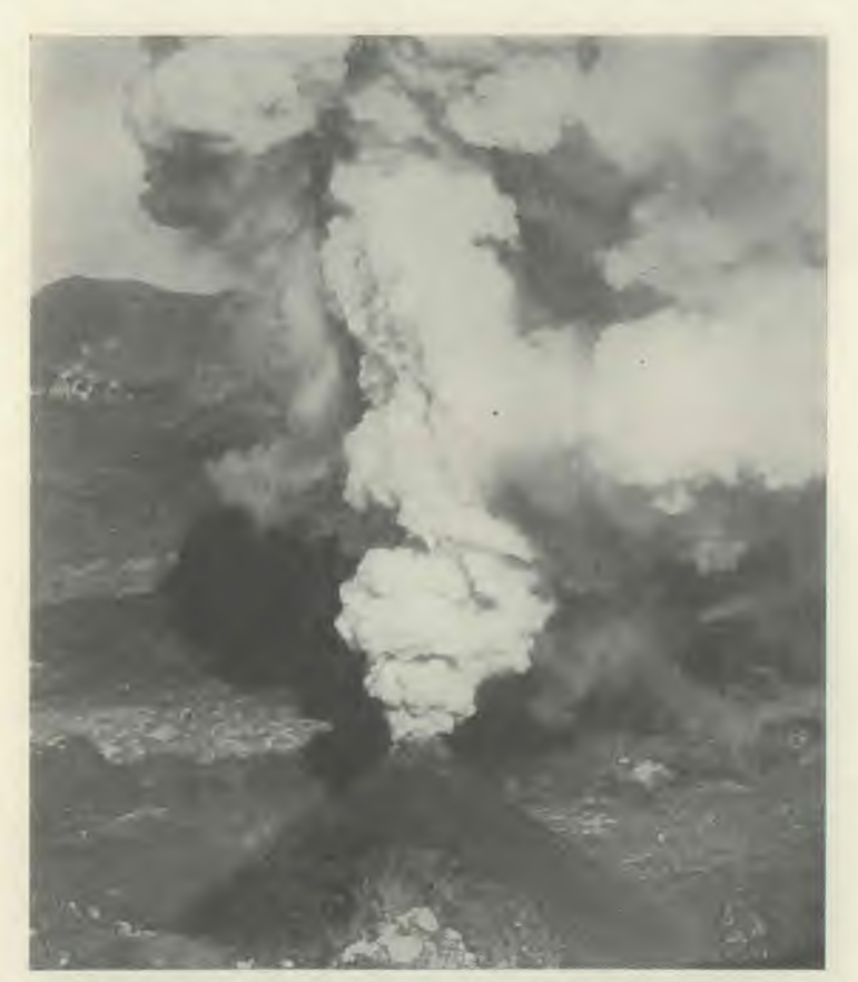
Mt. Vesuvius in a new eruption. This remarkable photograph shows the great volcano in its awe-inspiring display, spouting flames, lava, and smoke.