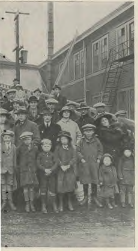
orty-two single men, eighty-three married e to Ontario in April, 1921, under arrangevincial government.