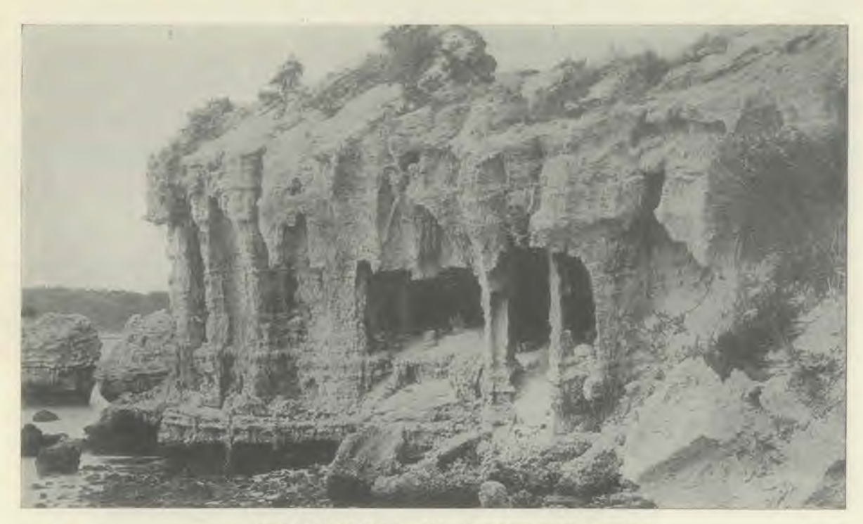
Cathedral Arch, Bermuda. A curious coral formation.

I know not how, in other lands, The changing seasons come and go; What splendours fall on Syrian sands, What purple lights on Alpine snow! Nor how the pomp of sunrise waits On Venice at her watery gates; A dream alone to me is Arno's vale, And the Alhambra's halls are but a traveller's tale,