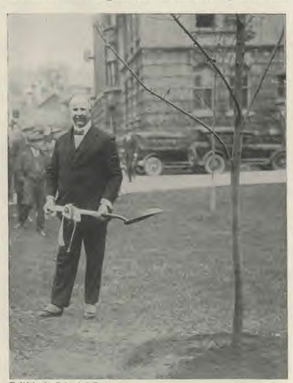
British & Colonial Press

In America the use of cigarettes is increasing at an alarming rate. During the war, cantonments had cigarettes showered upon them