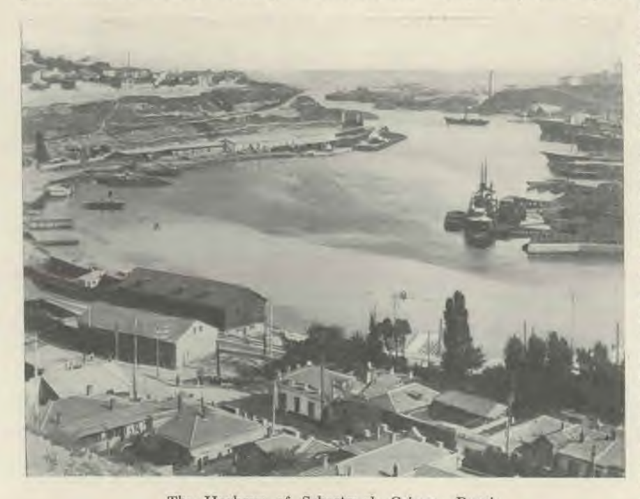
The Harbour of Sebastopol, Crimea, Russia

that robs them of the full measure of health, happiness, and success in life that their talents, rightly used, would procure. History records the names of multitudes of men and women who, through some indiscretion or indulgence in sin, through some foolish habit, lost the confidence and respect of their fellows and wrecked what promised to be a brilliant career. We see others committing all manner of folly; and sometimes we all have to admit that we, too, have made fools of ourselves in certain courses that we have followed. The words of a shrewd and