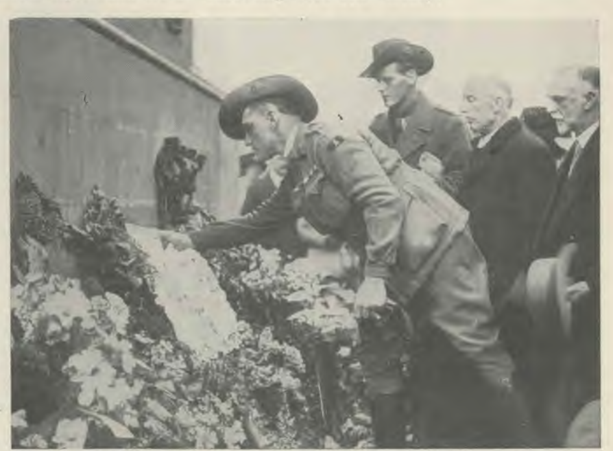
British & Colonial Press