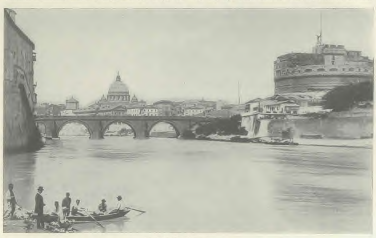
St. Peter's, Rome

"The proudest royal houses are but of yesterday, when compared with the line of the Supreme Pontiffs. That line we trace back in an unbroken series from the Pope who crowned Napoleon in the nineteenth century to the Pope who crowned Pepin in the eighth; and far beyond the time of Pepin the august dynasty extends, till it is lost in the twilight of fable. . . . Nor do we see any sign which indicates that the term of her long