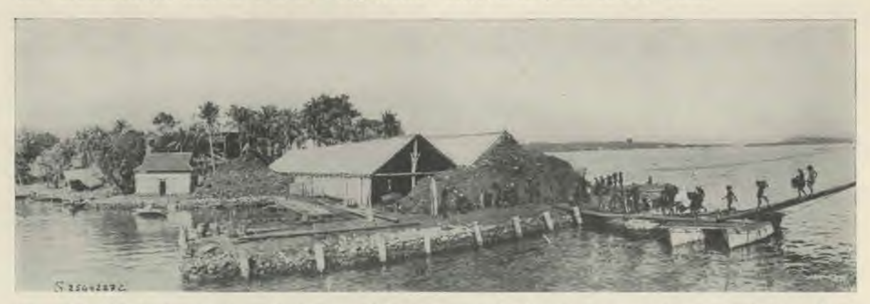
Yap, the little island with a funny little name which has caused the United States and Japan to write long diplomatic notes. It is situated in the Pacific Ocean, a little to the east of the Philippine Islands, and is important only as a cable station. It formerly belonged to Germany, and Japan was given a mandate over it by the League of Nations. The photograph shows natives at the northern end of Yap coaling the ship which comes once a month for copra (dried cocoanut), the principal product of the island.

It is a mistake to encourage, as has been done the past few years, the smoking of cigarettes by the young men of the army and navy. It is doing them serious injury. Athletes are not encouraged to smoke cigarettes. The athlete who smokes is a failure. He lacks endurance. He is easily winded. He never excels. Young army and navy men should receive the same consideration and training that athletes receive, if they are to be efficient.