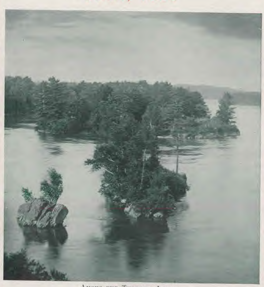
Among the Thousand Islands