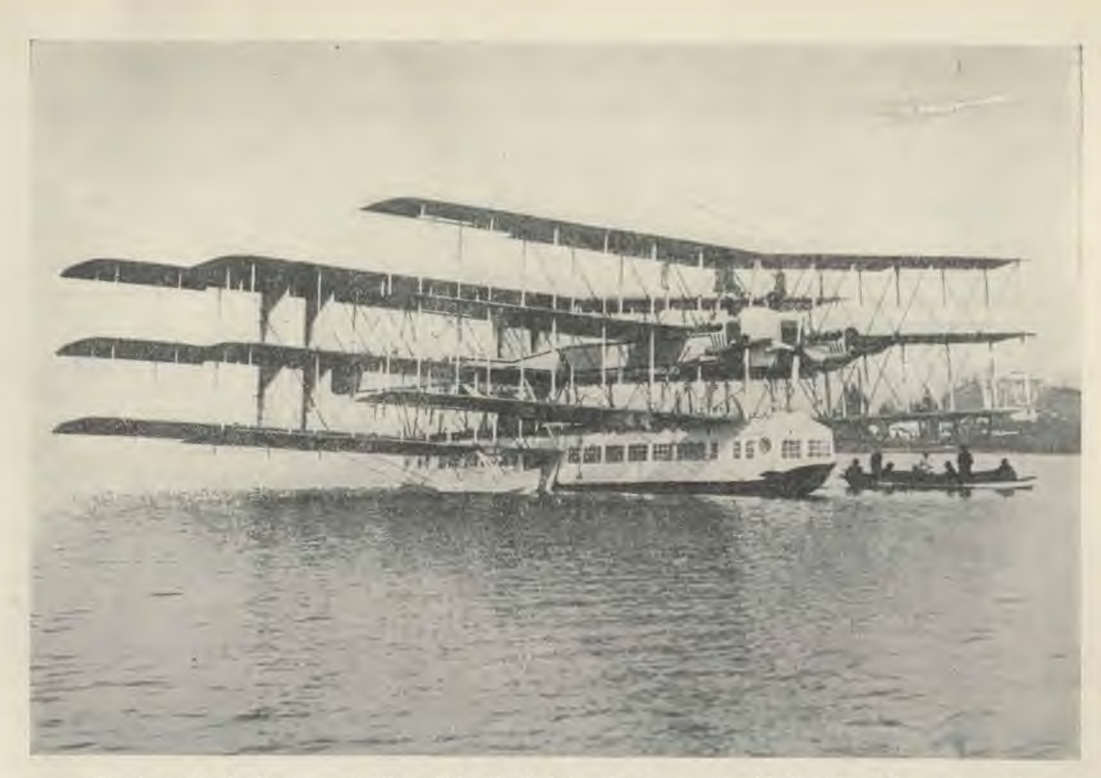
The largest airplane ever built. This giant flying boat was provided with cabin accommodations for one hundred passengers. The Italian inventor proposed to cross the Atlantic to America in her, but she was wrecked during a trial trip on Lake Maggiore, Italy.