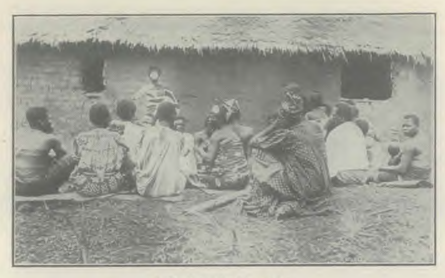
A Sunday School in Africa

"Tife is real! Tife is earnest! And the grave is not its goal!"