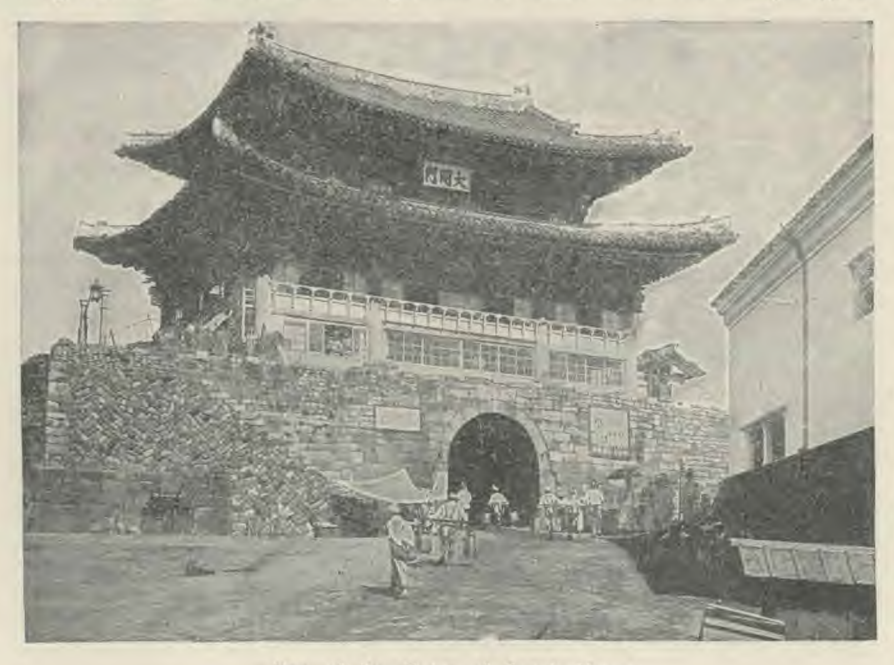
One of the Gates of Seoul, Korea

which she sees Britain using in Europe and the United States adopting in America. If a conflict with the vellow races is coming, then by appealing to guns, the Western man throws aside all the advantages that Christian civilization has given him. A machine gun operated by a vellow boy is as deadly as one operated by a white soldier. The inventive genius of the white man invites Armageddon, and may destroy civilization by putting deadly weapons into the hands of the awakening Orient.