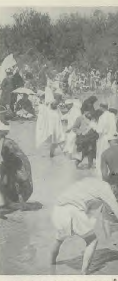
Coptic pilgrims from Egypt bathing being taken to guard against the pollu