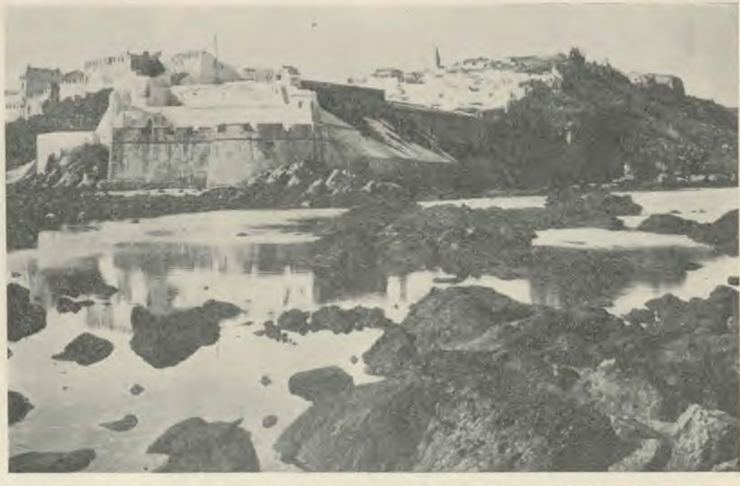
A general view of Tangier, Morocco, opposite Gibraltar. France and Spain both claim special interests in Morocco.