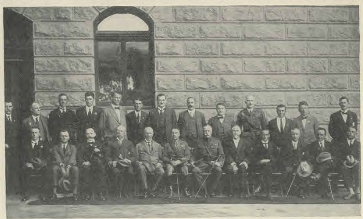
First conference of "The British Empire Service League," at Cape Town, South Africa. Representatives from Great Britain, South Africa, Canada, Australia, and New Zealand were present.

Various attempts, however, have been made to combine these very nations, but all to no purpose. Charlemagne tried it. And so did Charles V, Louis XIV, and Napoleon. Finally