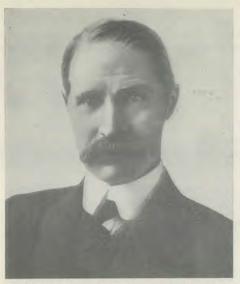
Rt. Hon. Andrew Bonar Law, a Canadian, who resigned some months ago from government leadership in the British House of Commons.