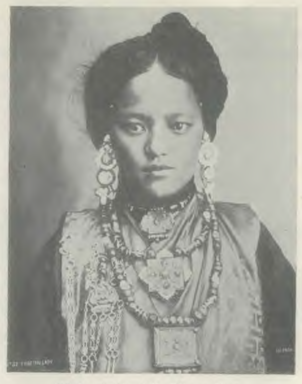
Tibetan Lady of the Upper Class

"When either of them dies it is necessary for the other to ascertain in whose body the celestial being whose outward form has been dissolved has been pleased again to incarnate himself. For that purpose the names of all male children born just after the death of the deceased Great Lama are laid before his survivor. He chooses three out of the whole number; their names are