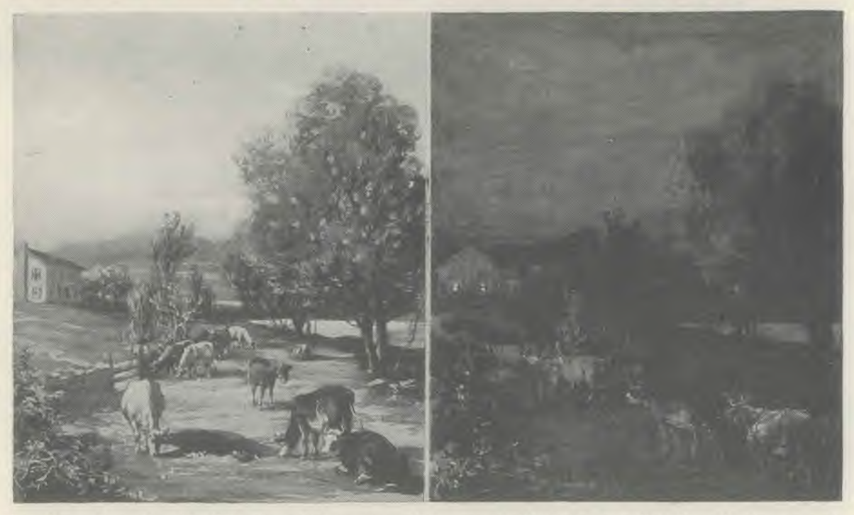
The Dark Day, May 19, 1780.—So called on account of a remarkable darkness on that day extending over all New England. In some places, persons could not see to read common print in the open air for several hours together. Birds sang their evening songs, disappeared, and became silent; fowls went to roost; cattle sought the barnyard; and candles were lighted in the houses. . . The true cause of this remarkable phenomenon is not known.—Noah Webster's Dictionary (edition 1869), under Explanatory and Pronouncing Vocabulary of Noted Names of Fiction, etc.

However, such is the power of entrenched