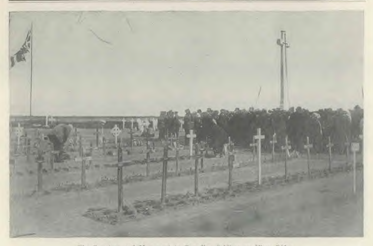
The Cemetery and Monument to Canadian Soldiers on Vimy Ridge

"To them who by patient continuance in well-doing