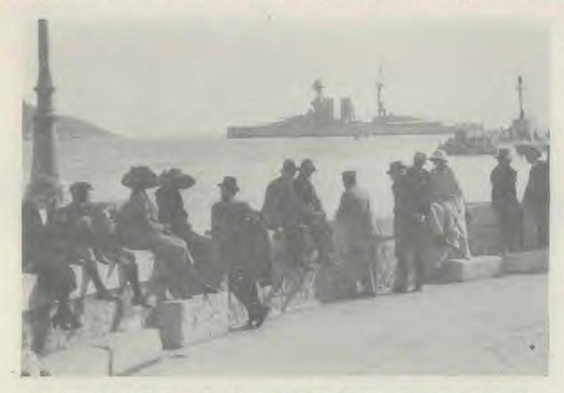
The new dreadnaught, H. M. S. "Malaya," presented to the British Navy by the Federated Malay States.

You don't have to believe the Bible in order to know that what a man sows that he must reap, if he gets any harvest at all. During the