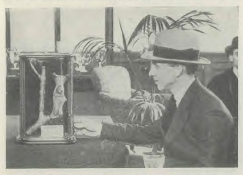
Sir Walter Raleigh's pipe, exhibited in a London museum—the first ever smoked by a white man.

of the human family to tobacco is all the more remarkable when we consider that the use of the weed was unknown to civilized man until after the discovery of America. Sir Walter Raleigh acquired the habit of smoking from the Indians, and introduced it into England. Four hundred years later we see white men, black men, vellow men, and red men, the world over, bowing in almost idolatrous subjection to a filthy weed that has no food value, that contains a virulent poison, and that perishes with the use and leaves nothing to its devotees but a hankering for more. If you sow smoke, you reap smoke!