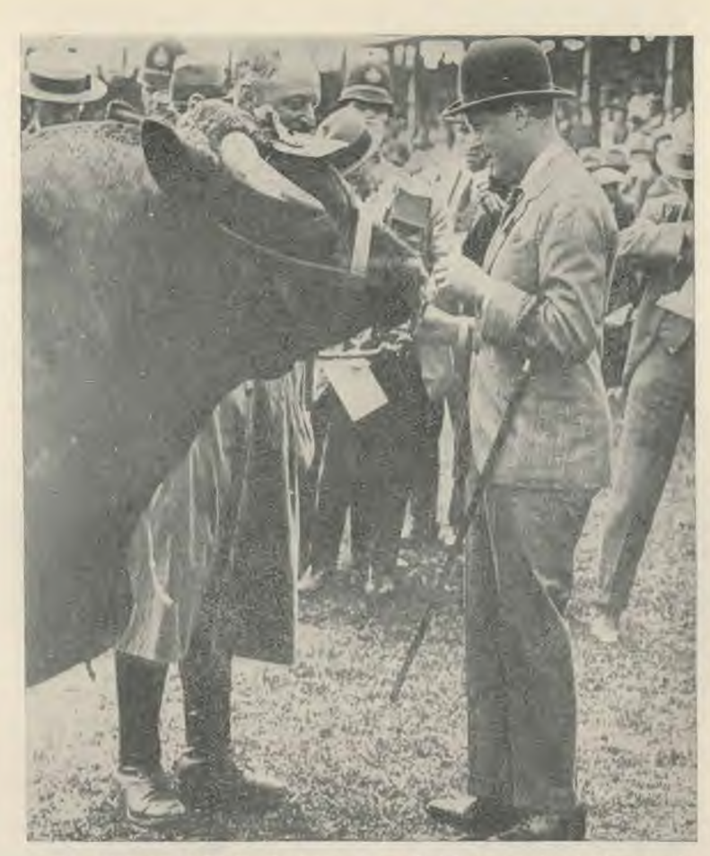
The Prince of Wales is here seen admiring a prize bull recently exhibited at a cattle and poultry show in London.