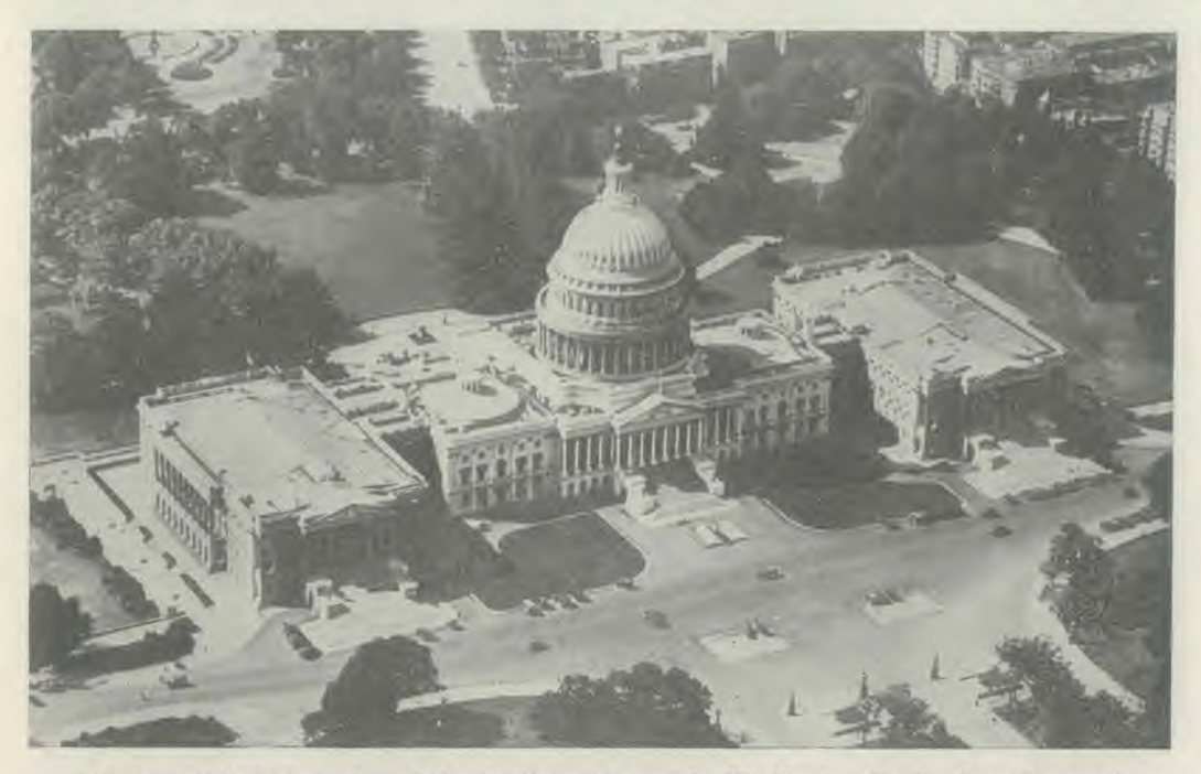
This beautiful airplane view of the Capitol and grounds, Washington, D. C., shows the great dome, nearly 350 feet high, with Senate and House of Representatives Chambers.