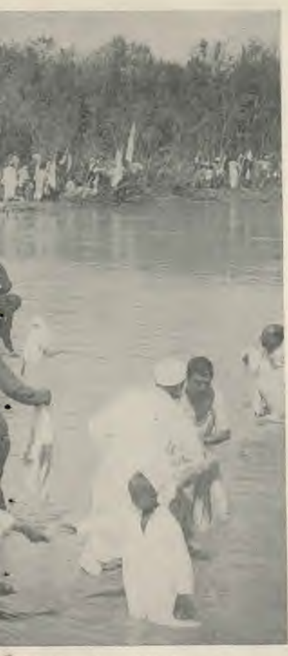
he Jordan river, Palestine. Steps are of the "holy waters" by plague germs.