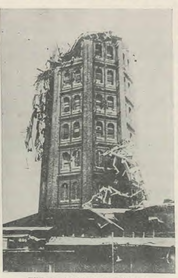
THE JAPANESE EARTHQUAKE Remains of a thirteen-storey building in Yokohama, which cracked from the seventh floor upward.

God is dealing with this generation as He has dealt with all spezial generations of the past. "As it was in the days of Noah, so shall it be also in the days of the Son of man. They did eat, they drank, they married wives, they were given in marriage, until the day that Noah entered into the ark, and the flood came, and destroyed them all. Likewise also as it was in the days of Lot; they did eat, they drank, they bought, they sold, they planted, they builded; but the same day that Lot went out of Sodom it rained fire and (Continued on page 11)