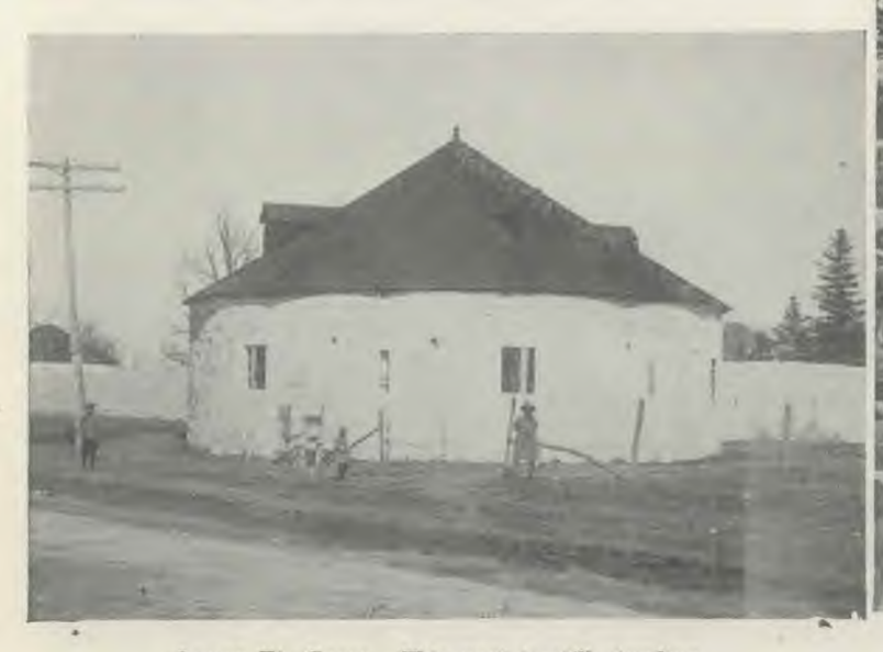
Lower Ft. Garry. This part is still standing.