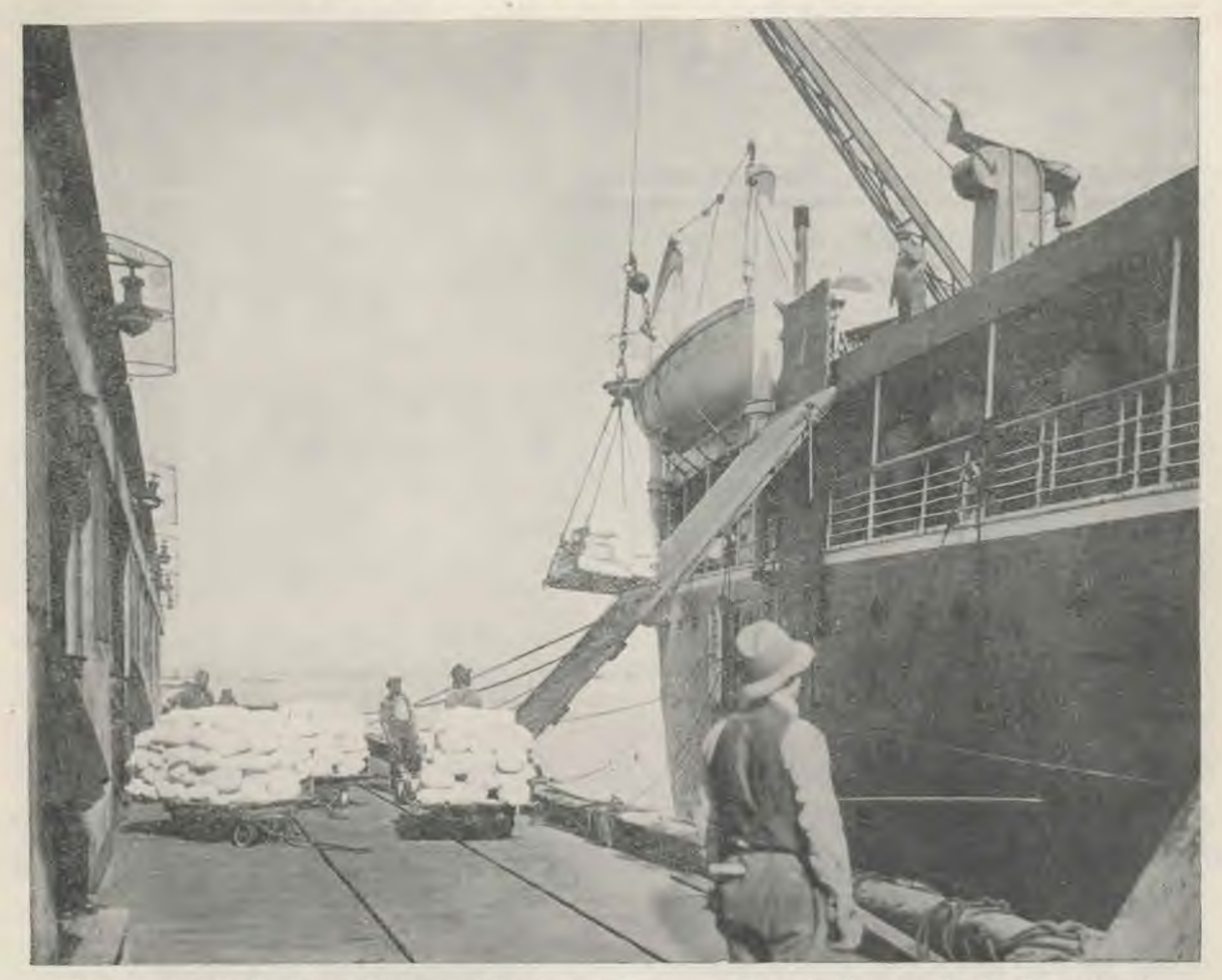
The Canadian Pacific liner "Empress of Russia" at Vancouver, B. C., loading supplies for the earthquakestricken areas of Japan.

for the Jew everywhere. I have seen him in his poverty—despised, hated, spat upon, beaten, murdered. My blood boils with his at the thought of the indignities and outrages to which he is subjected. I, too, would find for him, for me, the way out of this morass of poverty, hatred, political inequality, and social discrimination.