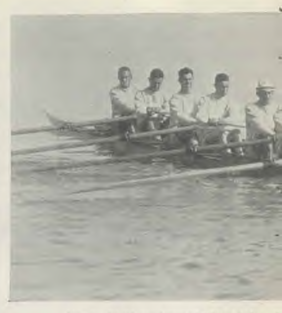
Undine Eight-oar Crew of Philadelphia, ch as guests of the Can