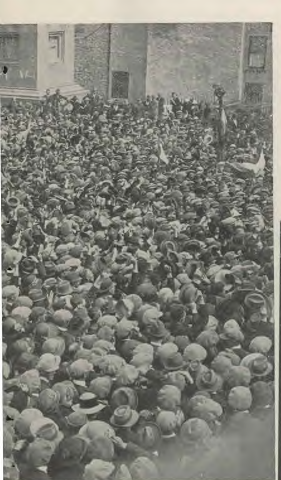
troops while he was addressing a crowd in lnnis, County Clare.