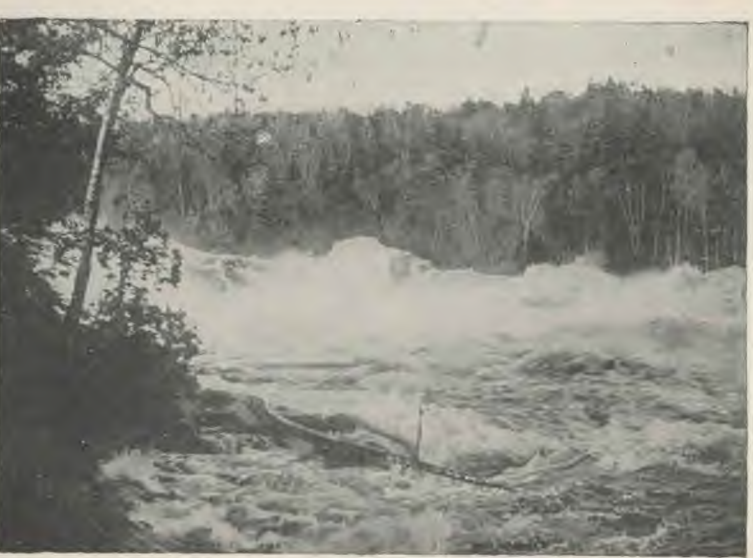
Chelsea Falls, Gatineau River, one of Canada's numerous sources of water power.