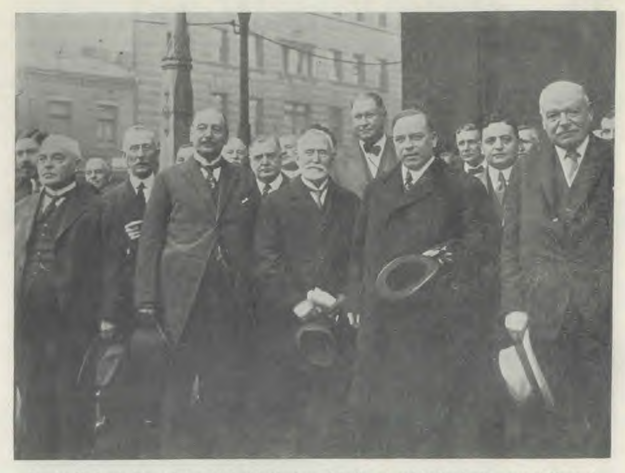
Premier Mackenzie King, photographed with Members of Parliament and leading business men at Montreal just as he was leaving for the Imperial Conference in London.

of the man who shrank from the guilt of taking human life. Nowhere outside of British countries and the United States was the privilege of doing noncombatant service officially granted to the conscientious objector. Many of these same objectors, when permitted to sweep mines or to do stretcher bearing or other noncombatant service, willingly placed life and limb in danger alongside their comrades who bore arms.