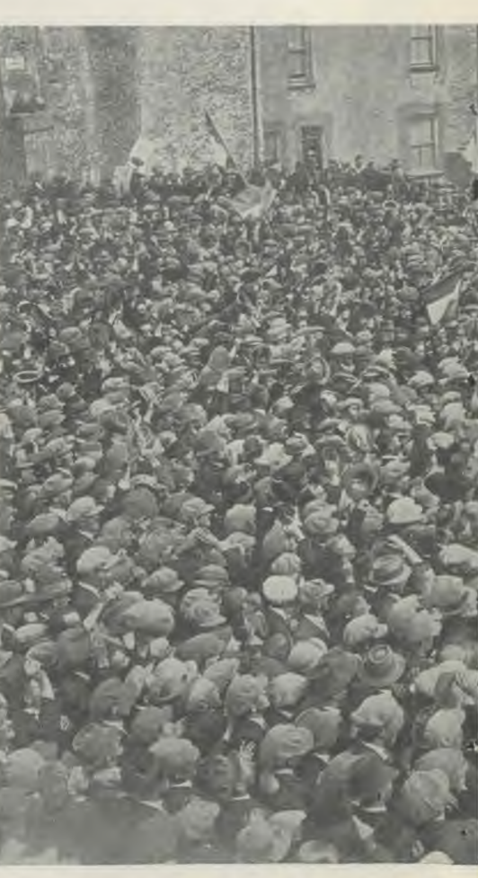
Dramatic arrest of De Valera by the Free S the market place