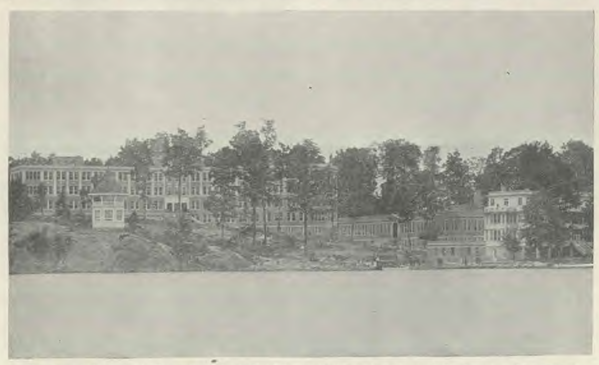
The new sanitarium at Gravenhurst is declared by medical men to be one of the finest on the continent in respect to location, design, and equipment.

Drinking water with meals is not now dis-