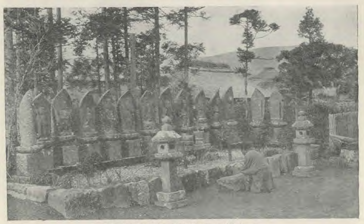
Worshipping at Ancestral Graves in Old Japan