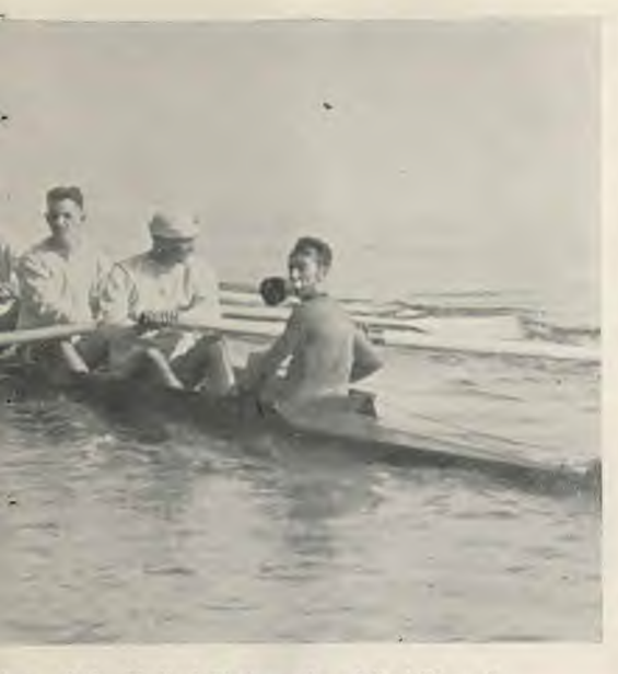
ions of the United States, who visited Toronto n National Exhibition.