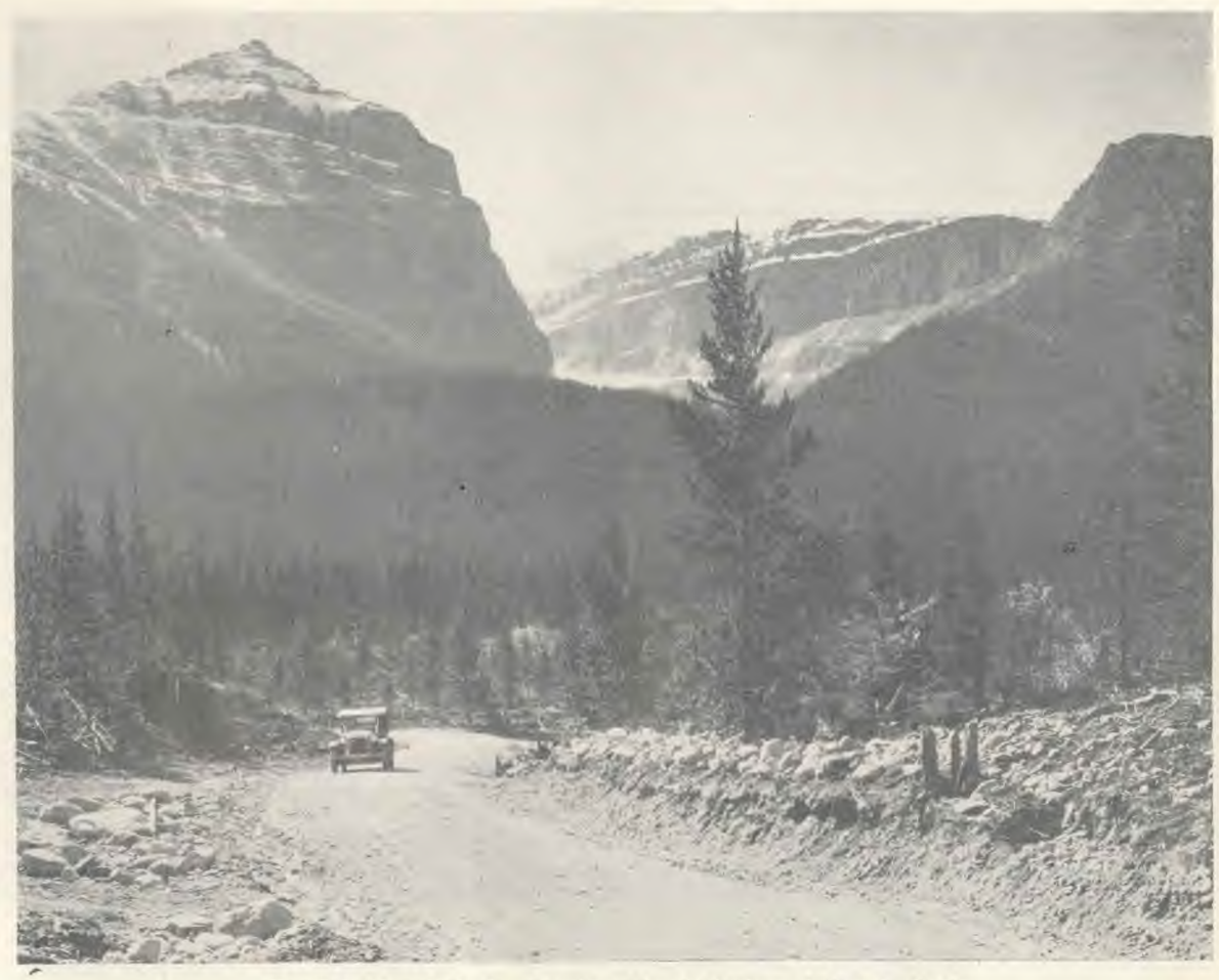
Banff National Park, showing Mt. Niblock and Pope's Peak.

snatching a fierce joy from the very heart of pain.