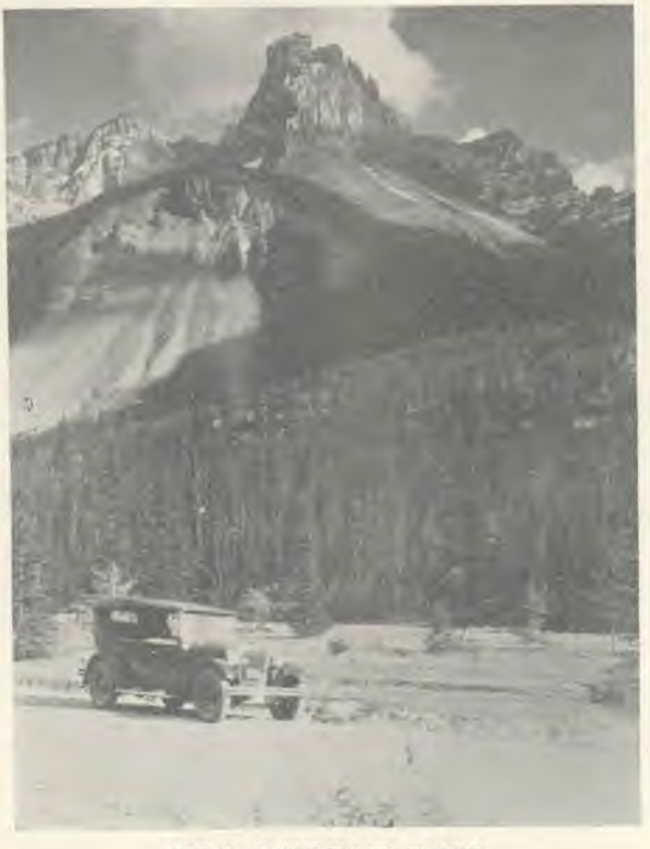
YOHO NATIONAL PARK Mt. Cathedral

Then the writer goes on to say: "Our pianos are heaped high with senseless slush. The old popular songs of sentiment, even the picturesque ragtime of a few years ago, have vanished, and we have instead blatant orgies of sound of the Ja-da, Da-da, monkey talk, and jungle sounds that mean nothing to the mind but may convey endless significance to the animal nature mere grunts and squeaks and gasps, suggestive of cave men or gorillas revelling in their beastliness. The 'music' in almost any respectable parlour would give the alienist