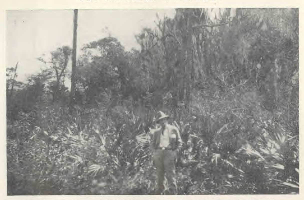
A photograph of some of the Florida land that is being subdivided into building lots.

milder climate, would do well to investigate British Columbia as well as Florida or California, before locating. If you do locate in Florida, be sure before parting with your money that the property you are offered is suitable for your purpose. There is no Eden anywhere in this world. Florida, like every other place, has its disadvantages as well as its advantages. There is fertile land in Florida, but there is no such thing as the heavy, natural sod, or greensward, such as we have in the North; and much of the land is clean sand all the way down. It serves as a foothold for roots of plants or trees, but a great deal of the plant food must be supplied for each successive crop in the form of commercial fertilizer.