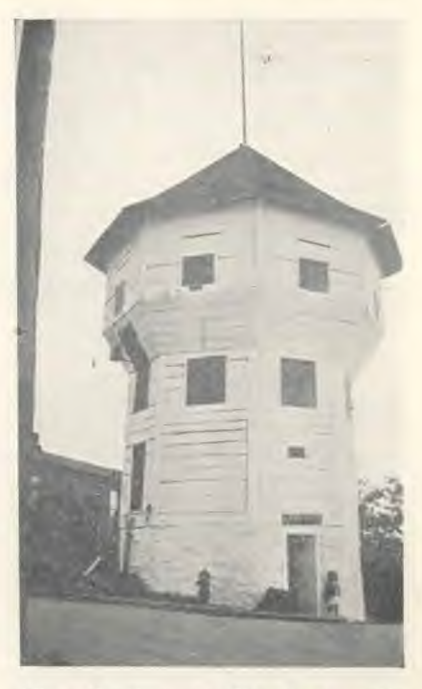
The Bastion at Nanaimo, relic of an old trading post of the Hudson's Bay Company.