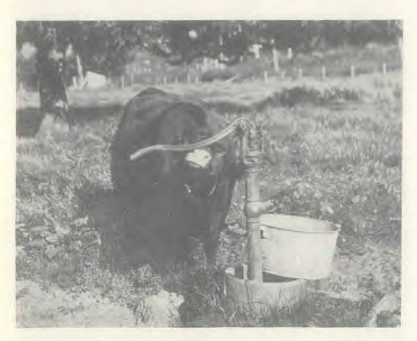
This cow, in the act of pumping water, was photographed by a local church elder of Tekamah, Nebraska. She was observed to do this whenever she was thirsty, forcing the pump handle up and down with her head.