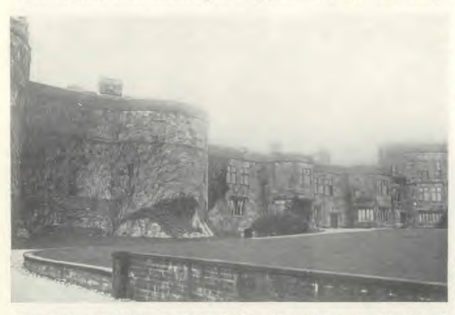
General view of Skipton Castle, Yorkshire. The castle was originally built in the days of the Conqueror, but was partly demolished in 1648, and later restored. The town of Skipton has extensive woolen and cotton factories and there is a large limestone quarry in the vicinity.