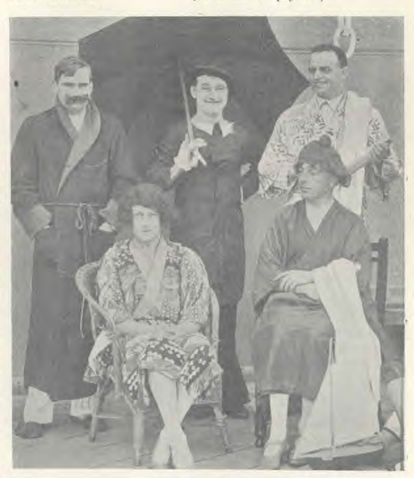
THE PRINCE OF WALES AT PLAY

"The Lord Jesus Christ shall be revealed from heaven with His mighty angels, in flaming fire taking vengeance on them that know not God, and that obey not the Gospel of our Lord Jesus Christ: who shall be punished with everlasting destruction from the pres (Continued on page 30)