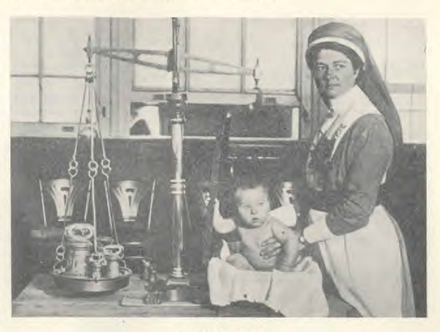
A PRIZE BABY

Sleep is a very vital factor in the maintenance of health, not only of children, but also of grown-ups. It is most important, therefore,