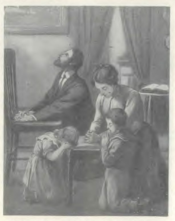
Prayer is the opening of the heart to God as to a friend. . . . Prayer does not bring God down to . us, but brings us up to Him .- "Steps to Christ."

He was greatly shaken. He was honest. He really believed there was no God; but he was a lawyer, used to sifting evidence. When these two women did something they called praying out by the Mississippi, something akin, of an unprecedented sort, happened to him down by the Potomac.