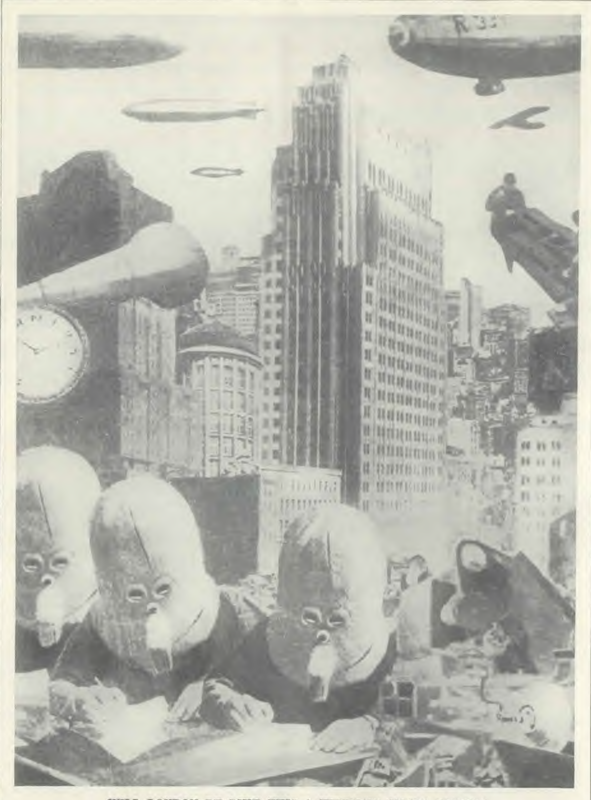
WILL LONDON BE LIKE THIS A HUNDRED YEARS HENCE?

According to a painted prophecy by a noted Russian artist, Wassilieff-Borotinsky, the London of the twenty-first century will be somewhat like New York is today, in the matter of towering buildings. Transportation will, he thinks, be mainly by air, but with pneumatic subway transportation, too, for long trips; and the use of speed for all purposes will be reduced to an exact Science. Huge amplifiers will impart the news of the day to the populace. Radio will supply light, heat, and power; and the mechanicians who will have charge of distributing the serving radio waves will wear protecting insulated hoods and body coverings. London's comment on the illustration is, "Save us from this!" and "It is to be hoped that the painter is not a true prophet."