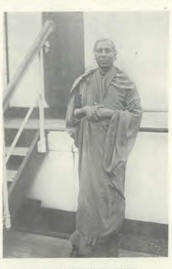
"THE HOMELESS PILGRIM"

more rewarding activities, we have been stupid enough to enslave ourselves to our own machinery, so that our last state of bondage is worse than the first. We go on inventing time-saving devices; and yet we have less time than ever left for any useful purpose; we multiply labour-saving machinery; and yet the drudgery of human toil is unrelieved. The unceasing clamour of labour for higher wages, and ever higher, is no mere vulgar demand for money and what money can buy; it is the hunger of souls starving for the joy of creative work, -a joy lost forever when the craftsman's master hand became the tool of an iron fist. and his creative brain became paralyzed by the relentless tyranny of mechanism. And all the consolations of increased output and profit-sharing schemes