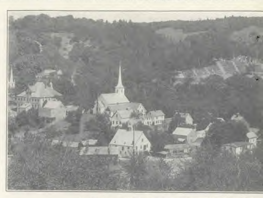
In the land of Evangeline. The quaint little village