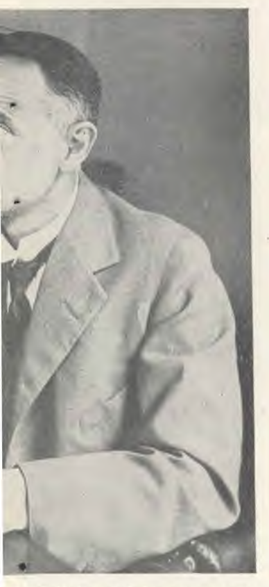
eat Britain, and for some years between the two countries.