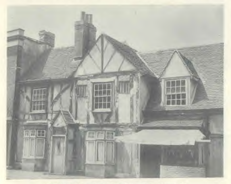
HISTORIC BRITISH HOUSE FOR AMERICA

Passing through Belgium, we turned aside to stand upon the battlefield of Waterloo, to see the place where the destiny of Europe was decided in the days of Napoleon. A few miles outside the beautiful and interesting city of Brussels, in the centre of that once blood-soaked field, stands a huge artificial