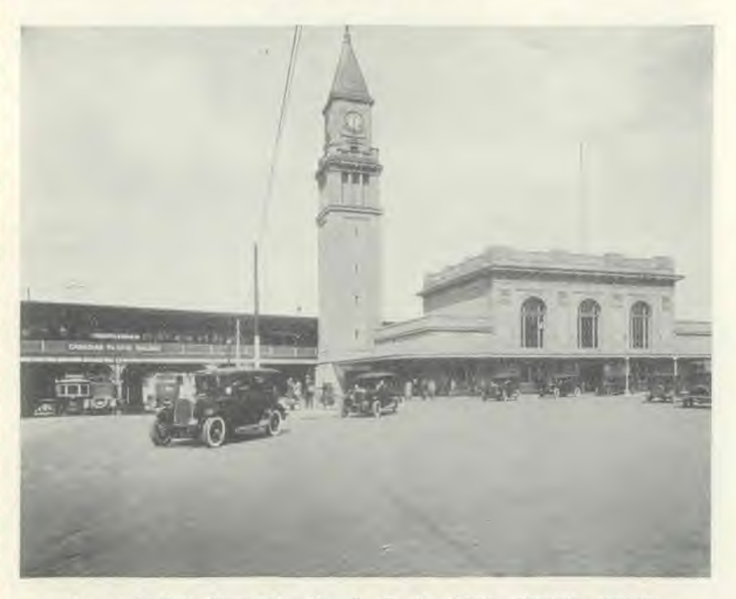
An up-to-date terminal - the C. P. R. North Toronto station.