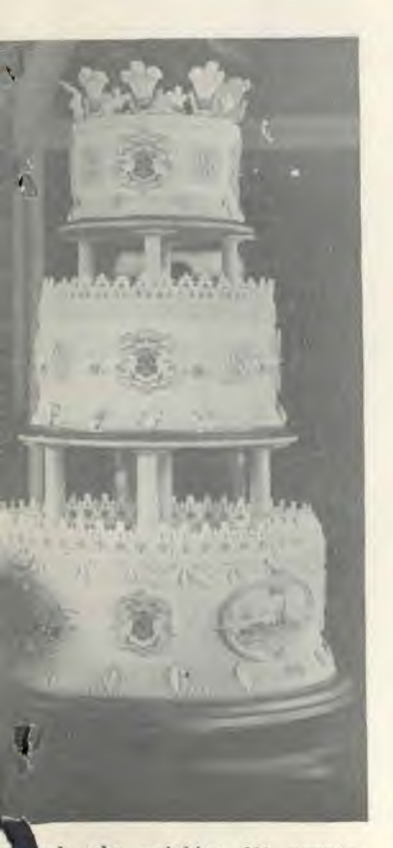
noted cake weighing 300 pounds, ctoria Hospital for Children, Chelsea, and.