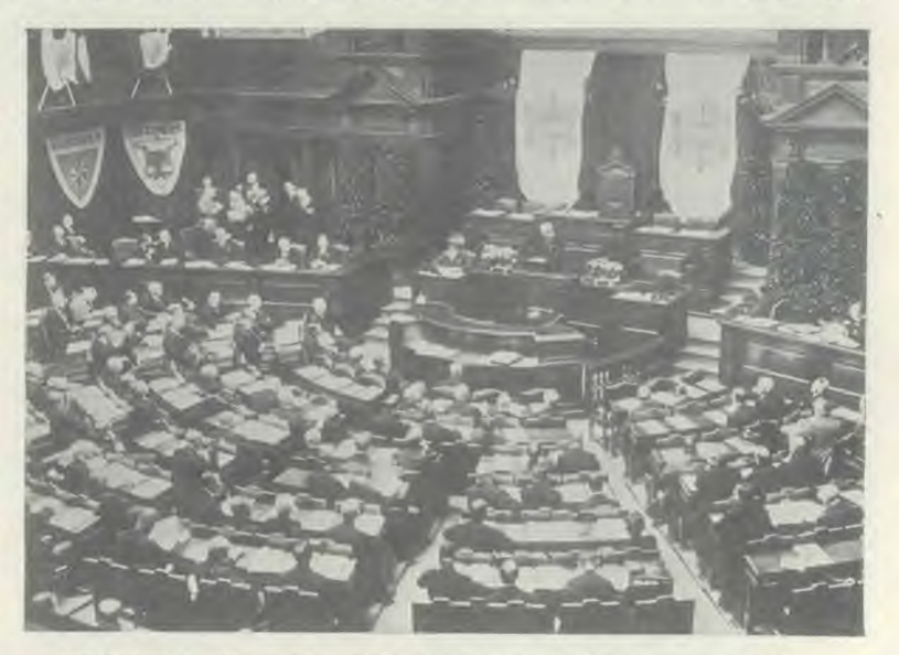
PLANNING TO COPE WITH THE UNIVERSAL CRIME WAVE

Money lust, power lust, blood lust, and sex lust produce the same results the world over, whether they are clothed in the flowing robe of the Turk, the brilliant silks of the Chinese mandarin, or the dignified broadcloth of the Westerner. Wallingford may glide up to a mansion in his limousine and