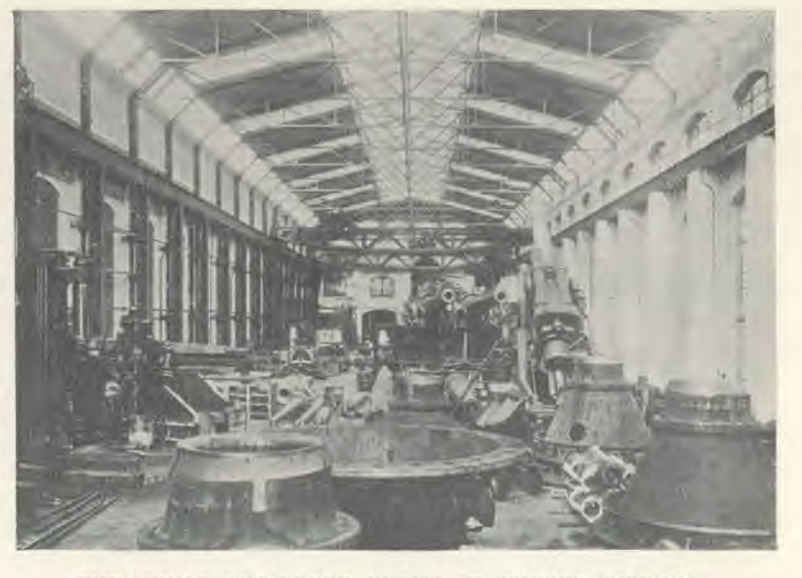
THE GREAT ARTILLERY PLANT AT BOFORS, SWEDEN

The rule of the Caesars had been in existence for a century before the days of the New Testament writers, but they speak of Antichrist as future, and never hint that the Roman emperors were such.