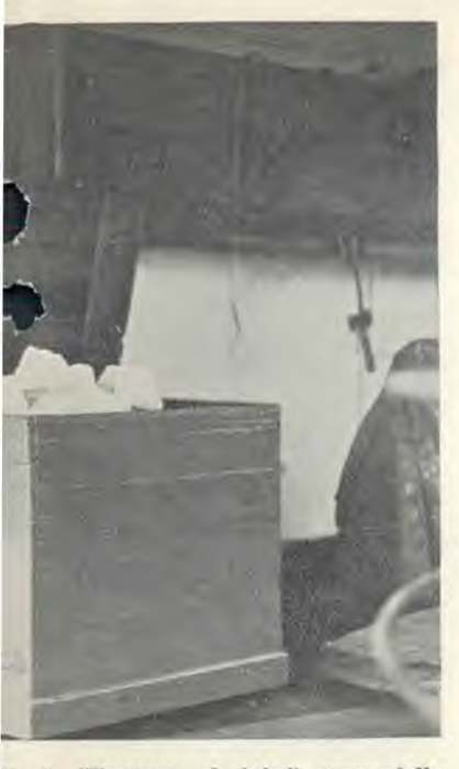
S. S. "Empress of Asia," successfully at Kobe, Japan, to be used in stocking e packed in ice and kept at an even ong voyage.