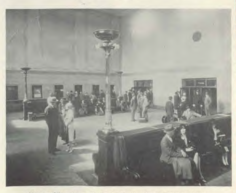
Main waiting room of the C. P. R. North Toronto station.