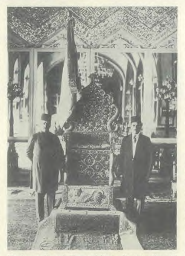
The famous Peacock Throne of Persia, the coronation seat of the ancient kingdom of the Medes and Persians. The intrinsic value of the throne is said to be $50,000,000. Medo-Persia became the second great universal empire in history when Cyrus the great entered the city of Babylon on that night of Belshazar's feast. In the midst of revelry, the handwriting of doom appeared on the royal palace wall.

In the Hotel des Invalides, another whom men called great, whose grave was once on St. Helena, sleeps in a tomb, probably the grandest that civilized man has ever built for mortal ashes to repose in. An artificial golden glory spreads its effulgence over the polished pillars that men have erected behind this wonderful tomb. The tomb is sunken below a beautiful marble balustrade, so that all who look upon the last resting place of the great Napoleon must bow the head to do so. The wonderful sculpture work of this tomb is a demonstration of what the hand of the stone artist can do in bringing beauty out of the cold and unresponsive rock.