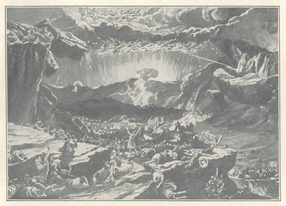
The wicked crying to the rocks and mountains, "Fall on us, and hide us from the face of Him that sitteth on the throne . . . for the great day of His wrath is come; and who shall be able to stand?" Rev. 6: 16,17.

Secondly, there must be subjects over whom the kingly rule shall extend. These are supplied by the glorified ones who are redeemed from this earth