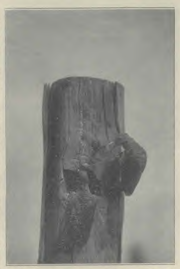
"Be it ever so humble there's no place like home."

Men and women can reach God's ideal for them if they will take Christ as their helper. What human wisdom can not do, His grace will accomplish for those who give themselves to Him in loving trust. His providence can unite hearts in bonds that are of heavenly origin. Love will not be a mere exchange of soft and flattering words. The loom of heaven weaves with warp and woof finer, yet more firm, than can be woven by the looms of earth. The result is not a tissue fabric, but a texture that will bear wear and test and trial.