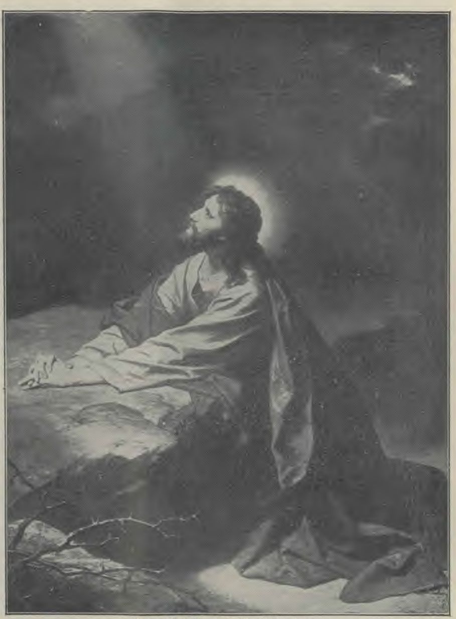
Every Christian has his Gethsemane.

gressive, clean-minded and sympathetic without the ennobling power of Jesus is idle longing. He has promised to do for us what we often express in a sighing wish, had we but the faith and confidence of a friend in Him. It is safe and sure to lend our energy and intellect to His moulding influence. As one author has said: "But in vain are men's dreams of progress, in vain all efforts for the uplifting of humanity, if they neglect the one source of hope and help for the fallen race." Through His grace we may achieve. Through His power and guidance we may touch the wings of ideals so fleetingly near at hand; we may sense the flame of love's true desire; give more in devotion to Him, and giving grow richer even though our path be winding and our summit a Golgotha.