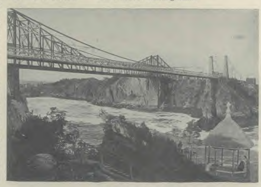
Rivers know no barriers,

"Once, many days ago, we almost held it, The love we so desired; But our shut eyes saw not, and fate dispelled it Before our pulses fired To flame, and errant fortune bade us stand Hand almost touching hand."