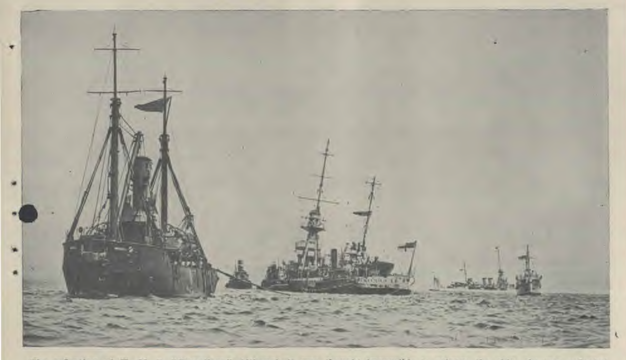
The refloating of H. M. S. "Dauntless." Although it was thought impossible to salvage the ship, she was refloated just nine days after she struck the rocks. The illustration shows the salvage ship "Reindeer" hauling her off the rocks with a fifteen-inch hawser.