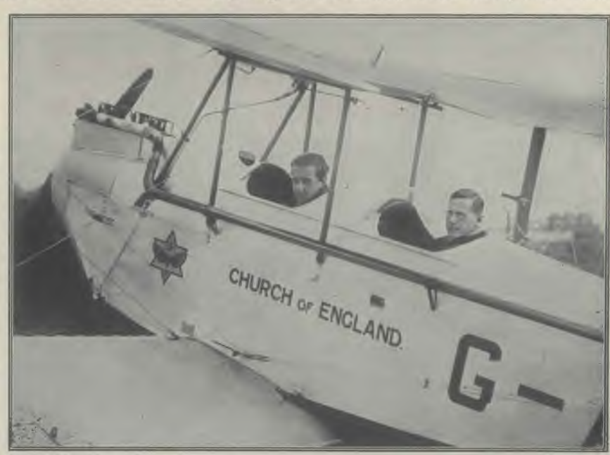
A church official in New South Wales covers his large territory in his own plane.

When people have a real desire to attend divine worship, distance, weather, expense, persecution or death will not stop them. Did we have better pastors in the old days, more interesting speakers? Our clergy are better trained today. They are better speakers, but still the crowds dwindle. We have imposing church edifices, vested choirs, short serm-