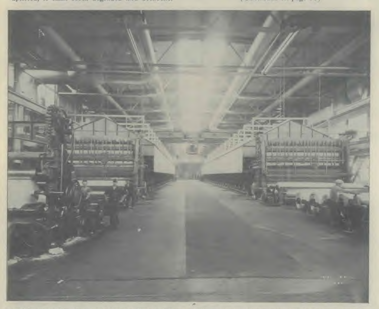
A modern paper mill. The Anglo-Canadian Pulp and Paper Mills on the St. Charles river, which produces 400 tons of newsprint a day.

If the world is to be saved from its impending doom, if it is to retrieve its stability, if happiness, (Continued on page 30)