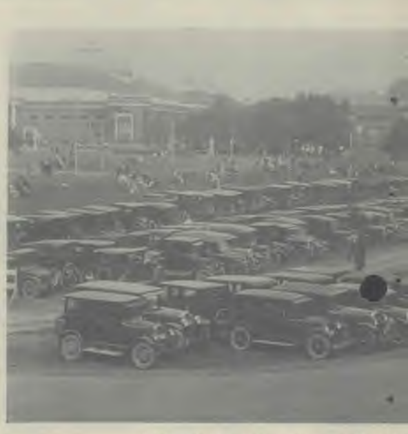
A familiar scene along the waterfront at