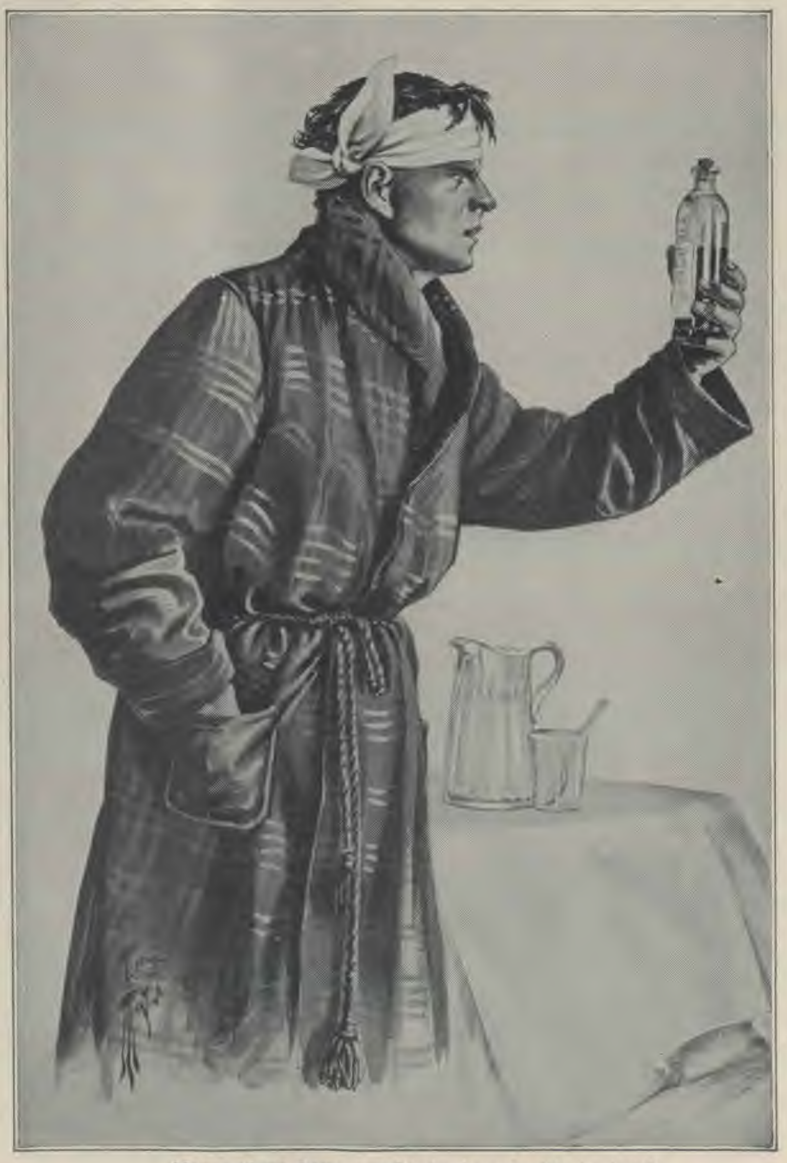
Many of us have sought to buy health in bottles.

Do not be disappointed if treatment is not successful at first. Patients, as a rule, are not willing to persevere sufficiently but fly from one advertised remedy to another for quick relief and naturally find little or none. Remember that if you have been years bringing on the complaint by faulty habits of