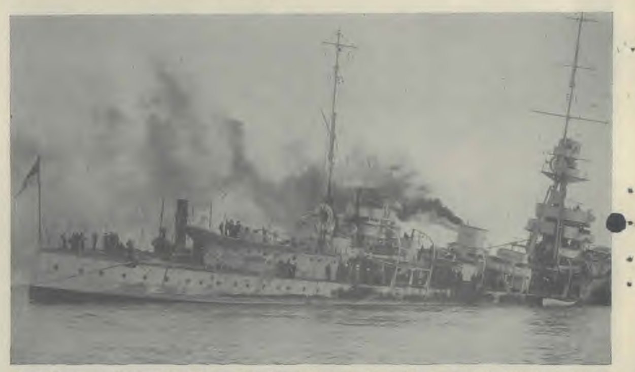
The British naval training ship H. M. S. "Dauntless" struck on Thrum Cap Rocks at the entrance to Halifax Harbour in a fog on July 2. Her salvage was despaired of.