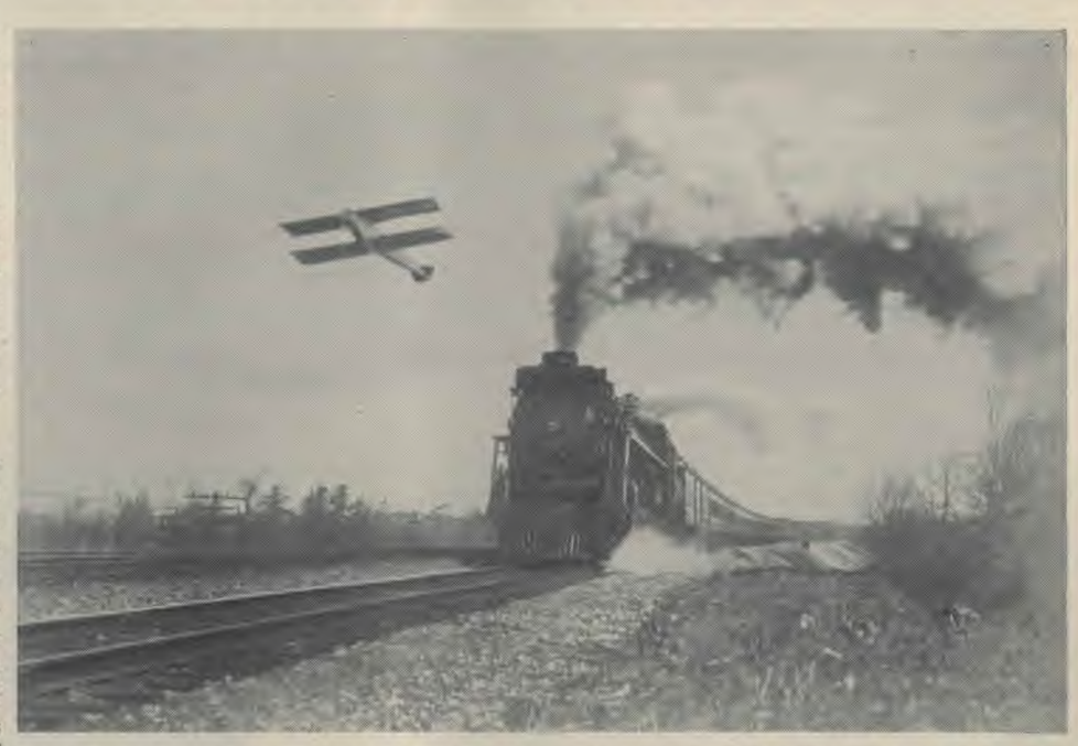
A Canadian mail plane passing the "International Limited." A Canadian National fast train running between Chicago and Montreal.

Every advance of science has been employed to