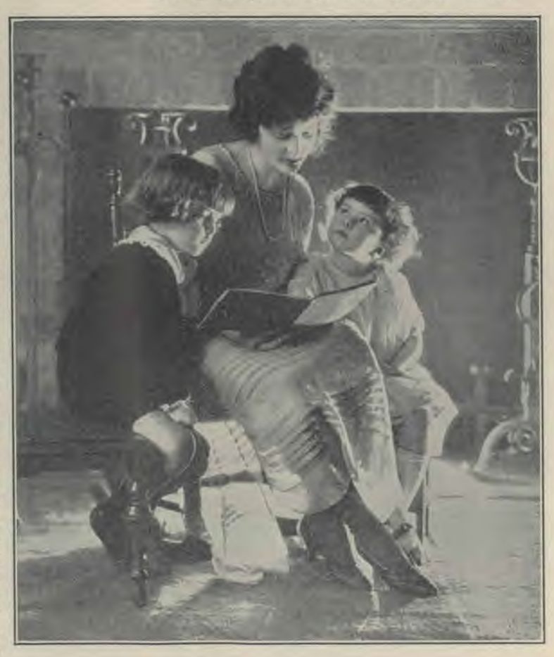
The world needs more real mothers.

"My soul doth magnify the Lord, and my spirit hath rejoiced in God my Saviour. For He hath regarded the low estate of His handmaiden: for, behold, all generations shall call me blessed."