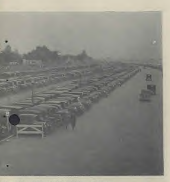
Canadian National Exhibition, Toronto.