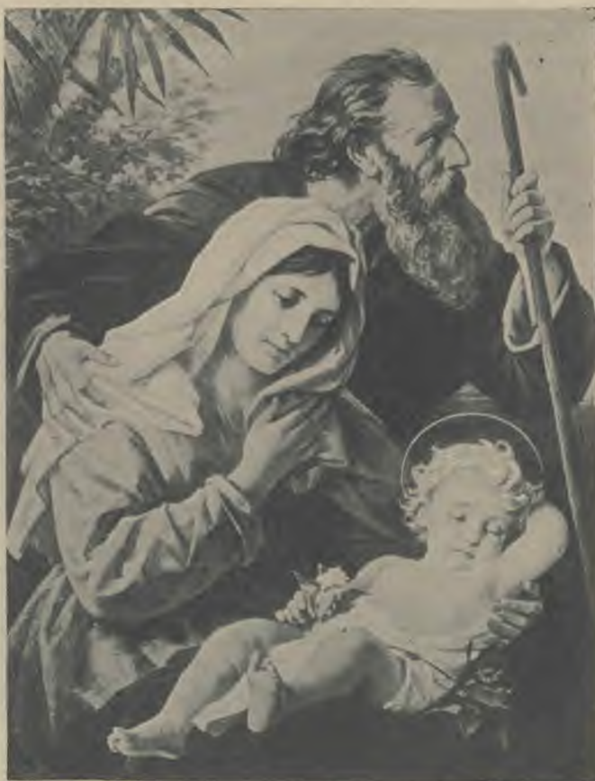
The world at large knew little of the Saviour's first advent, but when He comes again "every eye shall see Him."

On the day of Pentecost Peter made this statement: "Men and brethren, let me freely speak unto you of the patriarch David, that he is both dead and buried, and his sepulchre is with us unto this day. Therefore being a prophet, and knowing that God had sworn with an oath to him, that of the fruit of his loins, according to the flesh, he would raise up Christ to sit on His throne; he seeing this before spake of the resurrection of Christ." Acts 2:29-31. In the foregoing statement, Peter refers to two prophecies (2 Samuel 7:12, 13, and Ps. 16:9, 10) to show that Christ must be raised from the dead, before He could sit upon the throne of David. Only He who is "alive forevermore," over