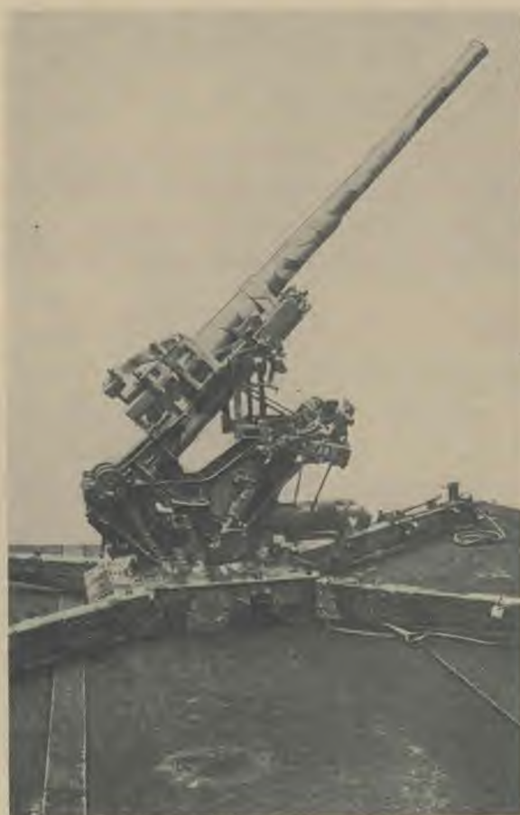
A new anti-aircraft gun which will go a long way towards making London practically invulnerable from attack by air. It has a vertical range of five and one-half miles, fires twenty-five rounds per minute and it is claimed is instrumentally equipped to hit an airplane at least once for every ten shots fired.