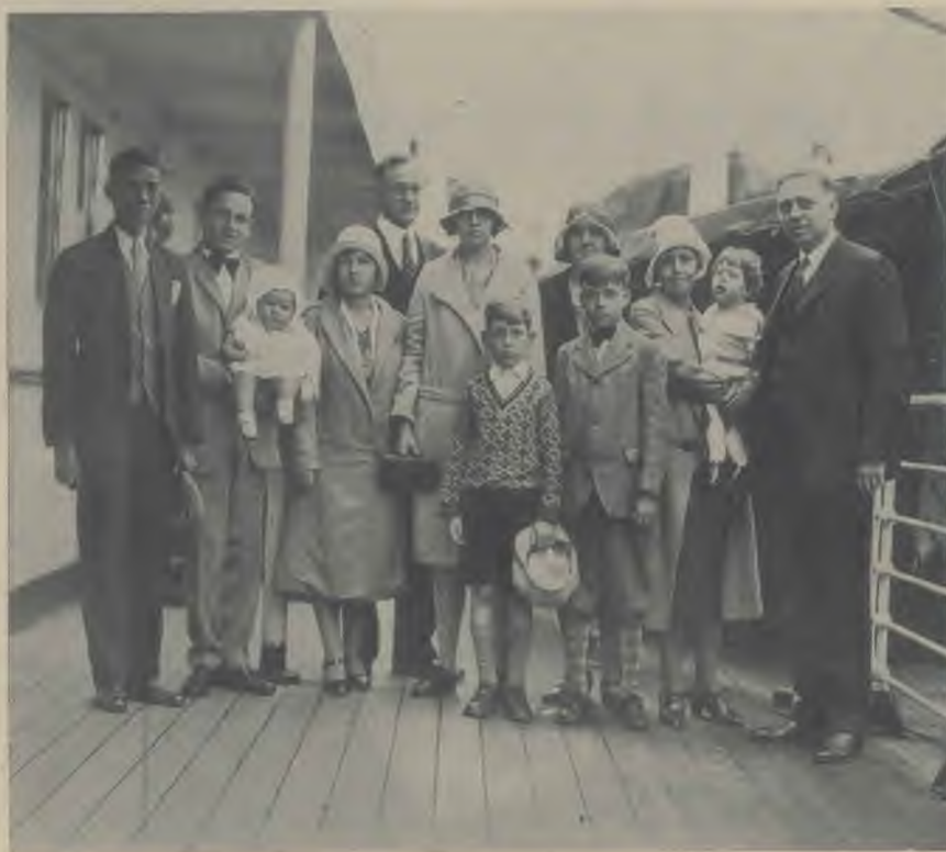
A group of Seventh-day Adventist missionaries leaving Vancouver for the Orient on one of the Canadian Pacific Empress boats. This denomination sends out on an average one missionary every other day.

AGAIN we see in the life of one of our most beloved and tender-hearted poets, Bobby Burns, a record sadly marred by indulgence in alcohol and lust in spite of the fact that he penned some of the purest sentiments and highest moral ideals that the natural mind of man is capable of. We know of only one remedy for sin; the blood of Jesus