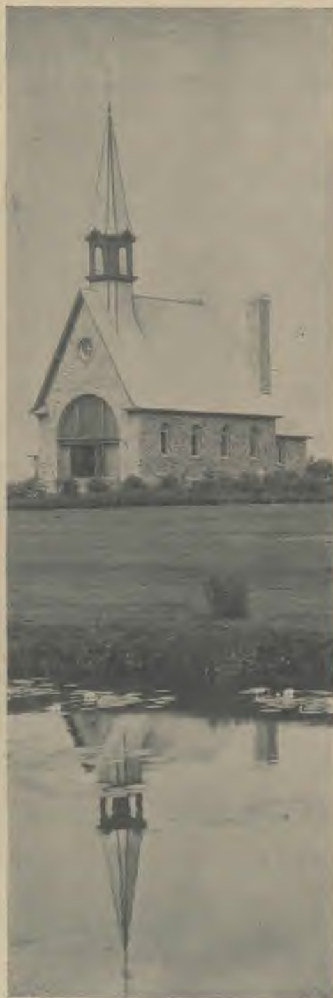
The church at Grand Pre in the land of Evangeline.

Religion satisfies a human need that neither money nor science can supply