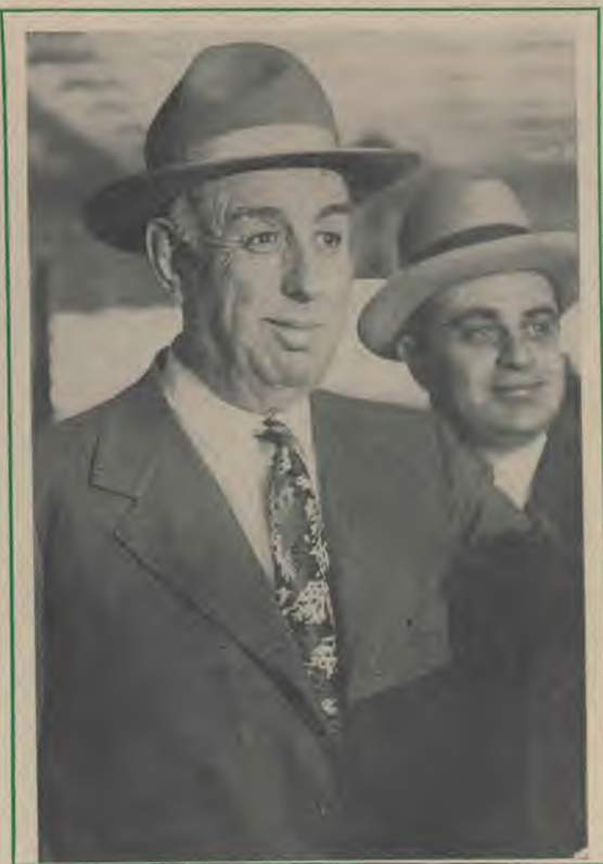
William Hale Thompson is no longer mayor of Chicago. It will take more than brains to remedy conditions in such cities.

They have originated, revived, rejuvenated, collected, and beautified all the thought lines of his-