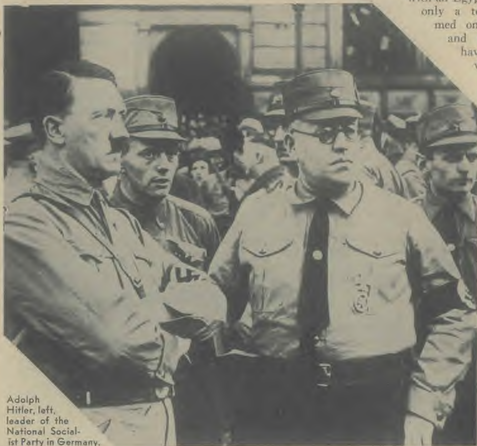
Adolph Hitler, left, leader of the National Socialist Party in Germany.

WE have failed to find a superman; let us seek for a God. Maybe He is not dead, maybe He has not gone on a journey, maybe we can find the touch of His guiding hand even in the lives of those who least respect Him. Enter Faith, Hope, and Love to lend a helping hand to reason. Love speaks of tenderness, hope points to the stars, and (Concluded on page 28)