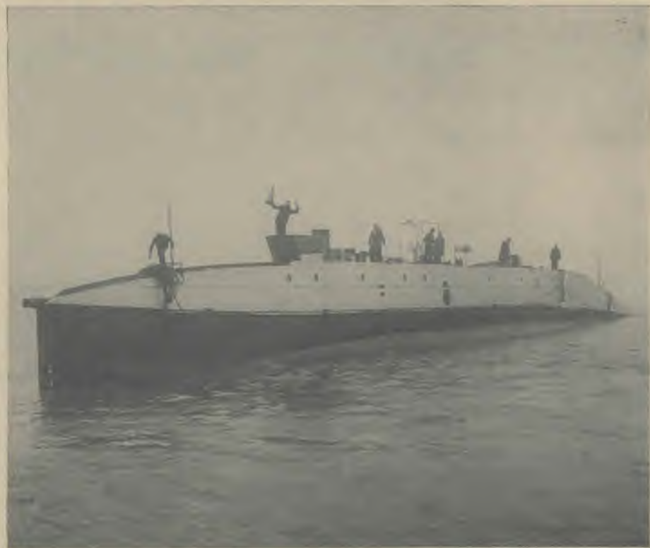
The submarine "Nautilus," in which Sir Hubert Wilkins hopes to sail under the North Pole ice.

We are living in the time when this prophecy is about to receive its complete fulfillment. Soon the whole creation will be delivered from bondage of corruption, into which sin has plunged it. Soon the children of God will hear the voice of Jesus saying: "Come, ye blessed of My Father, inherit the kingdom prepared for you from the foundation of the world." Matt. 25:34. May you and I, dear reader, be found in that day, clothed in the righteousness of Christ, ready to meet Him.