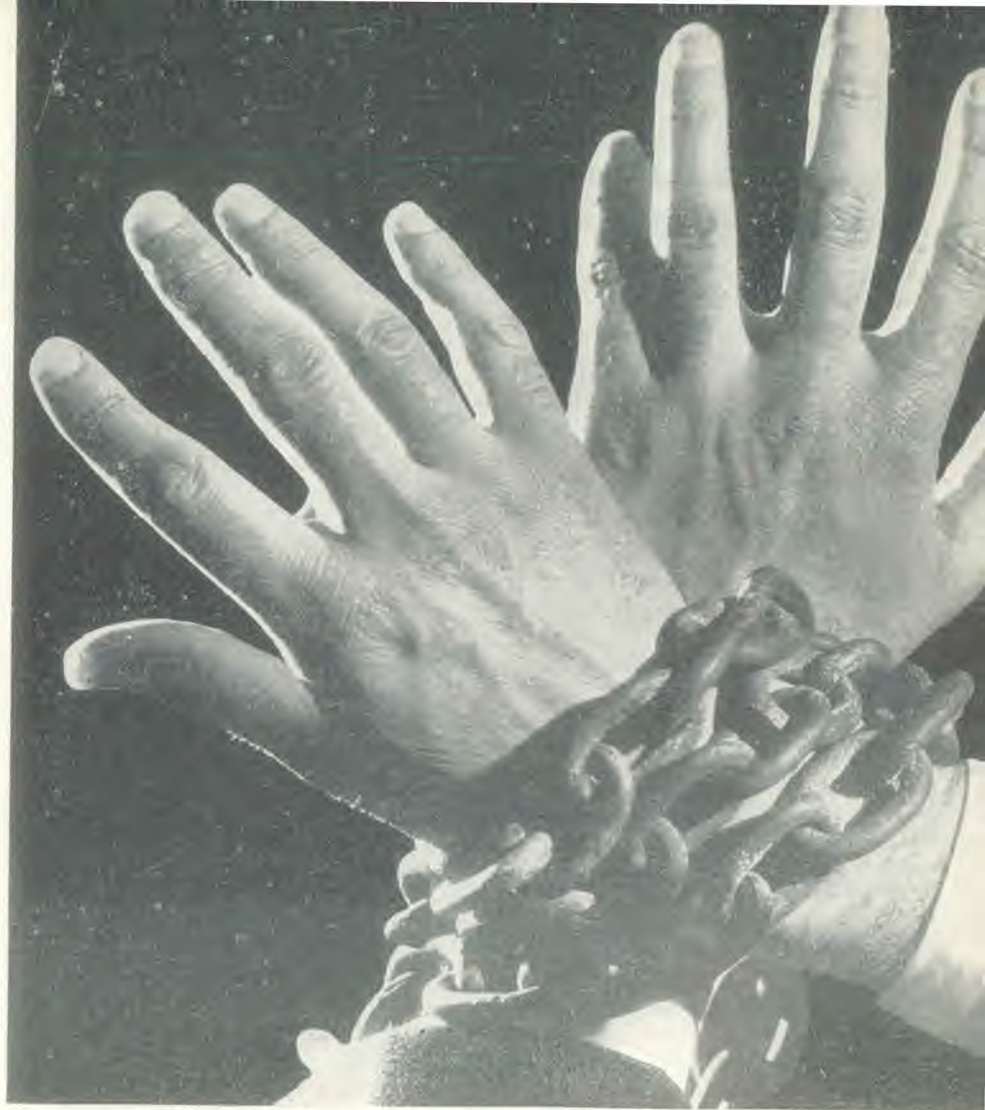
The sinner bound with the chains of sin can never know the rest, peace and comfort of an obedient life.

"You will tell me that Saturday was the Jewish Sabbath, but that the Christian Sabbath has been changed to Sunday. Changed! but by whom? Who has authority to change an express commandment of Almighty God? When God has spoken and said,