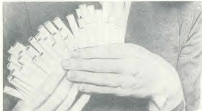
STAR NEWSPAPER SERVICE

What does the smoker get for his money? Does he get "value received" as when he gives it to the milkman or to the breadman? Most people have a pretty fair sense of values, and no one shies off from a bargain. We have learned by experience to examine an article before we buy it; and if we think it is not worth the price asked, we just don't buy it. We want something worth while. We demand a good value in the commodities for which we exchange our hard-earned money. But how is it with the cigarette? Do we get $4,000 worth of benefit for our $4,000? This is a most serious question because it involves billions of dollars and is nation wide, even world wide, in its scope.