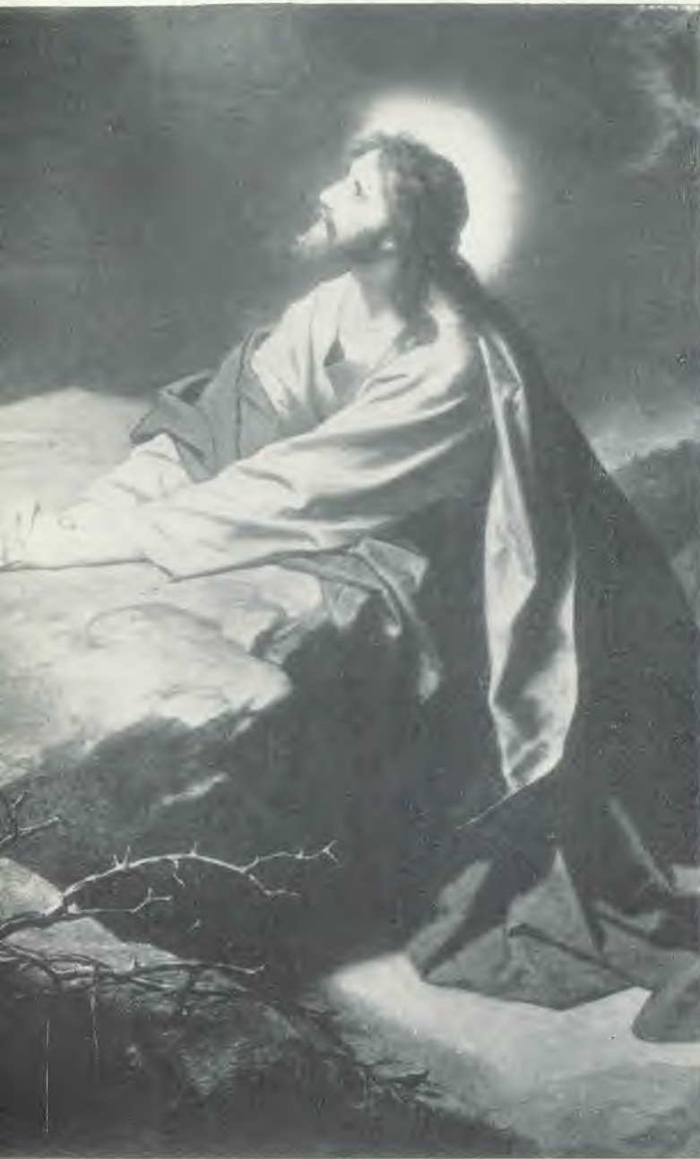
Whether in prayer or in the sterner task of cleansing the temple, Jesus revealed His divinity.