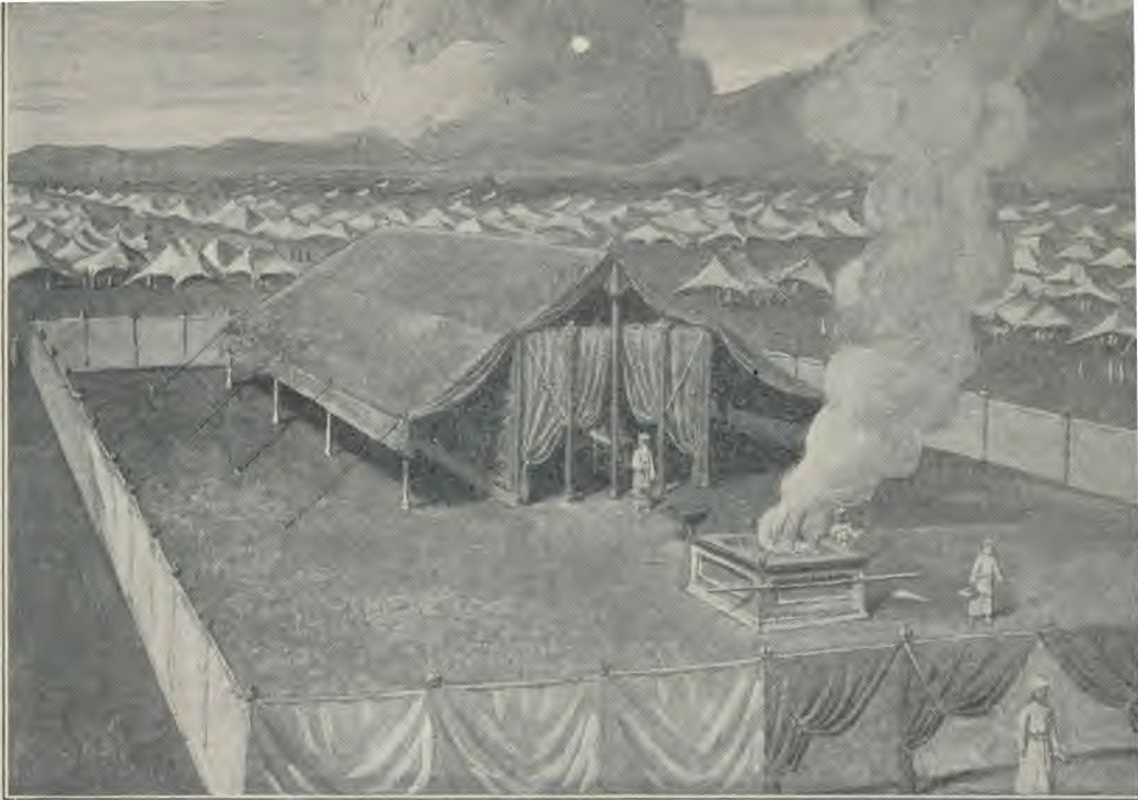
The earthly sanctuary and the service of it provides us with a picture of the great original in heaven, and its service.

On no other day of the year did the high priest serve in the most holy place, or within the veil, but now he must approach the very presence of God and sprinkle the blood of atonement upon, and before, the mercy seat. Now, in his capacity as high priest, he takes upon himself, in type, all the sins that have accumulated during the year, and bears them out of the sanctuary to the live goat which represents Satan. Placing his hands upon the head of the live goat, Aaron confesses all the accumulated sins of the children of Israel. The scapegoat is then led forth to perish in the wilderness. (Leviticus 16:21, 22.) This indicates that divine justice will not be fully satisfied until Satan has borne his share of the responsibility for these sins, and is forever cut off from among the living.