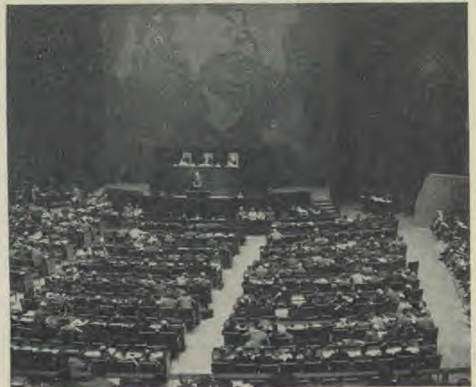
NATIONAL FILM BOARD