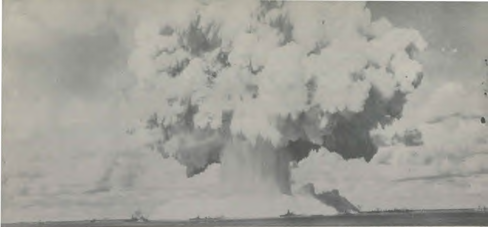
JOINT ARMY NAVY TASK FORCE PHOTO

Man has delved into the secrets of creation. The advent of the atomic bomb has robbed the world of all semblance of security, and has brought to pass the fulfilment of prophecies reaching centuries into the past. The Bikini test explosions demonstrated the frightful power of the new bomb, and the destructive radioactivity which follows.