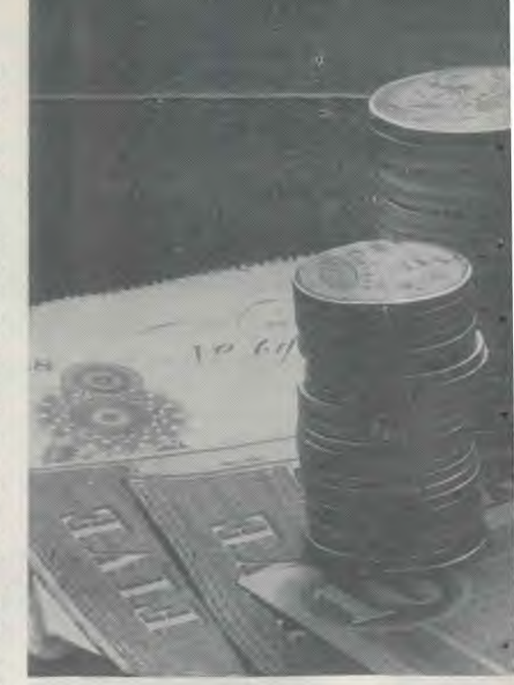
All too many people e us blessings in our cl things. Friendship

This was not all I possessed. I had a boy. He had been handicapped from infancy. He had the misfortune, when a mere babe, to fall from a high chair and receive a head injury that resulted in a partial paralysis of one side, which interfered with his developing into a normal child; but he could do little errands and delighted in doing them. He was one of the sweetest boys living. Everybody who knew him loved him, and he loved everybody. Whenever I went somewhere to give a lecture, it was always a comfort and an inspiration to know that that boy of mine was in the bedroom on his knees praying for me. I speak of him as a boy, although he was over 30 years of age. Would I turn down $1,000,000 if