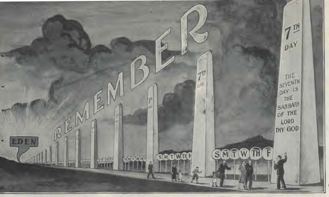
The fourth commandment (the Sabbath commandment) is as specific in its requirements as any of the others. It is the seventh day, not the first, that is commanded.

7. "And on the seventh day God ended His work which He had made; and He rested on the seventh day from all His work which He had made. And God blessed the seventh day, and sanctified it: because that in it He had rested from all His work which God created and made." Genesis 2:2, 3.