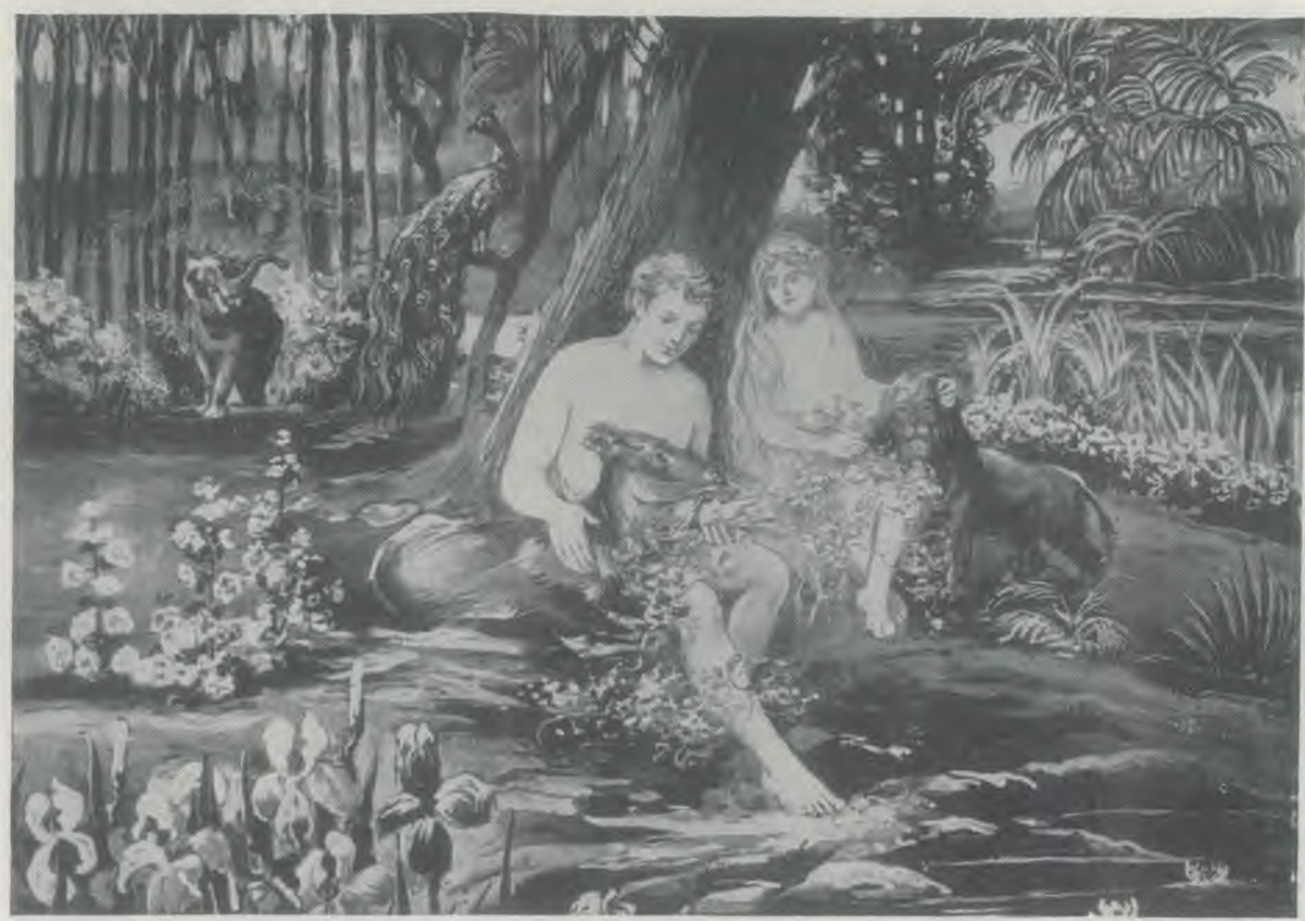
As the result of a creative act on the part of God, Adam and his wife inherited as their home the Garden of Eden in all its pristine beauty.