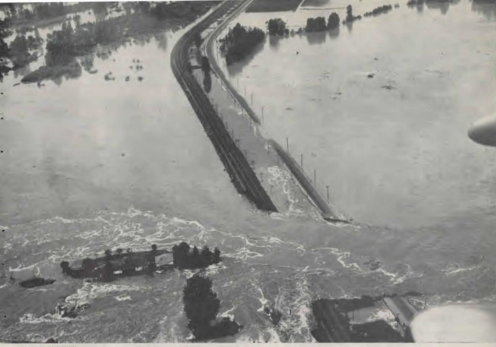
C. PROVINCIAL PHOTO