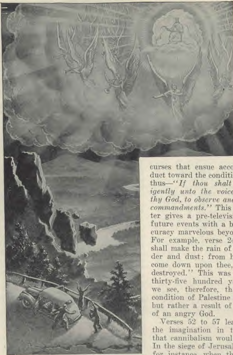
The Bible plainly predicts the event of our Lord's return.

every good thing, the One who regulates all that we call nature with faultless precision, had a perfect foreknowledge of what would happen all down the course of time, and, like any inventor, did not leave us without a book of instructions. The Scriptures contain the blueprints and specifications necessary for the salvation of every soul. These guides are set forth in a code of laws, statutes and judgments that are declared to be perfect (Psalm 19), but we have been false to our trust as custodians of God's precepts and have for the most part cast them aside, with the result that the world is to-day in a perilous plight.