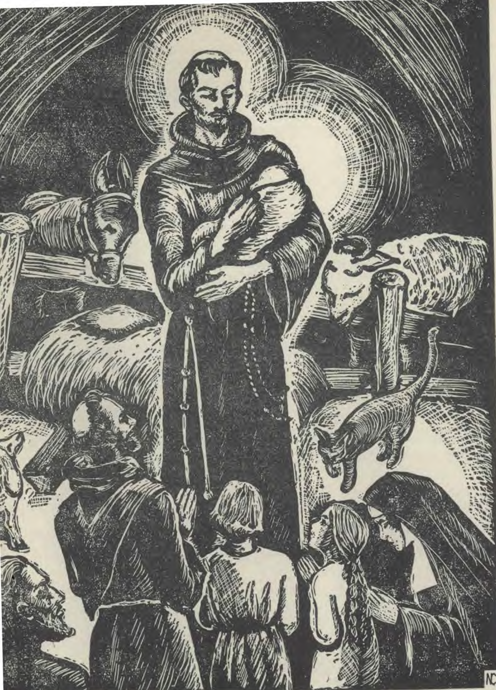
According to Catholic invention and tradition, Saint Francis was conducting the ceremony of the Mass at Christmastime, when suddenly the Holy infant Jesus appeared in his arms.

around the manger. It was just like a new Bethlehem. . . . Midnight Mass was offered over the manger, and Francis, who was a deacon, sang the Gospel. When he had sung the words, 'and laid Him in a manger,' he began to think how wonderfully good our Lord was to become a little child so that He might save us. And while he was thinking of this beautiful mystery, suddenly there appeared in his arms a child surrounded by a brilliant light. The Christ child Himself had come to bless the saint and all the people who had come to honour Him so lovingly."