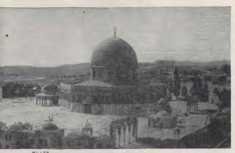
The Mosque of Omar and the Garden of Gethsemane are but two of the many "holy" places in the area of Jerusalem, the city held sacred in the minds of millions.