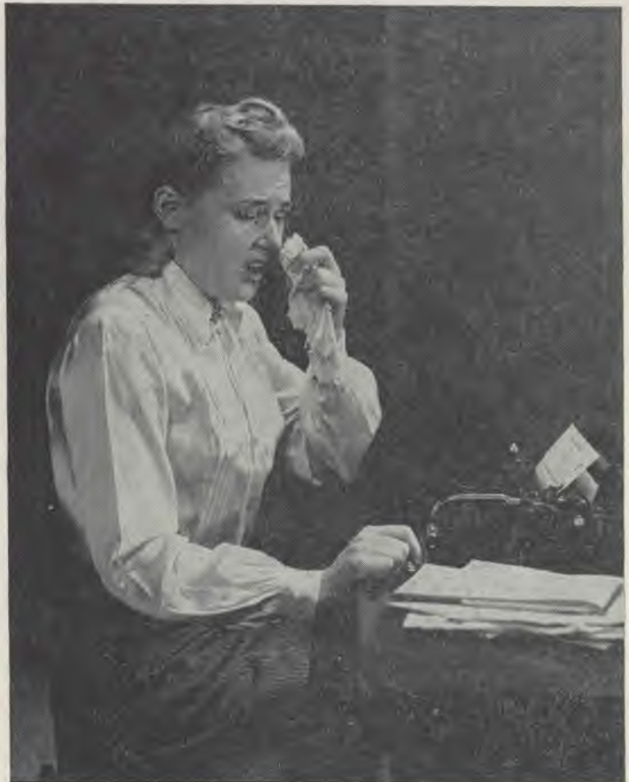
H. ARMSTRONG ROBERTS

Polio, like most other diseases, attacks when the resistance of the body is low owing to overwork, lack of an adequate balanced diet, sudden chilling or undue exposure. Here it is indeed true that an ounce of prevention is worth a pound of cure.