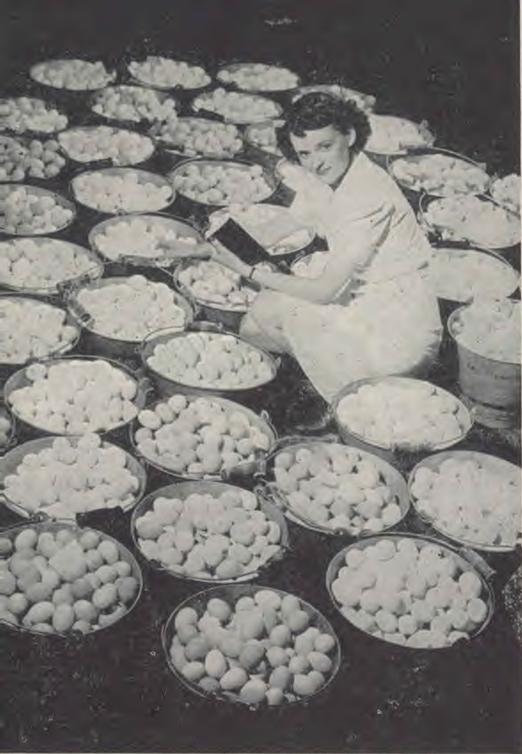
As in the case of the surplus of potatoes, wheat and corn, there is a U. S. purchased surplus of millions of pounds of eggs, dried and stored in many places, which are now spoiling. Why let them spoil? Why not feed the hungry?

prevent starvation) of the surplus wheat, corn, eggs (that will spoil anyhow), together with other surplus foodstuffs, be moved into the starvation area of China, irrespective of whether that area is nationalistic or communistic, that Chinese fathers and mothers and boys and girls might live?