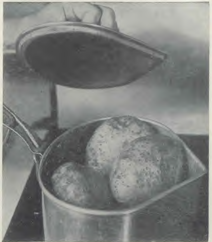
In some localities great mountainous heaps of potatoes are dumped to rot; in other parts of the world there is starvation. Why cannot the surplus be used to supply the shortage?

Why could not some (a sufficient quantity to