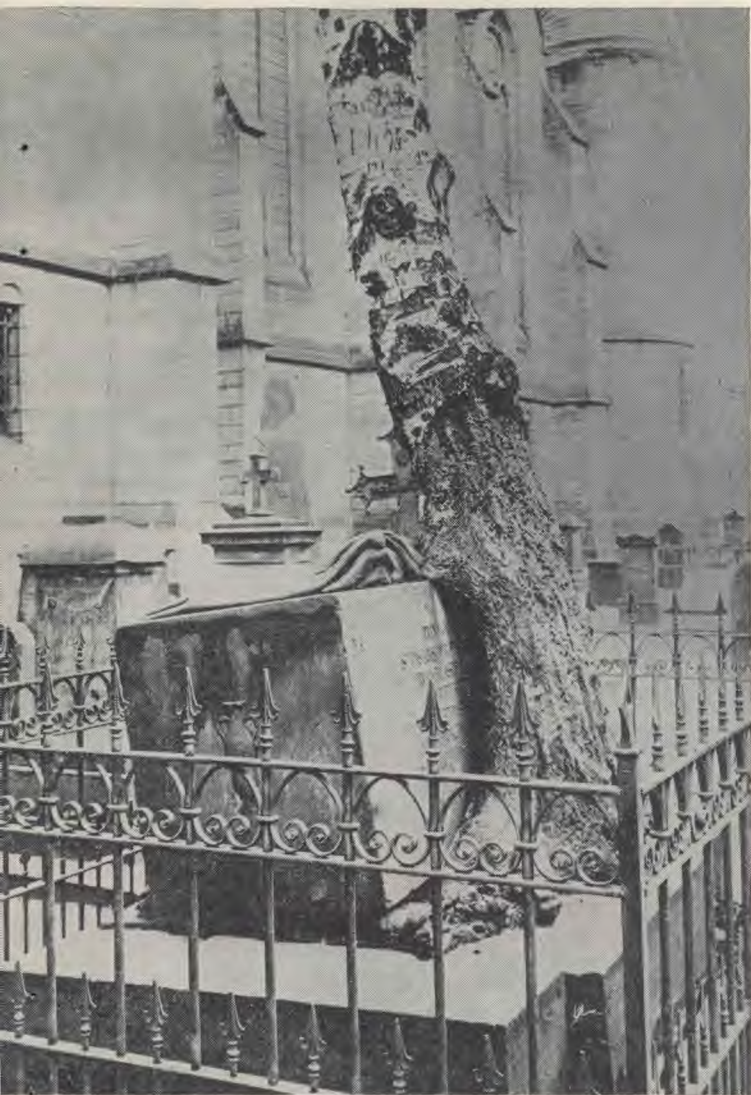
This grave "purchased for eternity" was broken open by the mighty power of God contained in a tiny seed. One day the mightier power of God shall command the graves to open and the righteous shall come forth immortalized.

cherub . . . upon the holy mountain of God": "Thou sealest up the sum, full of wisdom, and perfect in beauty. Thou hast been in Eden the garden of God. . . . Thou wast perfect in thy ways from the day that thou wast created, till iniquity was found in thee. . . . I will destroy thee, O covering cherub. . . . Therefore will I bring forth a fire from the midst of thee, it shall devour thee, and I will bring thee to ashes upon the earth. . . . And never shalt thou be any more." Ezekiel 28:12-19.