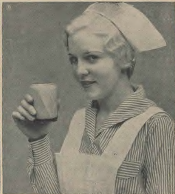
As a beverage, milk contains excellent body-building material. This cannot be said of tea or coffee.

Many think that if the market basket does not contain flesh meats they have nothing to eat. However, God did not give meat as the primary diet in the Garden of Eden. He allowed it only after sin had upset the original plan.