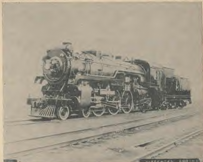
CANADIAN PACIFIC RAILWAYS

Some words are so vitally important that their addition or deletion means life or death.