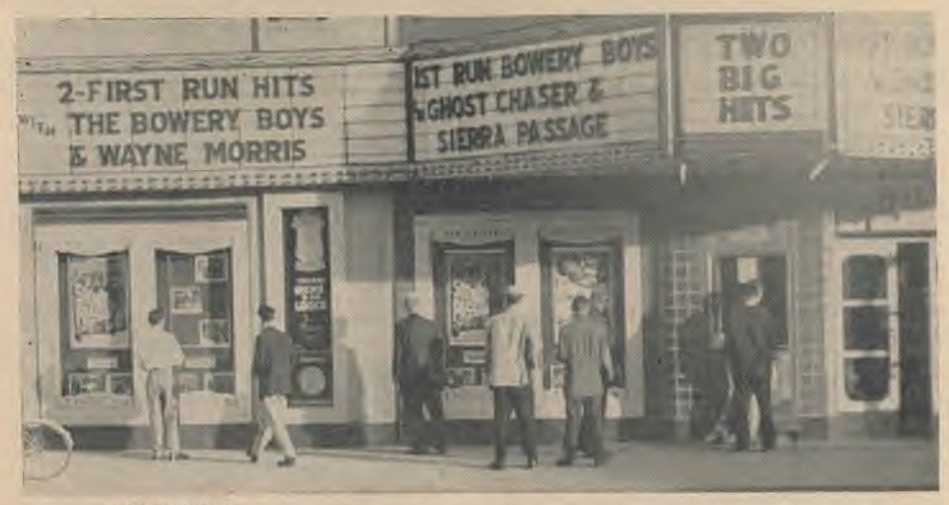
As an educational factor, moving pictures are unexcelled. It is sad that Satan seizes upon God's gifts and perverts them to serve his own wicked purposes.

them together into a place called in the Hebrew tongue Armageddon." Revelation 16:12-16.