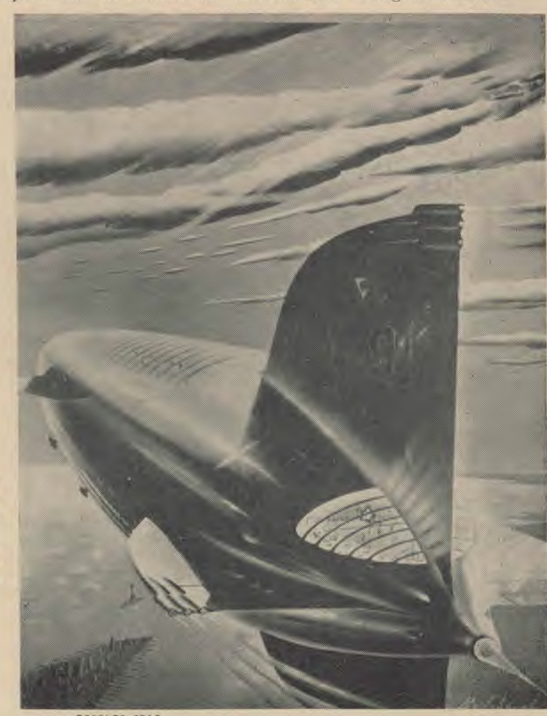
Nothing is secret to God. He knows the end from the beginning, and the things that have not yet come to pass.

Only through a prayerful study of the Bible can we confidently face the future and know what it will mean to us. That kind of study will not only reveal what is to come; it will also reveal the great Maker of history, who can be our Guide through its confusion and our Saviour from it and its evil. Surely it is the part of wisdom on the part of everyone to get better acquainted with the Bible, its prophecies, and its Lord. Will you not determine to follow this course of saving action now?