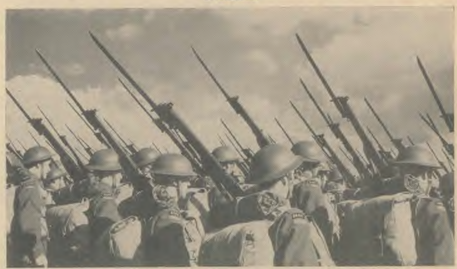
WARTIME INFORMATION BOARD

The Korean war is not the Biblical Armageddon. But certainly the nations of earth are making every preparation of armaments against that day when the east will meet the west on the plains of Megiddo.