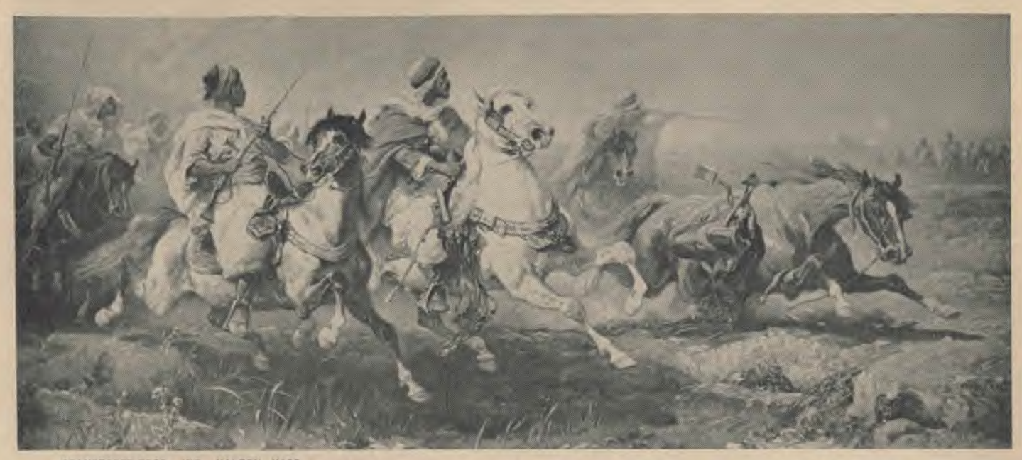
Throughout the centuries tribes and nations have ridden over the earth to triumph or to defeat. Through it all, however, they have followed the divine pattern, much of which is outlined in the Bible.

rulers conceived the idea of expanding across the Bosporus into Europe, and two of them actually did make the attempt. But in so doing they raised a hornets' nest about their ears.