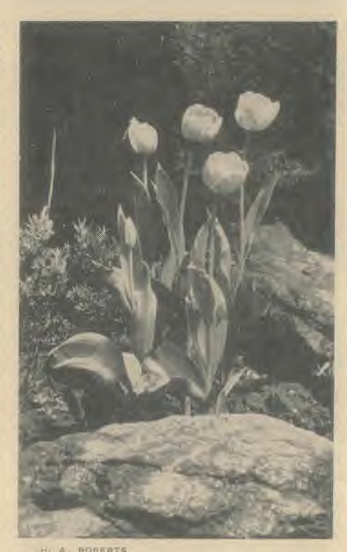
What man can describe that which he has not seen, known or experienced? Referring to the new earth, God tells us that eye has not seen, or heart imagined, the wonders of it.

Although everything about the new earth is not revealed, it is assuring to know that no tempter will be there and thus there will be no possibility of wrong. The overcomers will be there. "Thy people also shall be all righteous: they shall inherit the land forever." Isa-