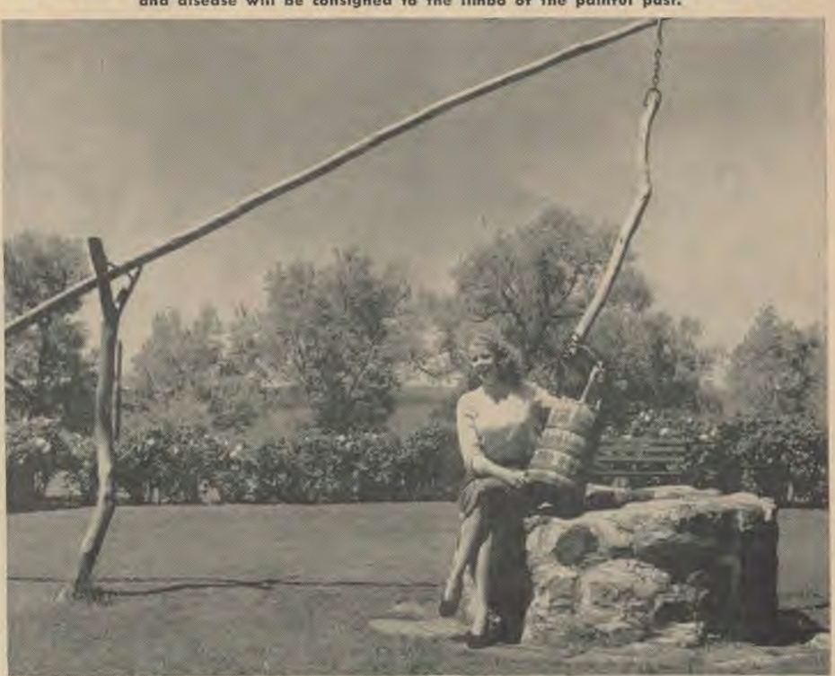
CANADIAN PACIFIC RAILWAY