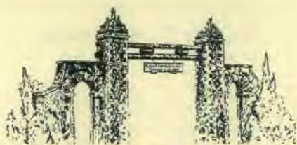
SOUTHWESTERN JUNIOR COLLEGE