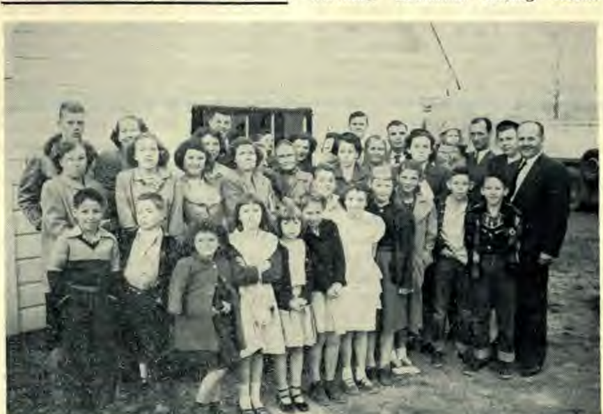
Fine group of believers in Georgetown, Louisiana

Sabbath, February 20, was another important date in northern Louisiana. On this day the Georgetown church was organized. This is the third church to be organized in northern Louisiana during recent