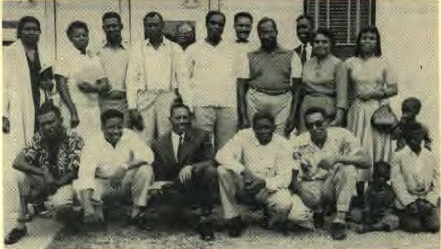
Shown in this picture are some of the officers of the Berean SDA Church with the inmates of the Louisiana State Police Barracks.

Consecrated laymen of the Southwest Region Conference are sincerely following in the footprints of the Master as they put into practice His words, "I was in prison and ye vis-