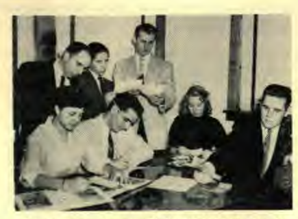
Ozark Academy FLINTONIAN Staff

the industries and regular work assignments where they learn dependability and often a lifetime trade, there are opportunities for social development in various types of leadership.