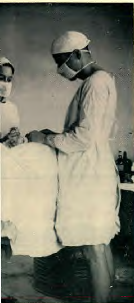
I operating in Bigobo Mission.