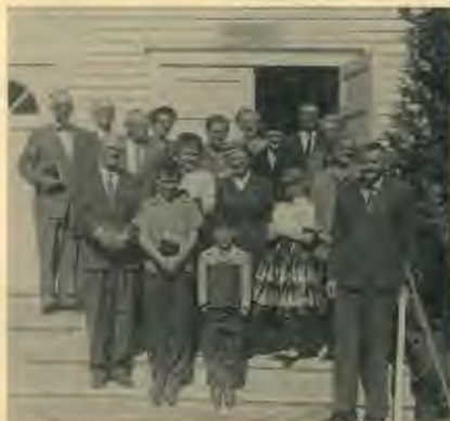
Alva, the 39th largest church in Oklahoma, led the conference in Sabbath school offerings by giving 83c per member during the second quarter. Always represented in the top 10, Alva's members heaped together a sum equal to 15% of their tithe to reach this spring peak in mission giving. The next seven ranking churches include Fairview 82c, Guyton 73c, Okeene 71c, Claremore 59c, Elk City 56c, and Enid 51c. If you'll give a dollar — NOT A DIME — then your church may be first next time.