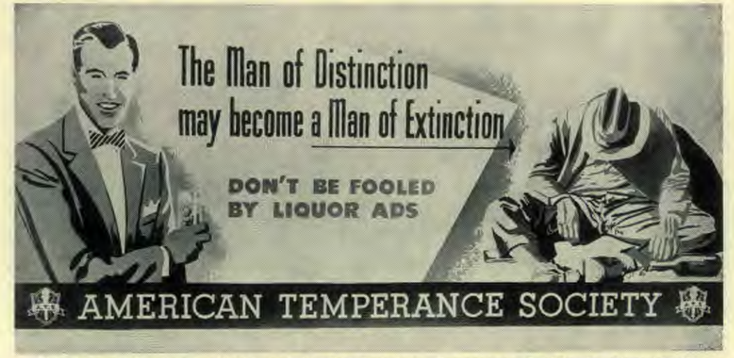
This is one of many methods used by the American Temperance Society to advertise the cause of temperance.

Is it necessary with Seventh-day Adventists to cite statistics in proof of the fact that the amount of crime (Continued on page 13)