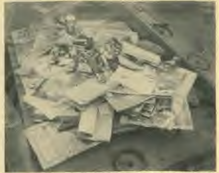
Items laid on altar of sacrifice by students during Week of Prayer at Sandia View Academy.

At the last chapel service of the week on Friday morning, after a short sermon on the superior merits of the way of Love, opportunity was given the students to testify. It was at this point that the Holy Spirit's workings became definitely manifest, for, without prompting, but very spontaneously, the students began to testify most earnestly before their fellow students. It was a wonderful testimonial meeting. The chapel service began at 11:30 a.m. and was to con-