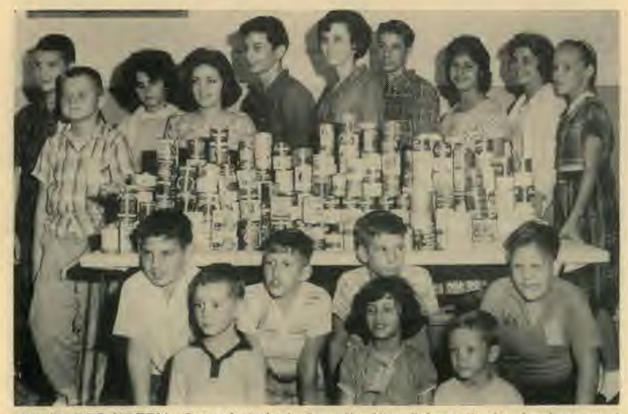
TREAT FOR NEEDY: Several students from the New Orleans Junior Academy went out house to house asking for food for Thanksgiving baskets on Halloween night, October 31. One hundred and seventy-three cans were received, and the young people had a wonderful time helping those who need our aid.