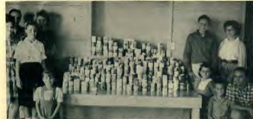
Corpus Christi Church School collected 463 cans of food on "Trick or Treat" night.