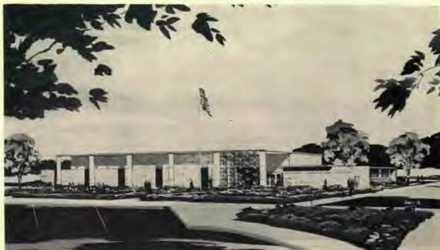
The artist's conception of the now-completed Findley Memorial Library, located on the campus of Southwestern Union College, is one upgrading move fully realized.