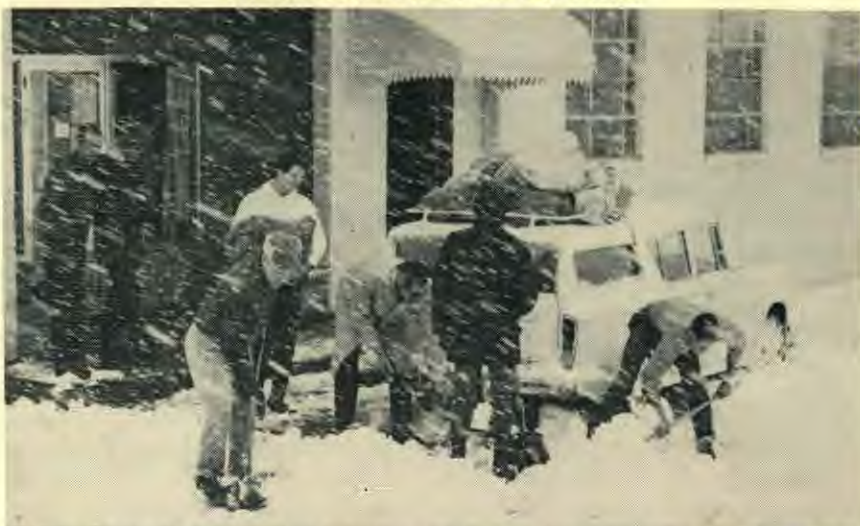
A 13-inch snow blanketed Keene, Texas, January 15 and 16. In an effort to get mail bags of THE RECORD to the post office, employees of the College Press, printers of the Southwestern Union paper, shoveled a path through ice and snow.

Waco KWTX 1230 9:00 AM Wichita Falls KWFT 620 7:30 PM