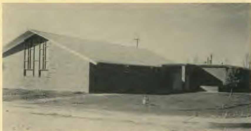
The Clayton, New Mexico, church, dedicated December 21, 1963.