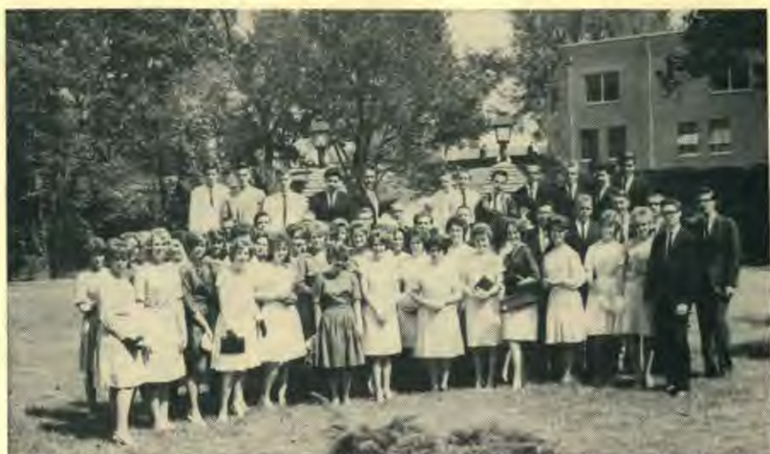
Christian education for the youth of Oklahoma has been strengthened by the academy merger with the Arkansas-Louisiana Conference. This school year, Oklahoma is represented at Ozark Academy by approximately 75 fine students from across the conference. Let us plan to increase the enrollment next year! Where will your academy students be enrolled?

Share your faith in song with the Japan Missionary College Choral Arts Society whose singing has dipped deep into thousands of hearts and thrilled them with the message of truth. This new recording group has received high recognition for out-