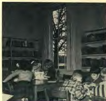
Even the Berean Elementary School can enjoy our library.