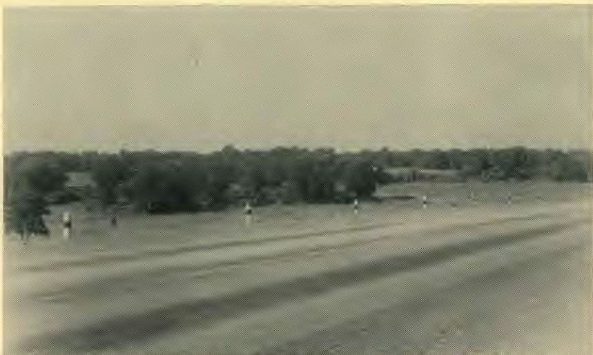
The six and one-half acres of wooded hillside pictured above is the property recently purchased by the Denton church. It is an ideal location for their new church home, only two and one-half miles from the Denton square. The property faces four-lane Highway 288, and is only one block south of the expressway to Dallas. Elder Herbert Christensen, district pastor, reports the building site is clear of debt. The area is one which promises to increase in value as it develops. We look forward to seeing a lovely new church there in the not-too-distant future.