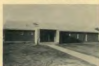
The San Angelo church, interior and exterior.