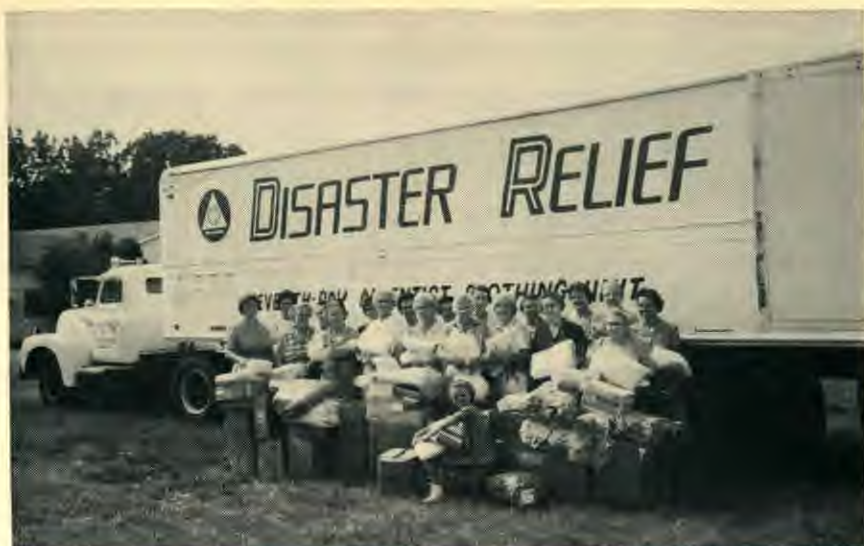
Dorcas Welfare ladies ready to load 36 layettes and $1,000 worth of new clothes on the Oklahoma Conference Disaster Relief Van.