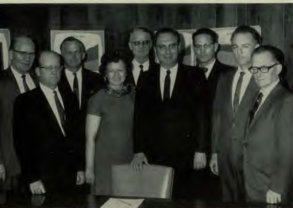
Faith for Today's house committee plans for increasing the evangelistic impact of the telecast. The objective of this group is to devise ways and means of more effectively reaching hearts for Christ.

Televising of the everlasting gospel cannot be done in many centers of earth. Faith for Today cannot be viewed in Russia and vast areas that lie behind the iron curtain. Also, many non-Communist areas do not sell religious TV time.