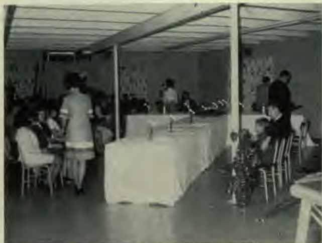
(Left) A communion service climaxed the Jefferson Academy week of prayer. A special communion table in the shape of a cross was used. (Right) Students and faculty join in the communion service.

Many blessings and victories were gained by students and faculty alike. Our prayer is that we may keep and develop the love experience gained during the week.