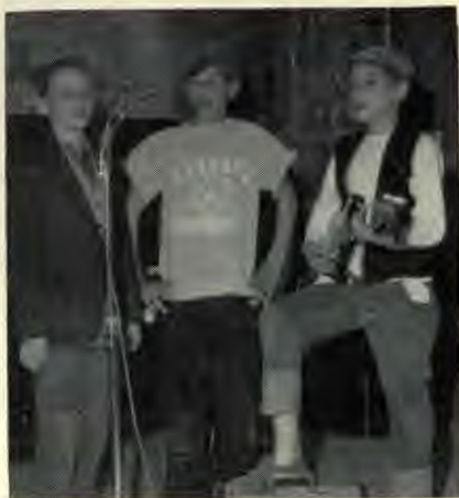
(Above right) Three youth from the Arlington church entertain ministers and families during the recreational program.