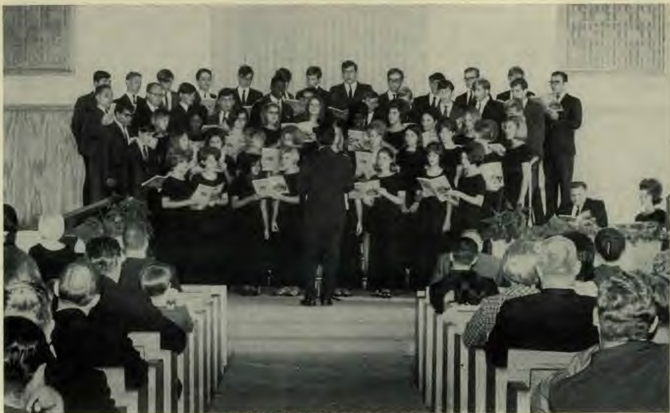
A full church listens to the V.G.A. Choir present "Born a King."