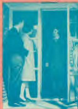
America's favorite hymns are featured on a coming Faith for Today telecast. Hymns carry their own message of Christ's love.