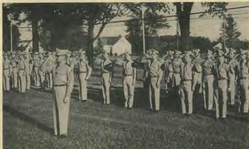
A Medical Cadet Corps training group at Camp Doss