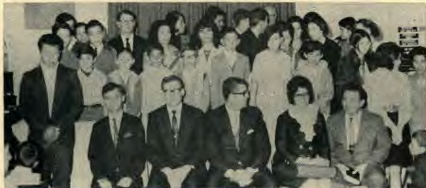
Evangelistic team seated in front row and 28 persons who were baptized on March 22 in Santa Fe, New Mexico.