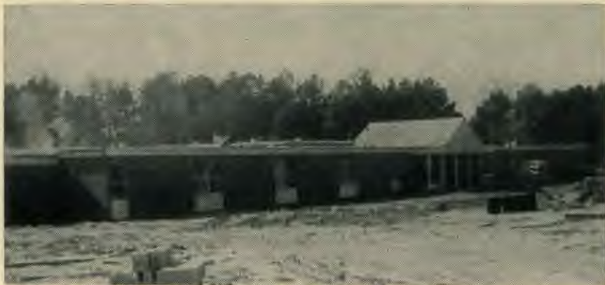
New Marion County Hospital, Jefferson, now under construction.