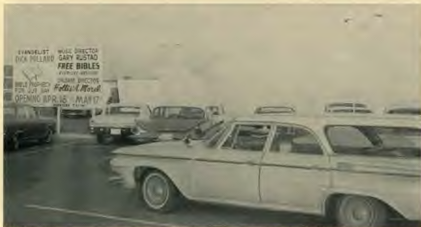
Display sign board and entrance to air cathedral are seen in this parking lot view.

Pastor Ray Wing and Dr. M. L. Dunkin completed another Five-Day Plan April 28 with a class of about 35. This is the fifth Five-Day Plan