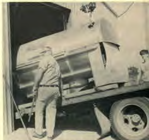
Workmen unload heavy-duty washer in VGA laundry.