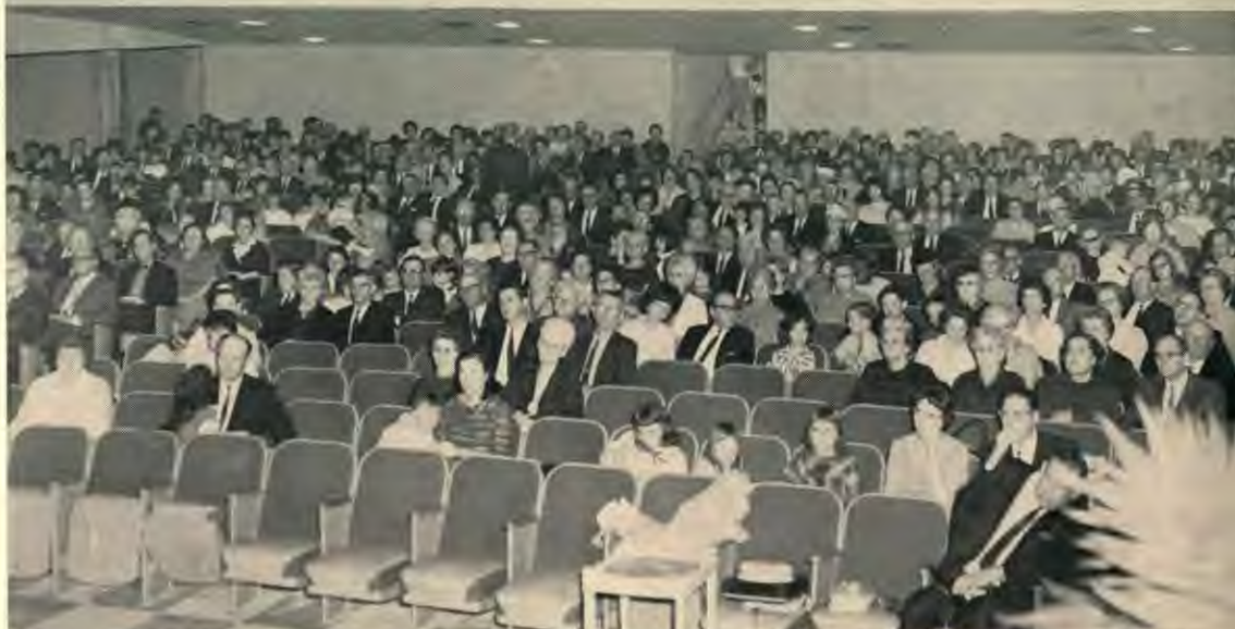
Oklahoma members that gathered in the Del City High School Auditorium for "GO TELL" congress.