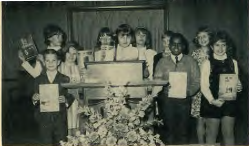
(Above) Young people of the Lawton church show the "Amazing Facts" Series used as a follow-up plan in "GO TELL."