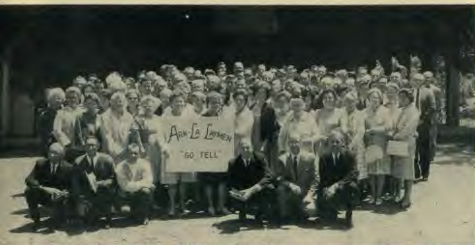
Laymen and ministers of the Arkansas-Louisiana Conference gather for three-day laymen's congress at Yorktown Bay in the early part of May.