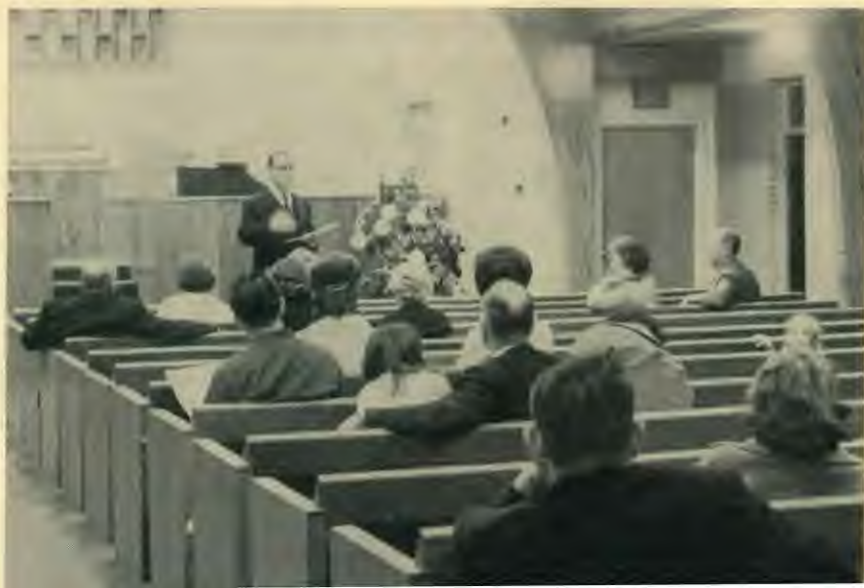
Elder J. V. Schnell holds the lay visitors' training course in his Oklahoma City Southern Hills church.

"GO TELL" materials were used as visual aids and demonstrations were given in the various aspects of "GO TELL." The "GO TELL" lay visitors' training course was conducted in 50 churches of the Oklahoma Conference.