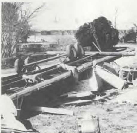
Mobile homes collapsed