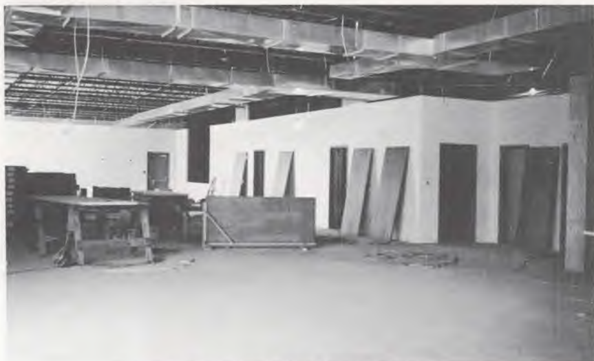
Interior of the new SUC cafeteria is taking shape.

The Committee of 100 Cafeteria will be a building in which each member of the Southwestern Union Conference can look with pride. It has been built with economy in mind and yet with durability and beauty. Occupancy should be some time in the middle of May.