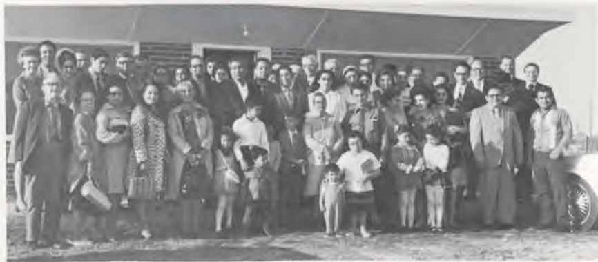
The church members and visitors are gathered in front of the church after the organization and a Sabbath filled with blessings.

Every division reached the goal that they had set. The cradle roll had a little tree with bags on it for each child to put his money into. The kindergarten started out with large paper flowers to sell. After a few months they changed to a treasure chest to put