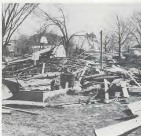
Debris was everywhere.

The van was parked for service on Main Street of the city. Almost imme-