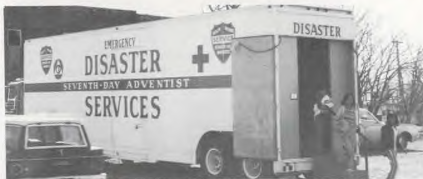
Almost immediately the tornado victims came to receive help.

ONLY MEN DELEGATES , officially selected by their church can attend — plus a small selected group of observer guests.