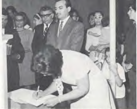
This is a solemn but happy occasion as the charter members sign the church register completing the list of 34.

During the 17-week telecast which began last December and ended March 28, more than 6,000 viewers phoned and wrote requesting copies of Elder Vandeman's books. With the mailing of these books, I Met a Miracle , Planet in Rebellion , Happiness Wall to Wall , Destination Life , and A Day to Remember , a free Bible course card was also included. To date 613 requests for