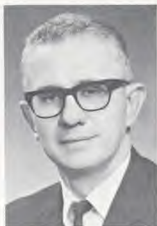
E. C. Wines