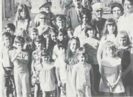
Weslaco VBS children and their leaders.