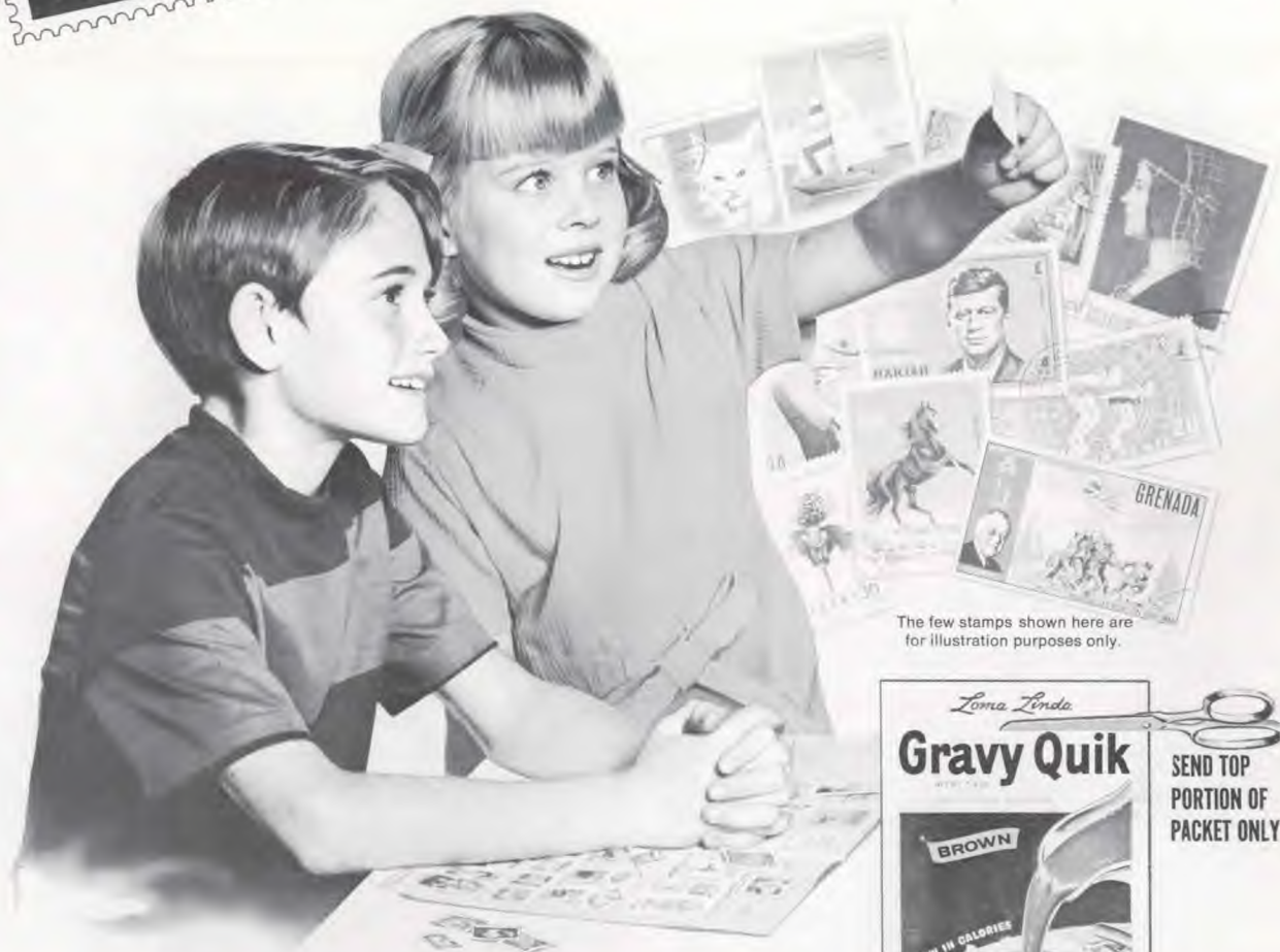
The few stamps shown here are for illustration purposes only.

Reg. $1 00 retail value only 25¢ and the Loma Linda name from 3 Gravy Quik packets