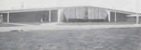
The two buildings of the Keene Adventist School are nearly identical.

tenance of student interest, with special emphasis upon displays of student work, and provisions for nature appreciation through attractive and well-planned displays of living things — plants, birds, animals, and insects. . . . Custodial and maintenance services appeared to be of outstanding quality, as evidenced by the neat and well-kept appearance of both buildings. . . . Based upon the generally high-quality program observed. . . . It is recommended that the Keene Adventist school be granted accreditation."