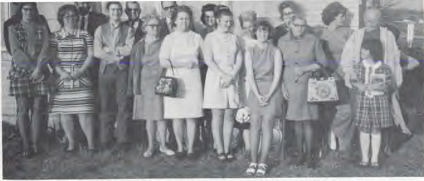
Break-thru Visitation teams following afternoon of visiting in Denison-Sherman area.

ings of the Holy Spirit as both young and old turned out at this initial meeting.