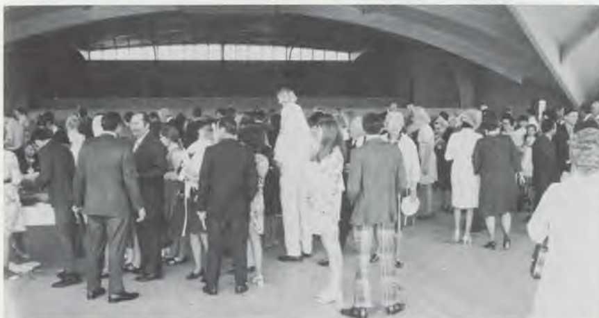
SUC alumni and friends enjoy Sabbath fellowship dinner in the Pultar Pavilion.

An innovated high light of Alumni Weekend this year was the potluck lunch held in the Pultar Pavilion. Several hundred were present, as the accompanying picture indicates, and by show of hands, the alumni voted to