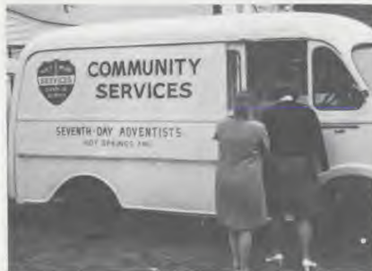
The Hot Springs Community Services van is in readiness to meet the needs of the area. They also have a fine health and welfare center.

In January all three stations were invited to send their news cameramen to