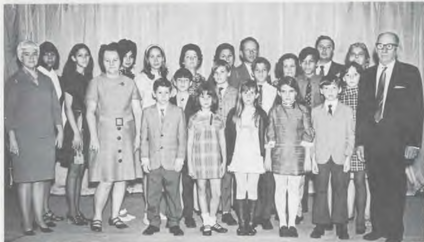
First group that was baptized in the Franklin Avenue church on Sabbath, March 20.