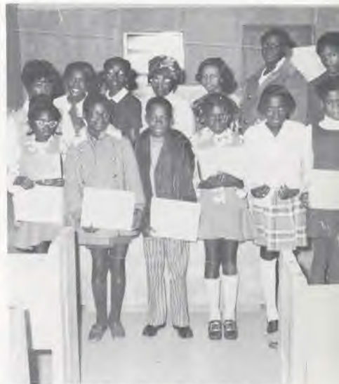
Part of the Pine Bluff graduates proudly show their diplomas.

Soul winning is the primary goal of Pine Bluff; by God's grace, the saints have come rejoicing bringing in 20 precious sheaves for graduation. The diplomas given and the fellowship wit-