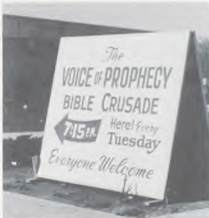
Attractive sign calls attention to the follow-up meeting being held weekly in the Tulsa church.