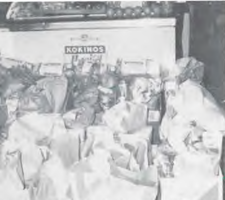
The food baskets shown in the accompanying picture were made up in Monroe, Louisiana, and delivered to 12 needy families. It would be hard to tell which of the two were more blessed—the receiver or the giver.