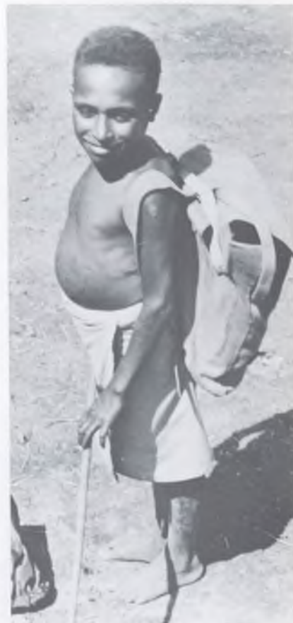
Your Spring Mission Offering will also help keep medical supplies in this carrier boy's kit as he goes on walkabouts among the Kukukuku people of New Guinea. The Kukukukus are some of the most primitive people on earth today.

By the way, I wonder what our dollars will become where they speak Sesuto and Sinhala?