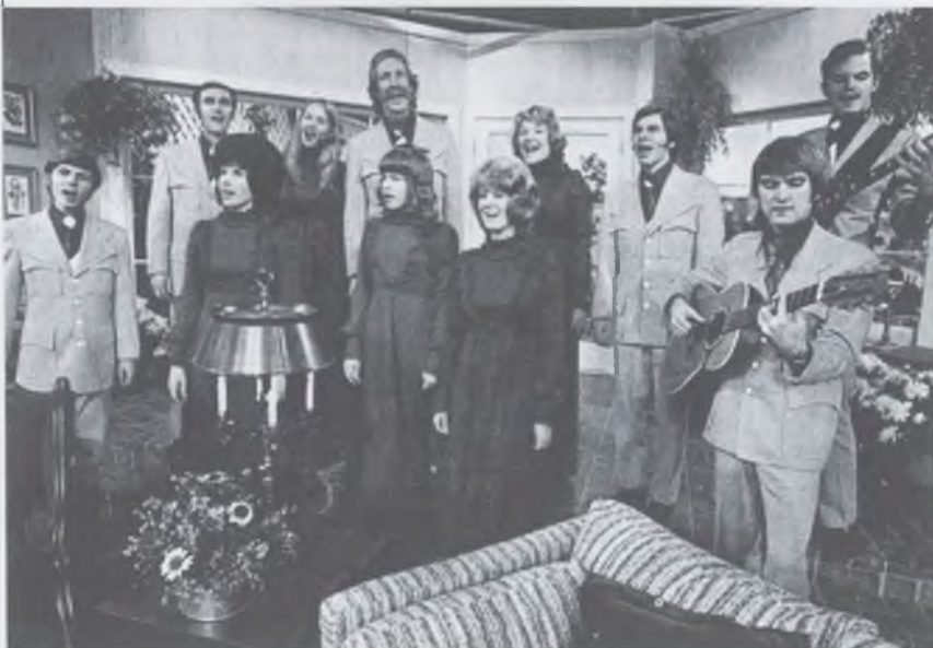
(Below) Heritage Singers U.S.A.