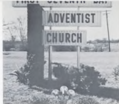
Church sign at the Shreveport First church placed in memory of James E. Simpson.