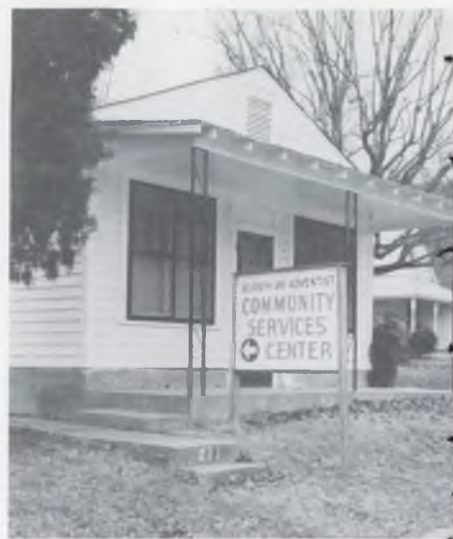
Hot Springs, Arkansas, Community Services Center.

It was not difficult to see that these people were doing a work of love. During the interview an official from a