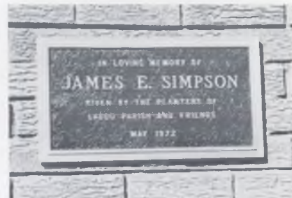
Plaque set in new sign for Shreveport church.