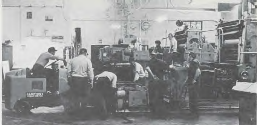
Professional movers and SPA pressmen worked side-by-side dismantling, moving, and reassembling the presses.

Those desiring to make wills, trust agreements, and annuities, should make them in favor of the legal association rather than the conference. Write your conference association or Director of Deferred Giving for further information.