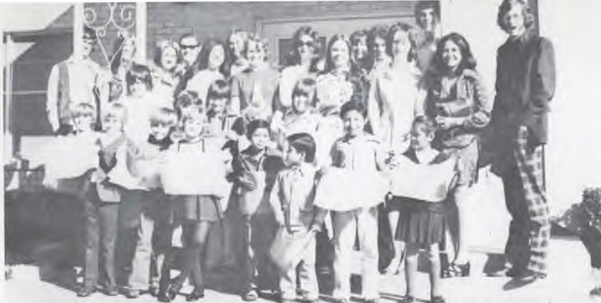
Chisholm Trail Academy students and children at Alvarado story hour.

Texas First Methodist Church Friendship Hall. Many children from the surrounding community have enjoyed the songs, stories, and crafts which have been skillfully directed by happy, experienced young people who really care about others.