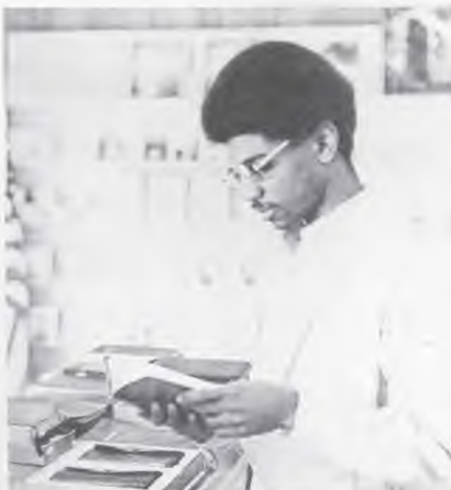
A large variety of Bibles is available.