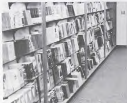
One area featuring gift ideas.