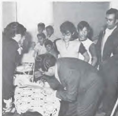
Roswell Spanish church organized January 26, 1974.

In 1965 a small lot was purchased on Mulberry Street and the members