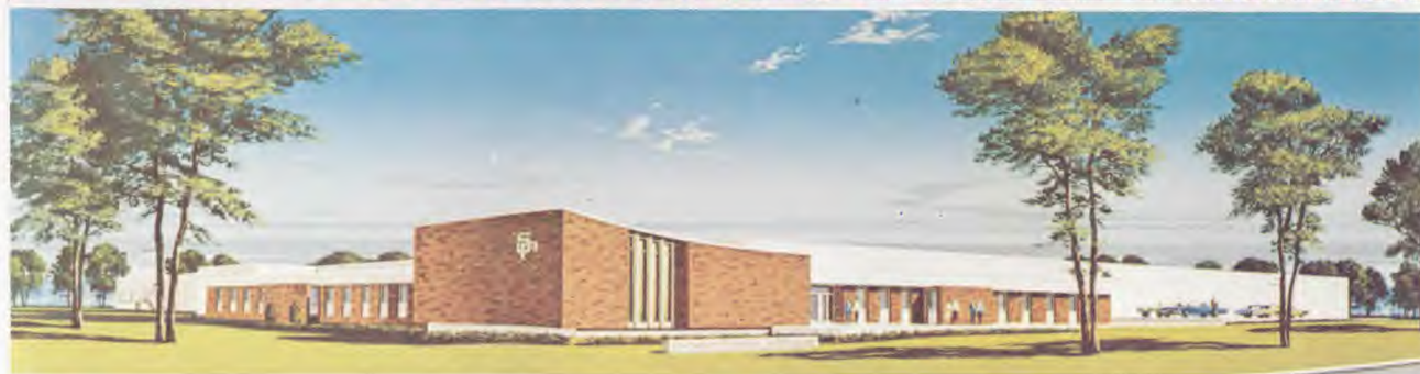
THE NEW SOUTHERN PUBLISHING ASSOCIATION