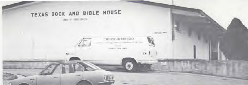
Book van and spacious facilities of the Texas/Southwest Region Adventist Book Center.