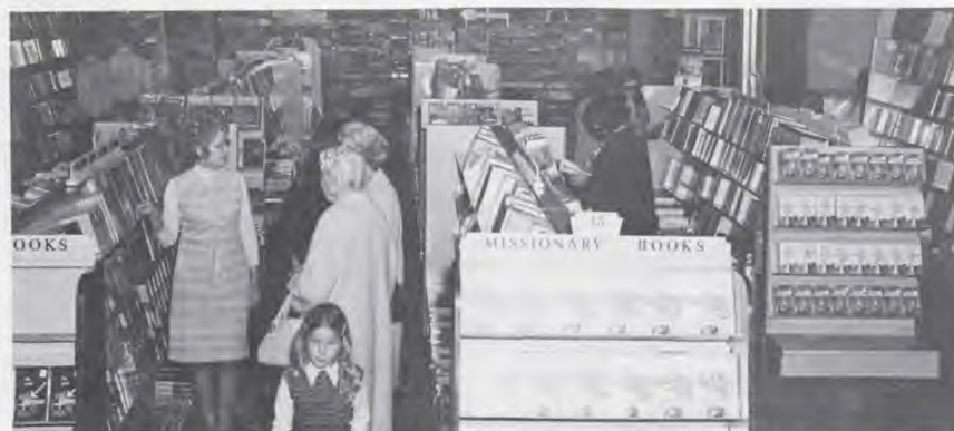
Very attractive displays make shopping a real pleasure in the Adventist Book Center.