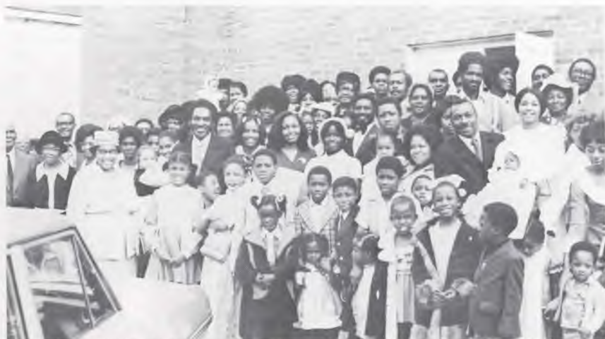
Large group of members who gathered in Hammond for Joint meeting.