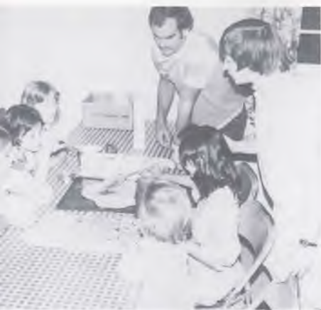
A look in on cooking classes at Malvern's unusual vacation Bible school.