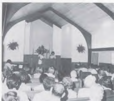
Interior of San Marcos church on dedication day.