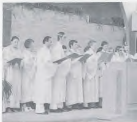
Fort Worth choir on dedication day.