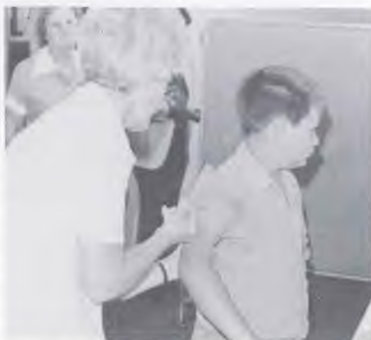
A youngster decides to look the other way on "immunization day."