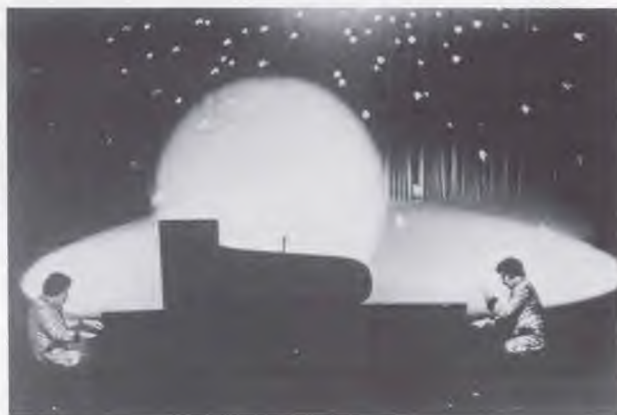
Duo-piano team, Ferrante and Teicher, will appear on campus Thursday night, November 11.