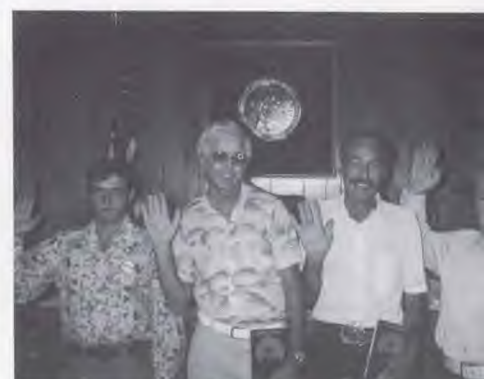
Some of the ex-smokers at the Guymon Five-Day Plan.