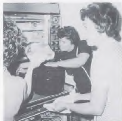
Ladies of the Heights church preparing the meal at the Ministerial Alliance meeting in Albuquerque.