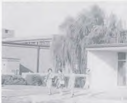
Beautiful entrance to Ft. Worth church.

clear waters of the San Marcos River just below Aquarena Springs. Two water falls formed the back drop for this beautiful early-morning service which was the beginning of the special Sabbath services.