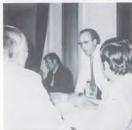
Some of the pastors in attendance at the luncheon of the Albuquerque Ministerial Alliance.