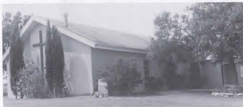
Beautiful San Marcos Church.

tables in the park property located on the rear of the church grounds.