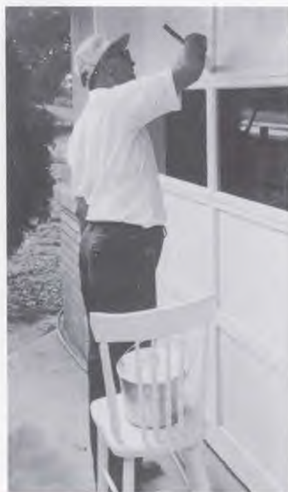
New paint everywhere at SVA!

to know more about the guidelines for our school. The study of Education, Counsels to Parents, Teachers and Students , and Fundamentals of Christian Education was pursued and various questions that arose as a result of this