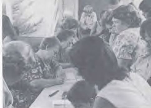
Volunteers and registrants prior to entering the building for the needle.