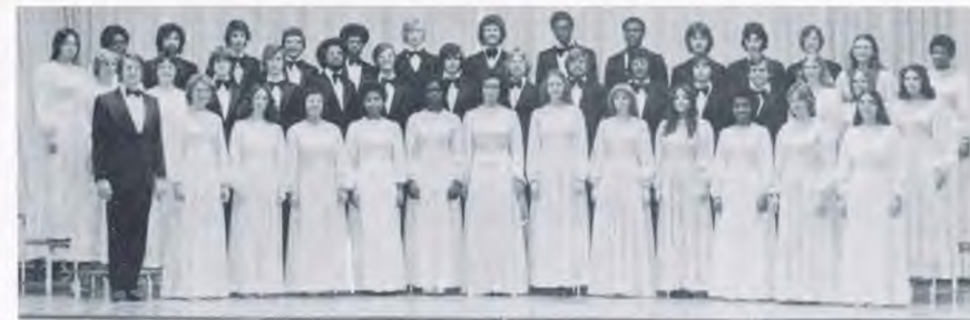
TAKE NOTE! scheduled tour of Southwestern Union College Choraliers to the Texico Conference

24 — Thursday Evening, 7:30 p.m., Central Church, El Paso, Texas 25 — Friday Evening, 7:30 p.m., Albuquerque Heights Church, Albuquerque, New Mexico