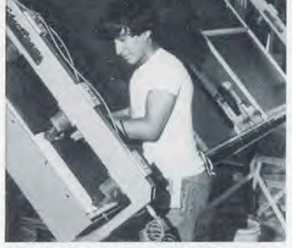
This student is employed at Brandoms on the campus of Ozark Adventist Academy in Gentry, Arkansas, Brandoms also has plants at Southwestern Union College in Keene, Texas and at Sandia View Acad-emy near Albuquerque, New Mexico.

Published twice monthly (24 issues a year) by Southwestern ColorGraphics, Keene, Texas, for the Southwestern Union Conference of Seventh-day Adventists. Price, three dollars a year, Second - class postage paid at Post Office, Keene, Texas 76059.