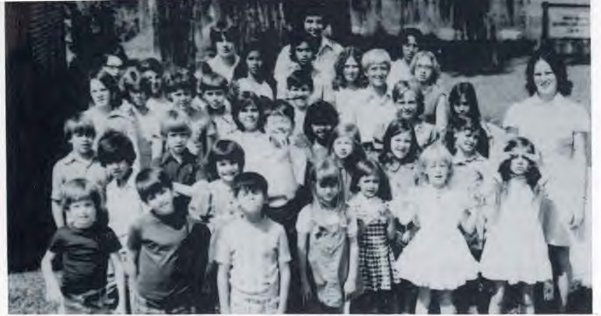
North Houston Church School family.

provements. The school opened on schedule thanks to the hard work and support of the church members. We also now have a 700-book library!