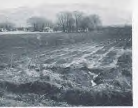
The 10-acre field to be used for vegetable