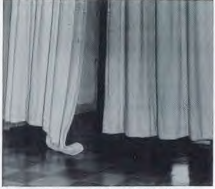
Old and worn curtains in SUC's Evans Hall.