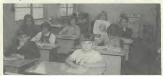
Minden, Louisiana, church school.