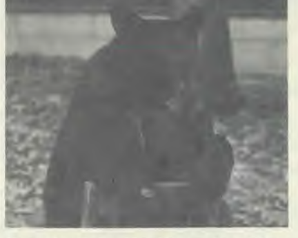
"Yorky" Is Waiting for You at CAMP YORKTOWN BAY