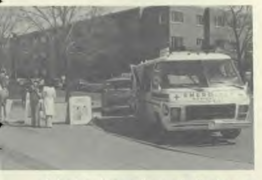
A local conference Community Services van brings Smoking Sam and other health education materials to the University of Nebraska.