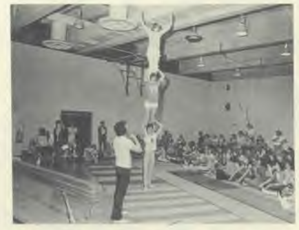
Andrews University's Gymnics put on an exhibition at Lincoln's East High School.