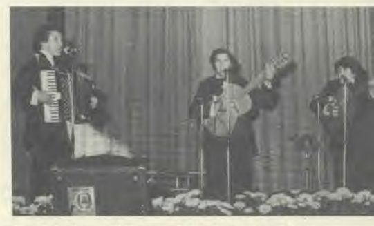
Los Caballeros Chilenos of Southwestern Adventist College thrill the audience with their testimony in song.