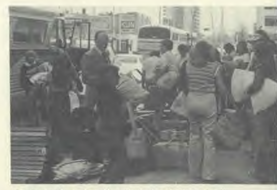
Students from Sandia View Academy unload their bus at the Radisson Cornhusker Hotel, festival headquarters.