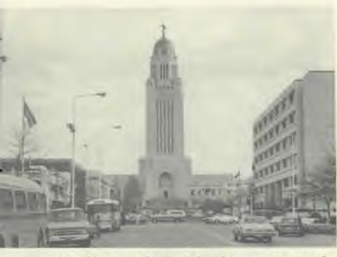
Lincoln, capitol of Nebraska, target city for youth witnessing.